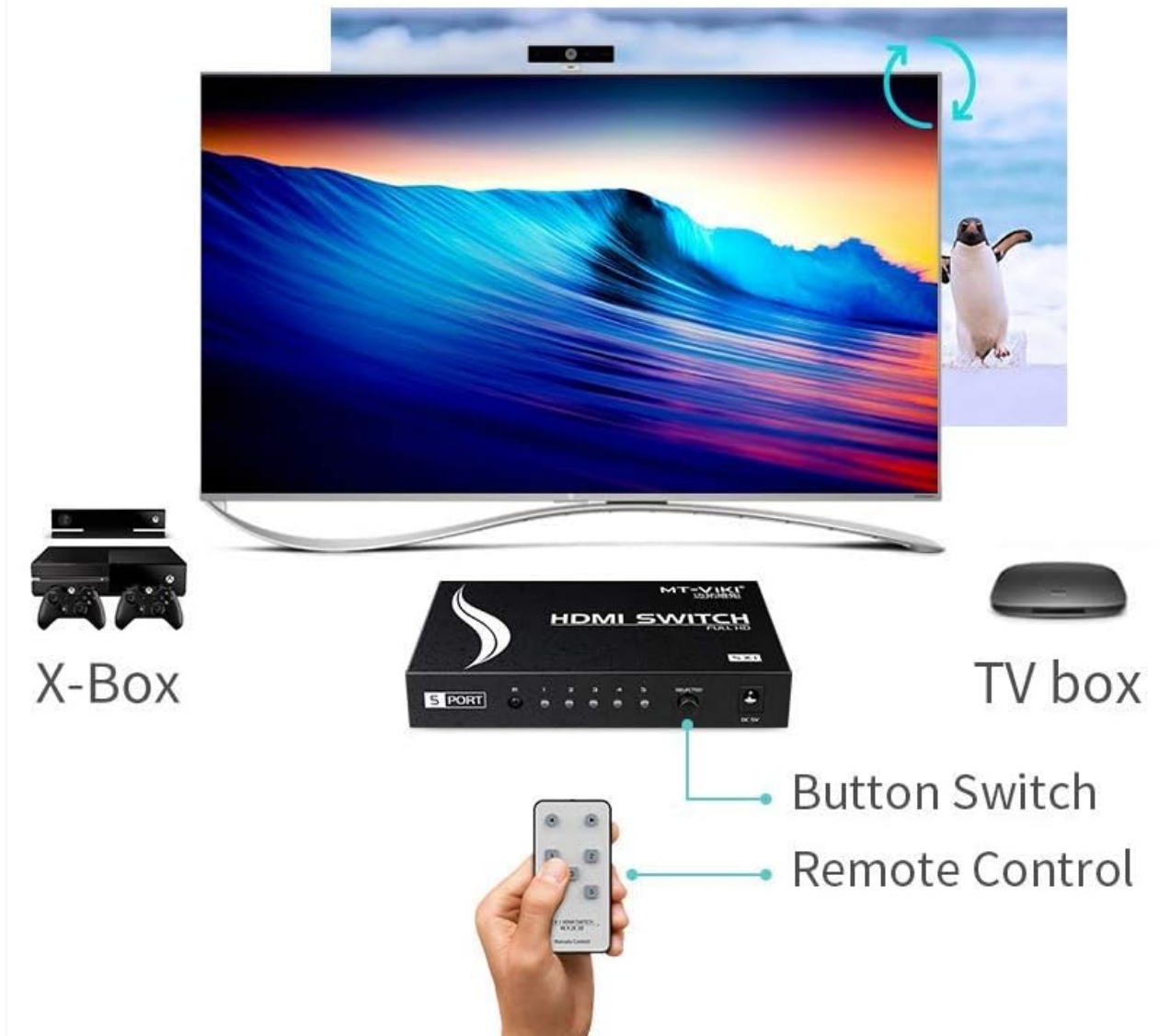
Image: IR Remote Control for the HDMI Switch.

Lets you swap HDMI channels up to 15 ft without needing to get out of your comfortable zone.