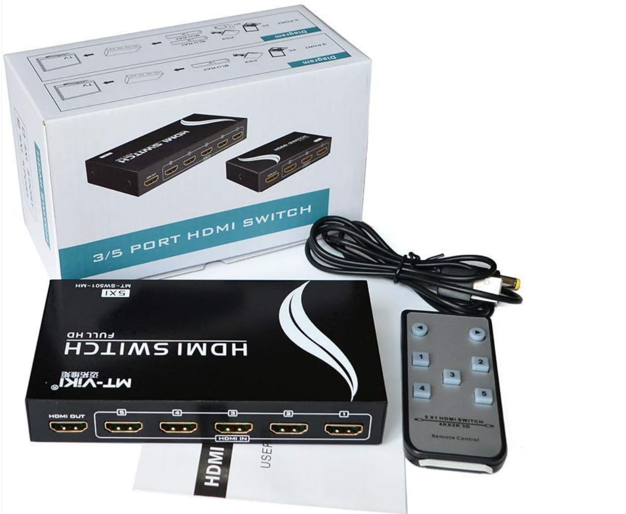
Image: Connection diagram for the MT-VIKI 5-port HDMI switch.

Video: Detailed guide on packaging and installation for the MT-VIKI HDMI Switch.