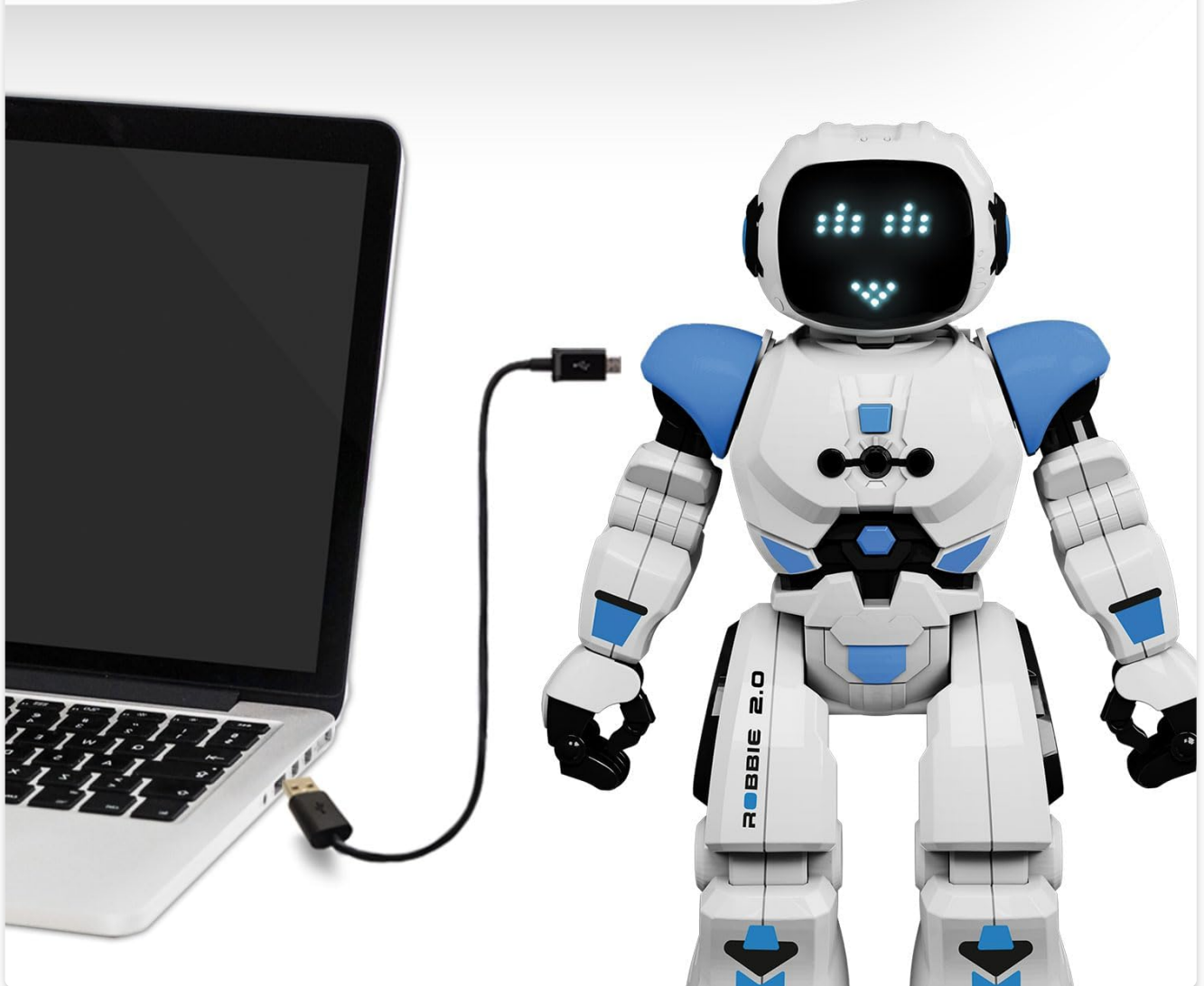
Image: The Robbie Robot connected via a USB cable to a laptop for charging.