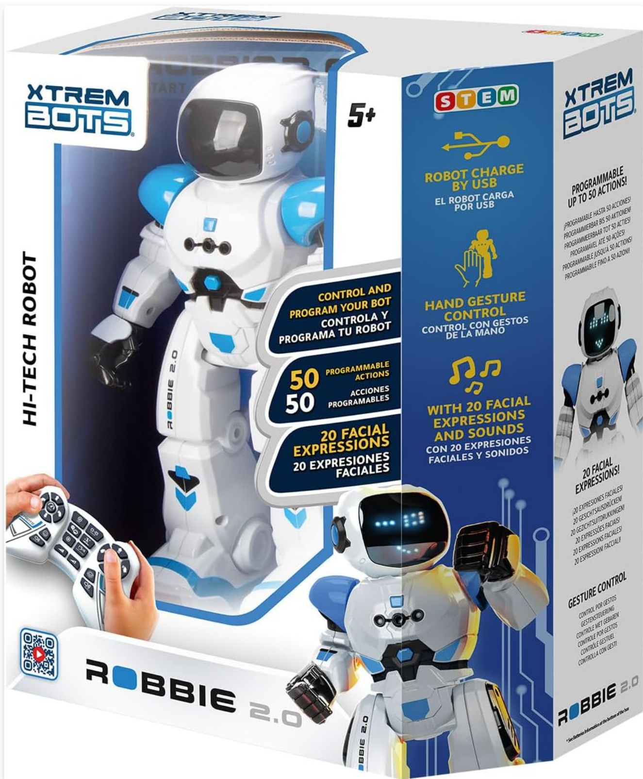
Image: The retail box for the Xtrem Bots Robbie Robot, showing the robot and remote control inside.