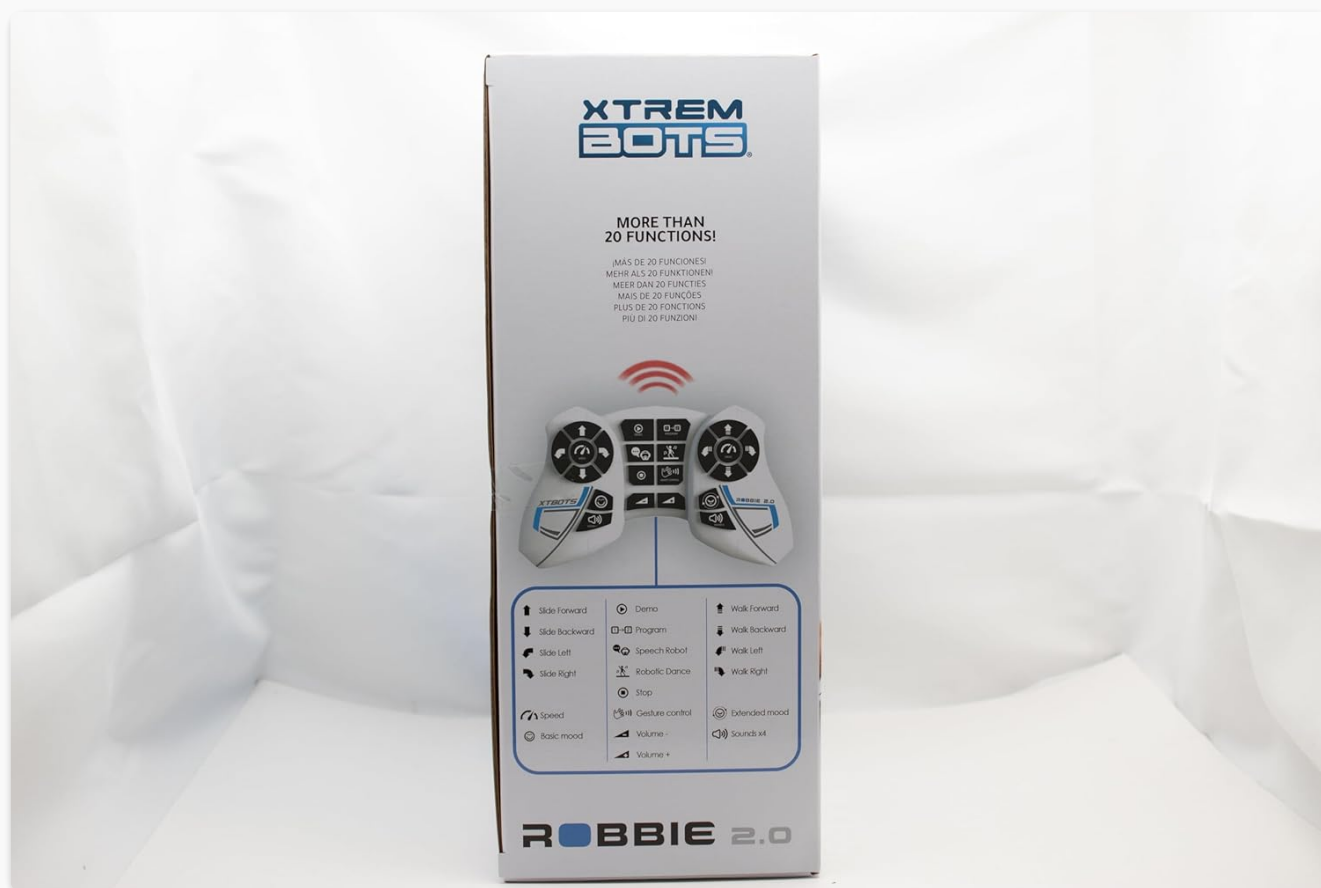
Image: A close-up of the remote control for Robbie Robot, with labels indicating various functions like walk, slide, speed, volume, dance, and program.