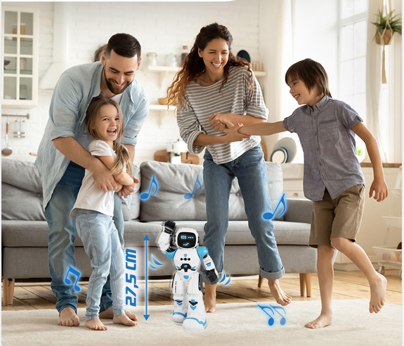
Image: The Robbie Robot dancing in a living room with a family, illustrating its dancing mode.