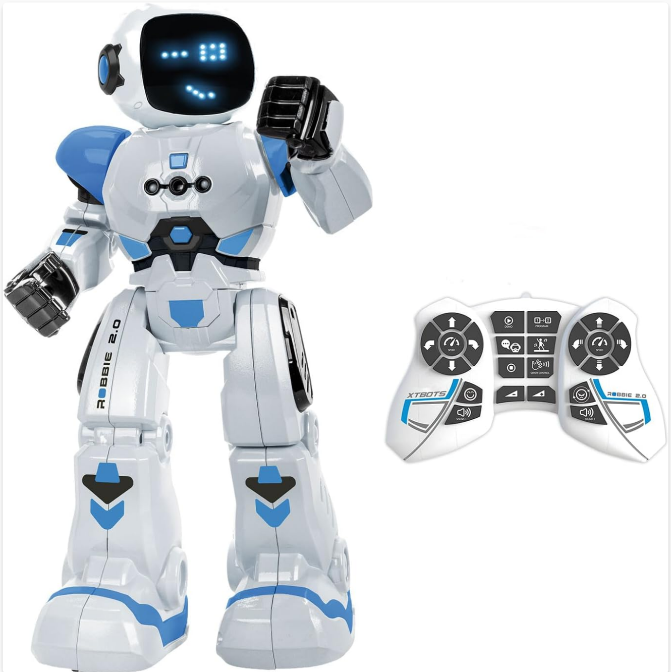
Image: The Robbie Robot in white and blue, standing next to its white remote control.