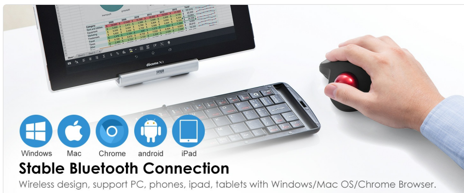
An image displaying icons for Windows, Mac, Chrome OS, Android, and iPad, indicating the wide compatibility of the SANWA Bluetooth Trackball Mouse with various operating systems and devices.