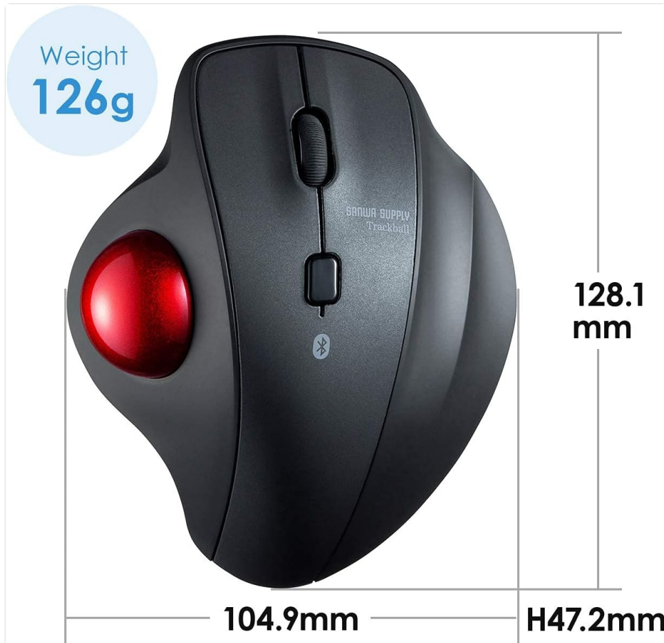
An image providing the physical dimensions (104.9mm width, 128.1mm length, 47.2mm height) and weight (126g) of the SANWA Trackball Mouse.