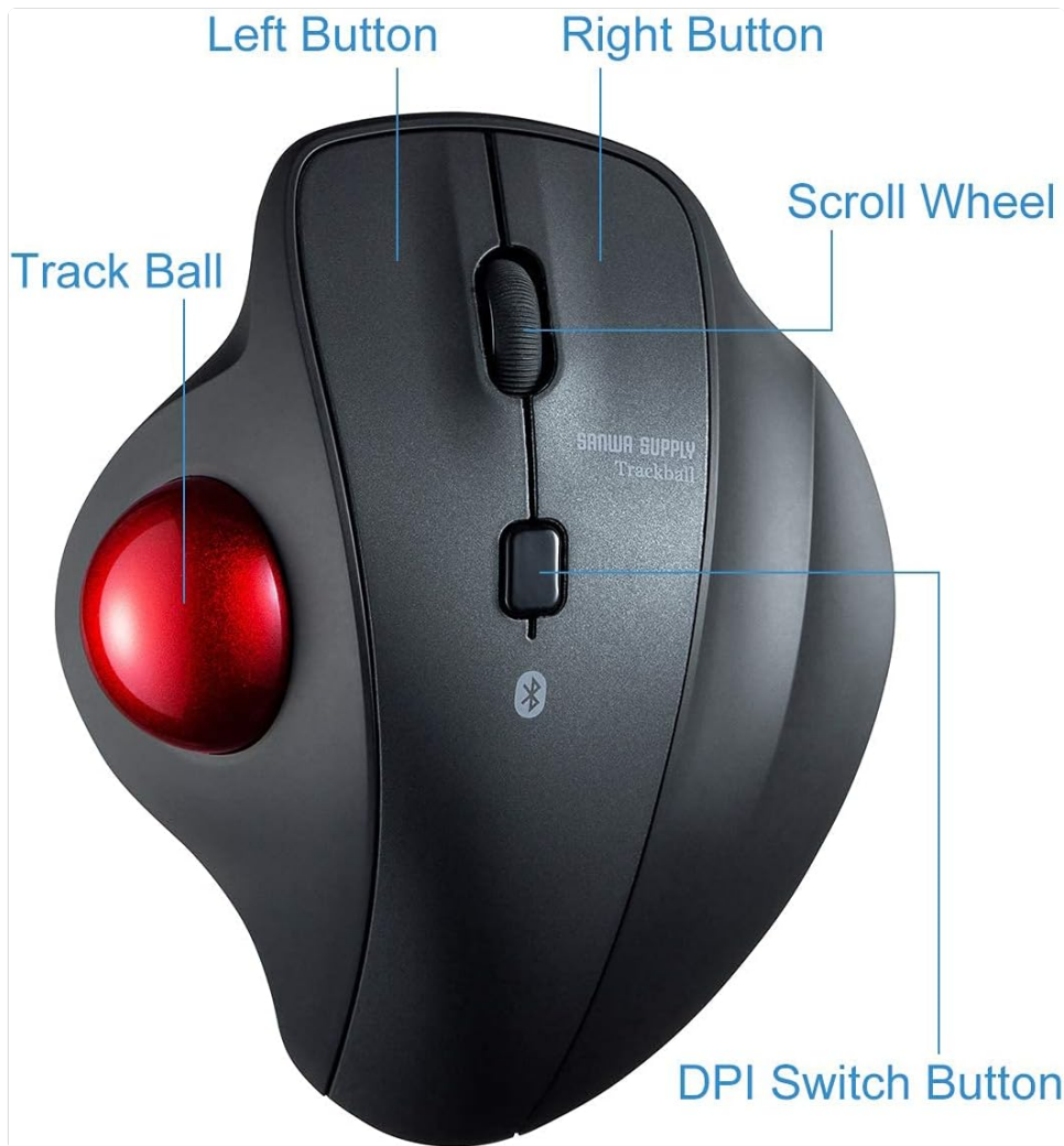
An annotated image of the SANWA Trackball Mouse, highlighting its key components: Left Button, Right Button, Scroll Wheel, Track Ball, and DPI Switch Button.