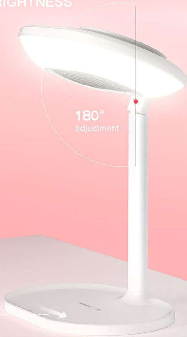
Figure 5: The LED desk lamp function, offering 6 levels of brightness adjustment. It has a color temperature range of 4100K-4500K, 25 lumens, and 1.5W power. Brightness can be adjusted with a light touch sliding motion.

Light touch sliding to adjust brightness