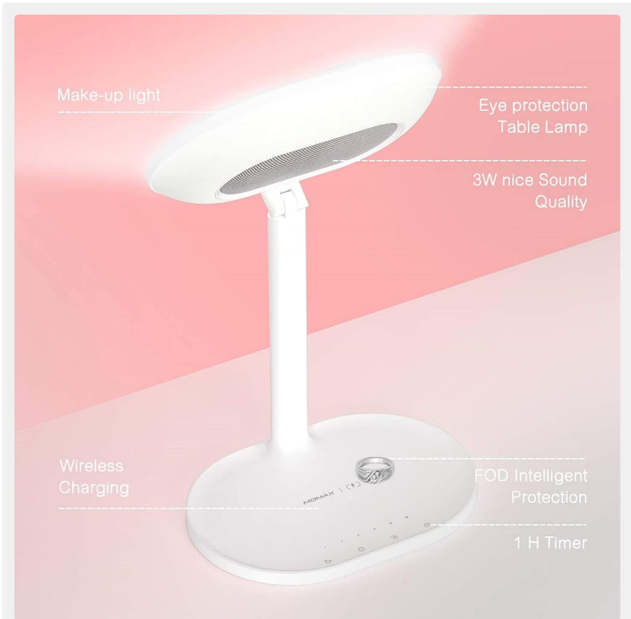
Figure 1: Overall view of the MOMAX Q.LED 4-in-1 Makeup Mirror, highlighting its integrated features including the makeup light, eye protection table lamp, 3W speaker, wireless charging pad, FOD intelligent protection, and 1-hour timer.