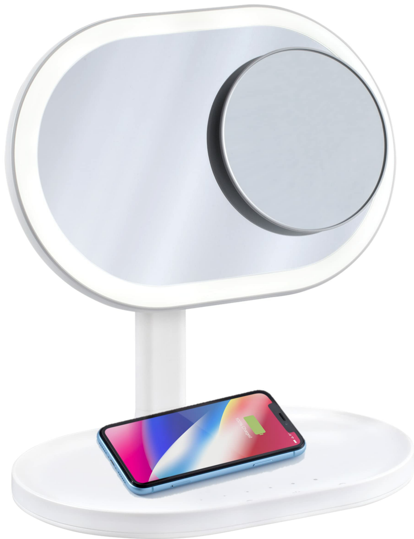
Figure 2: The makeup light feature with adjustable levels. Levels 1-2 are suitable for routine skin care, Levels 3-4 for full face makeup, and Levels 5-6 for detailed eyebrow and eye makeup or concealer application.