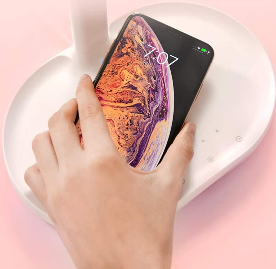
Figure 4: The wireless charging pad located on the base of the mirror. It supports 10W output for Android devices and 7.5W for Apple devices.