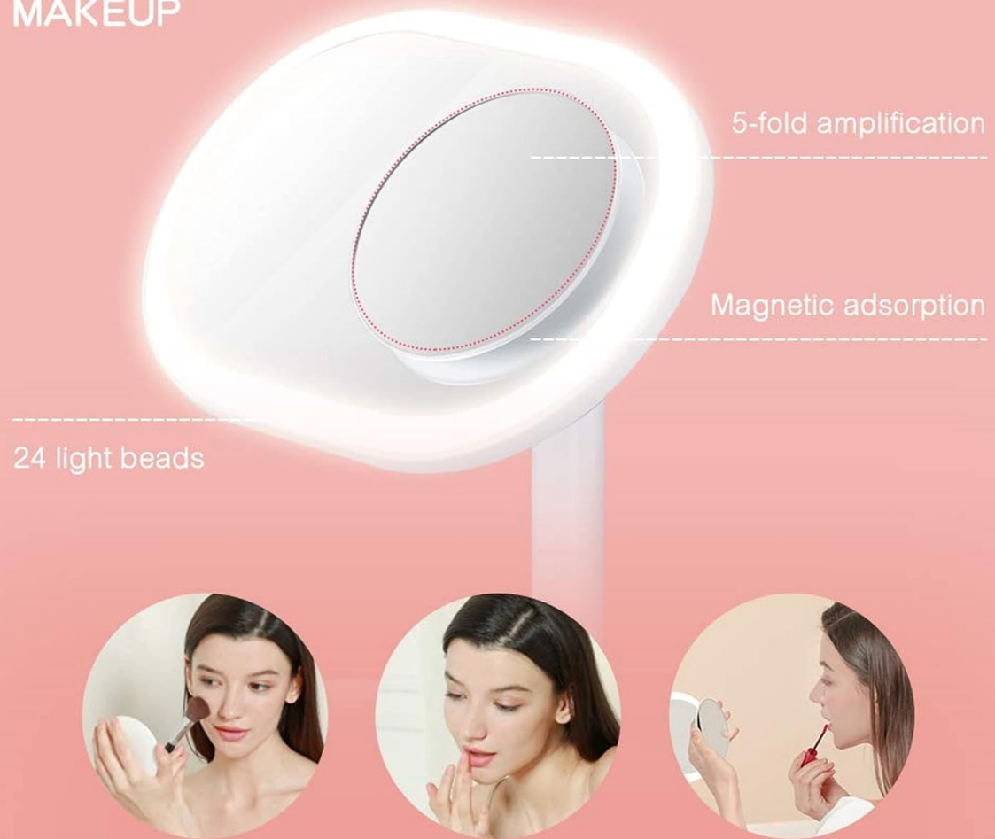
Figure 3: The 5x magnifying glass attachment, which magnetically adheres to the main mirror. It features 24 light beads for enhanced detail, aiding in precise makeup application.