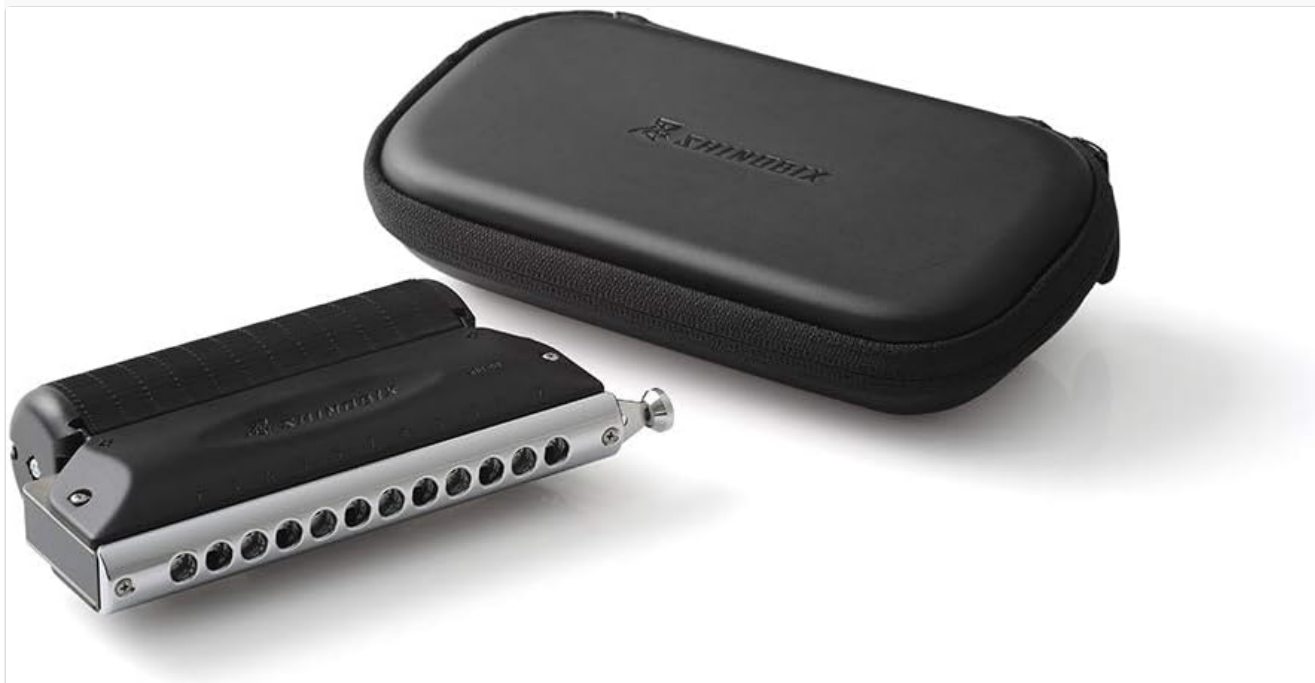
Figure 1: The Suzuki SNB-48 Chromatic Harmonica with Shinobix Silencer and its included semi-hard case.

The Suzuki SNB-48 Shinobix Chromatic Harmonica with Silencer is designed for musicians who wish to practice without disturbing others. This innovative instrument combines a high-quality chromatic harmonica with a detachable silencer, significantly reducing the sound output while maintaining playability. This manual provides essential information for the proper use, setup, and maintenance of your SNB-48 harmonica.