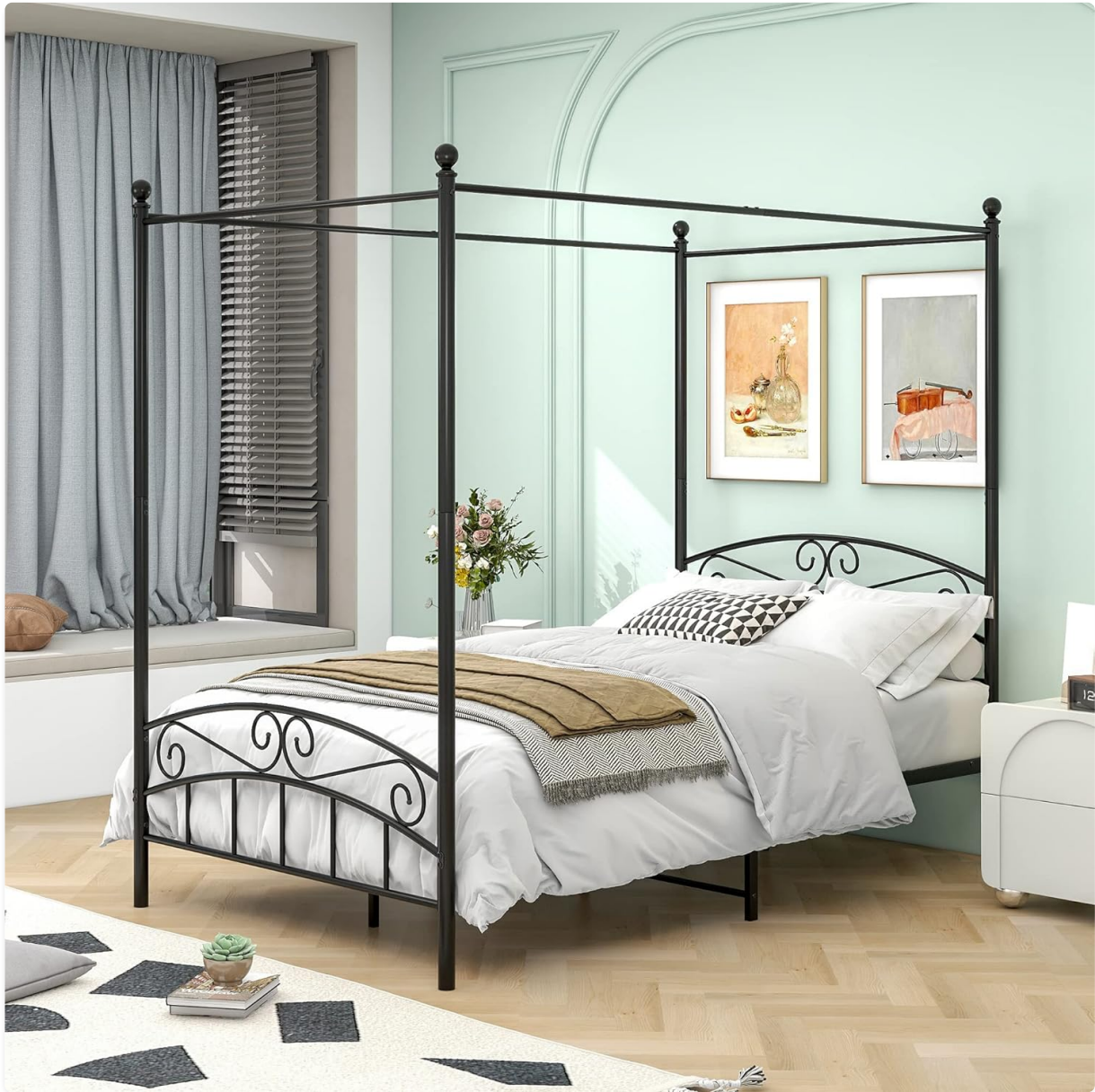
Figure 1: JURMERRY Metal Canopy Bed Frame (Full Black) in a bedroom setting, showcasing its four-poster design and elegant headboard and footboard.