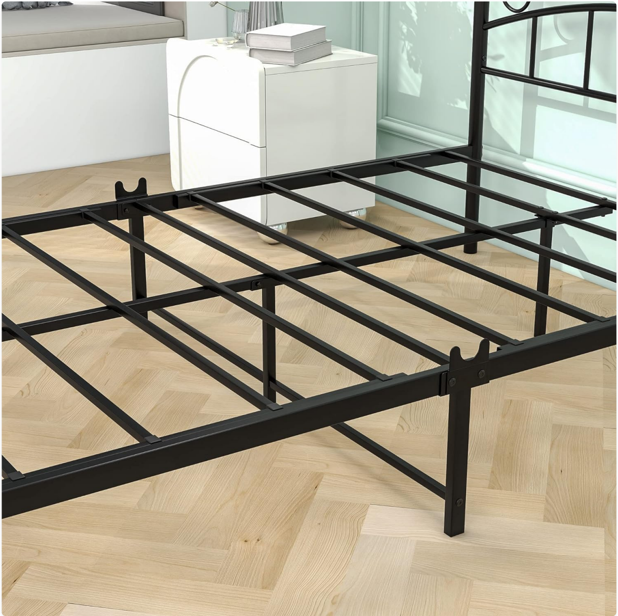
Figure 3: A detailed view of the sturdy slatted structure and central support legs, designed to provide robust mattress support.