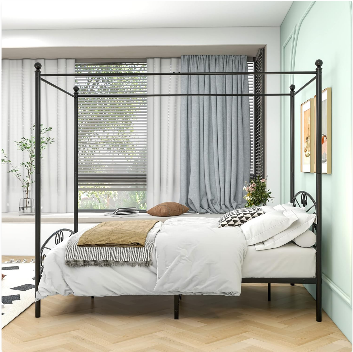
Figure 4: The assembled bed frame with a mattress and bedding, ready for use, highlighting the spacious under-bed area.