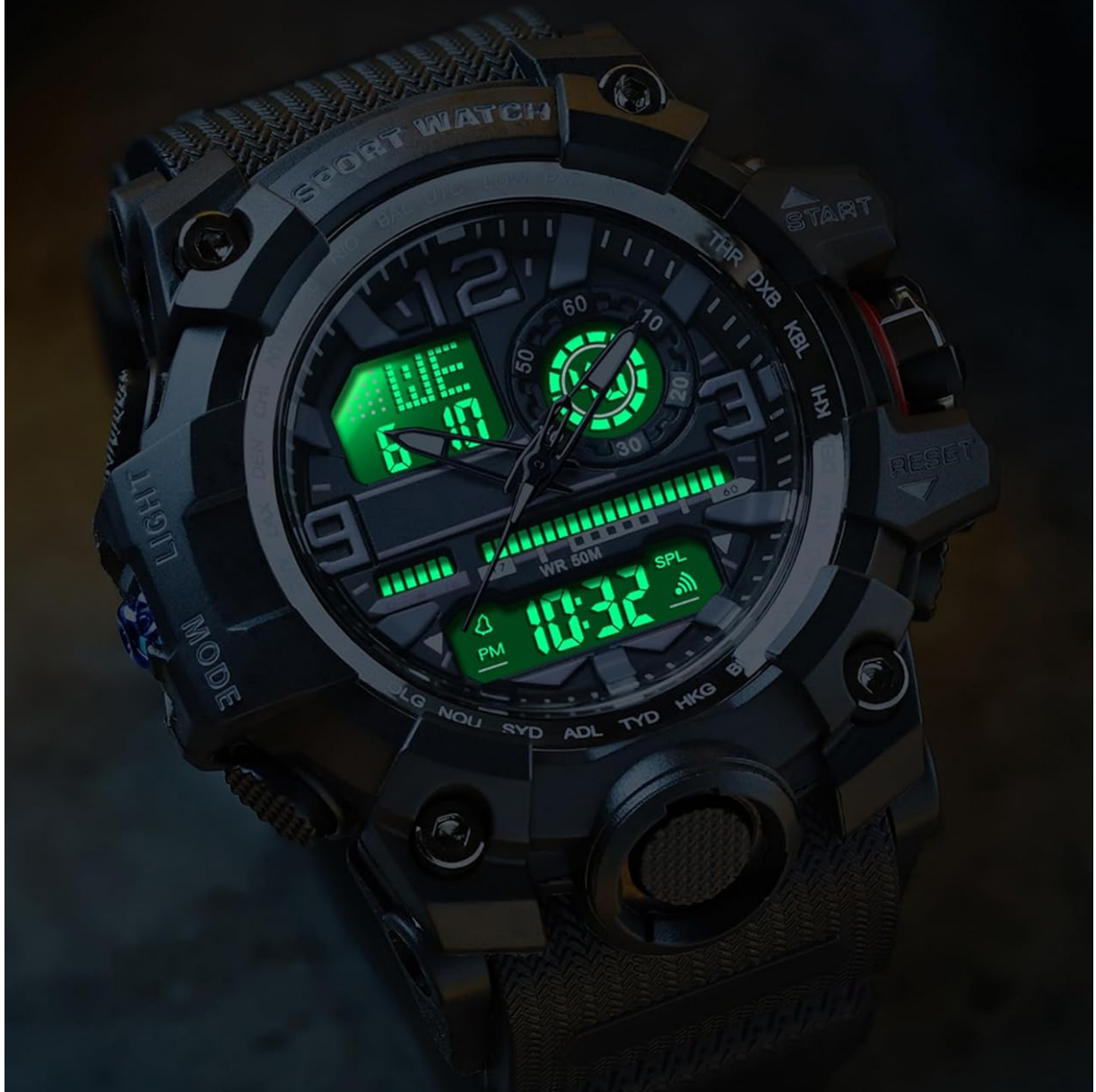
Image: Night Vision Cold Light Feature.