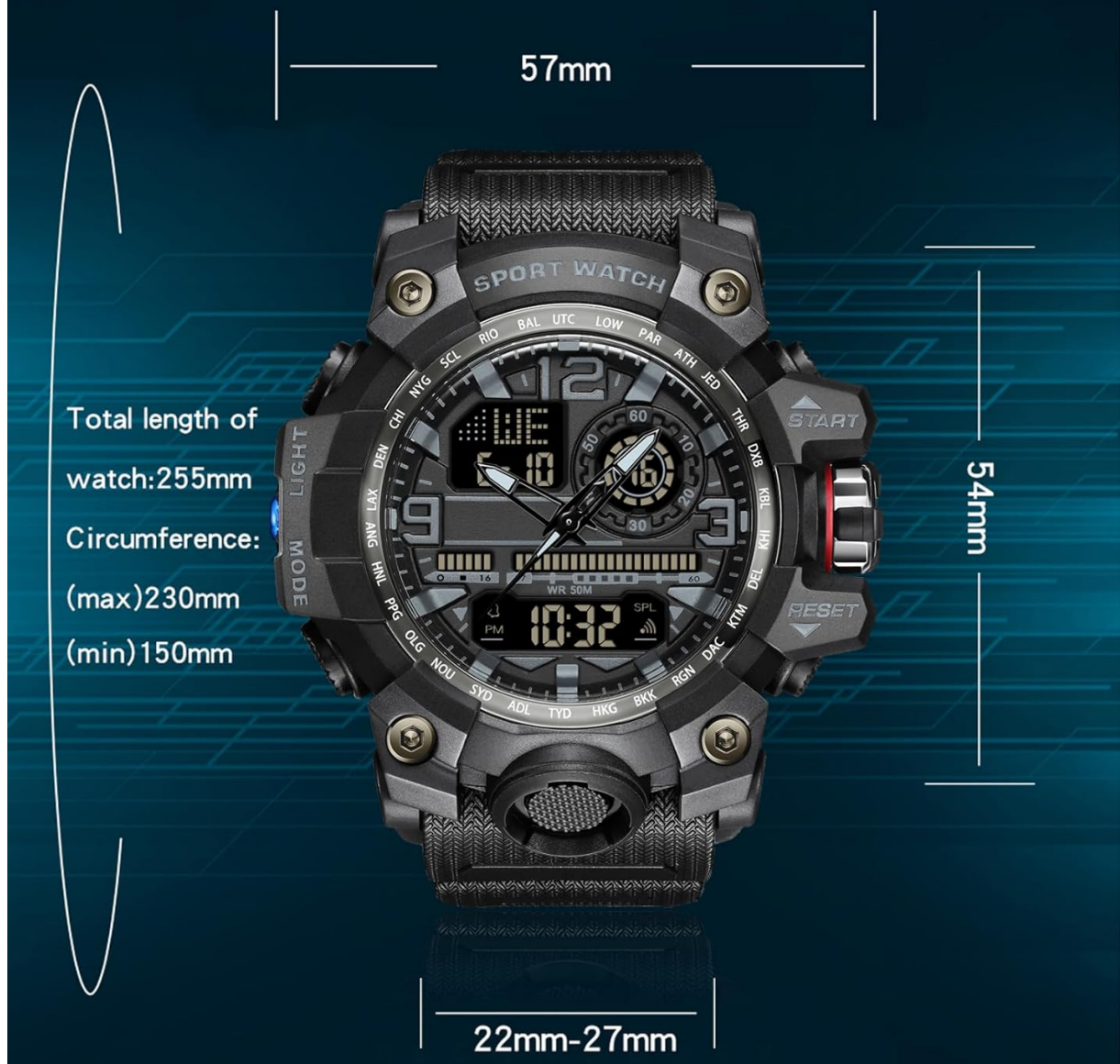
Image: Product Dimensions.