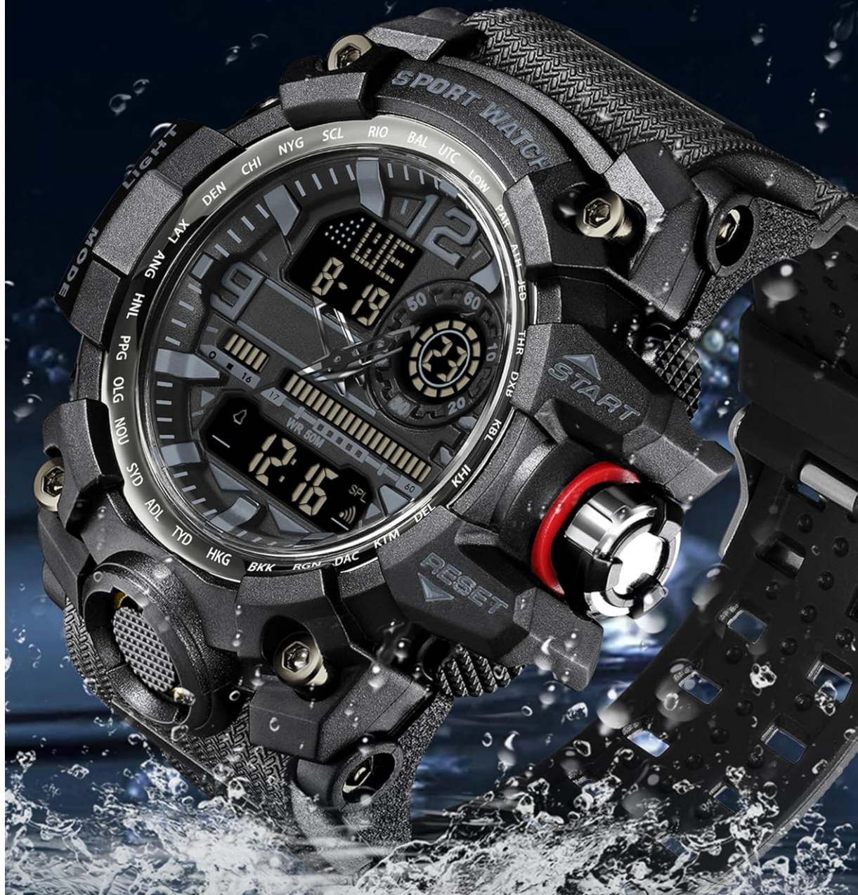
Image: Water Resistance Demonstration.