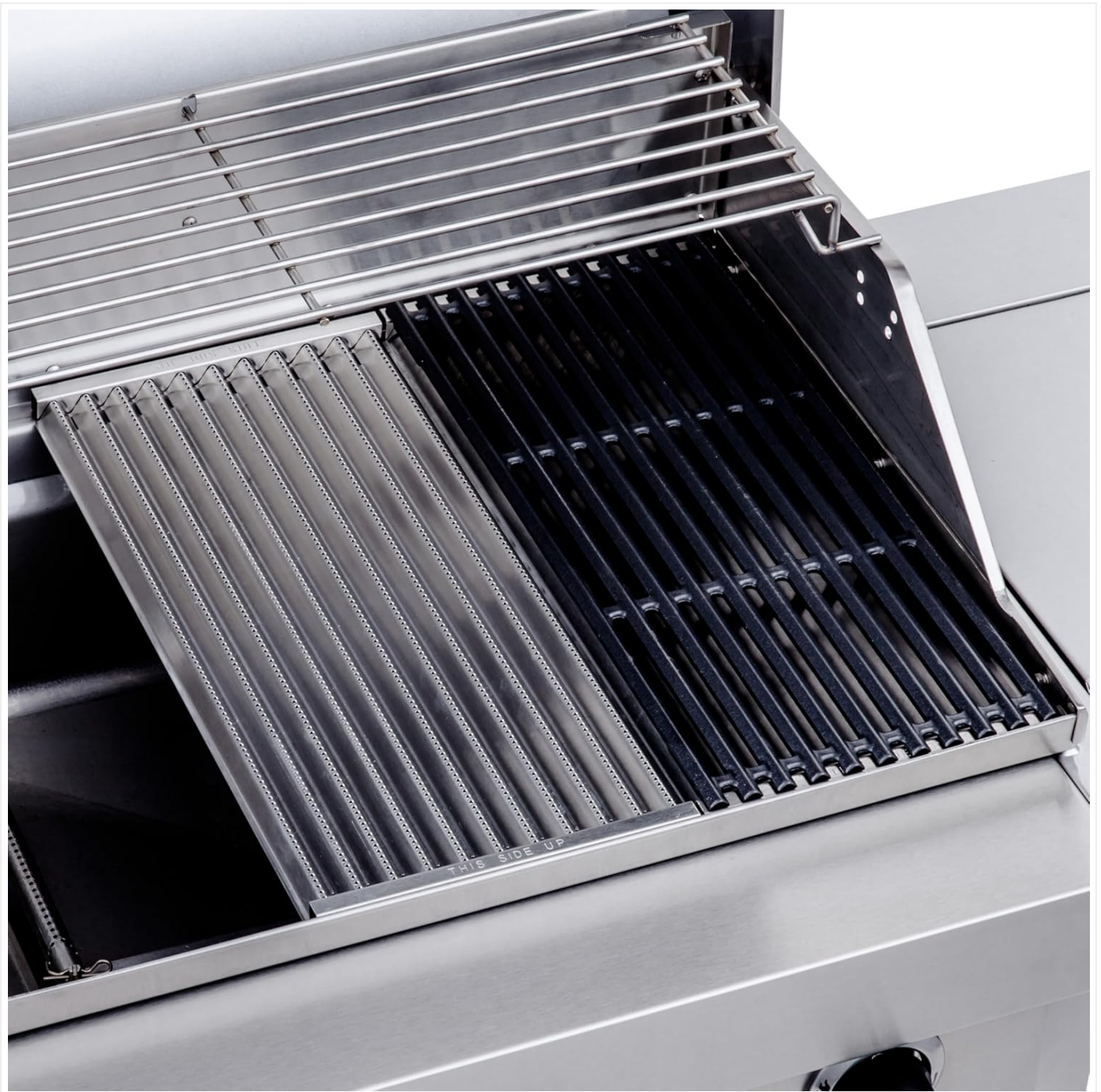
Figure 5: The TRU-Infrared emitter ensures even heat distribution and prevents flare-ups.

Always preheat your grill with the lid closed for 10-15 minutes before cooking to allow the grates and emitters to reach optimal temperature.