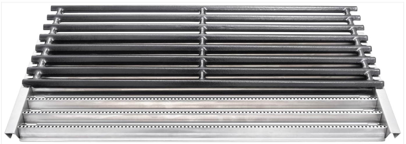
Figure 4: A single section of the Char-Broil TRU-Infrared replacement system properly installed in a grill.