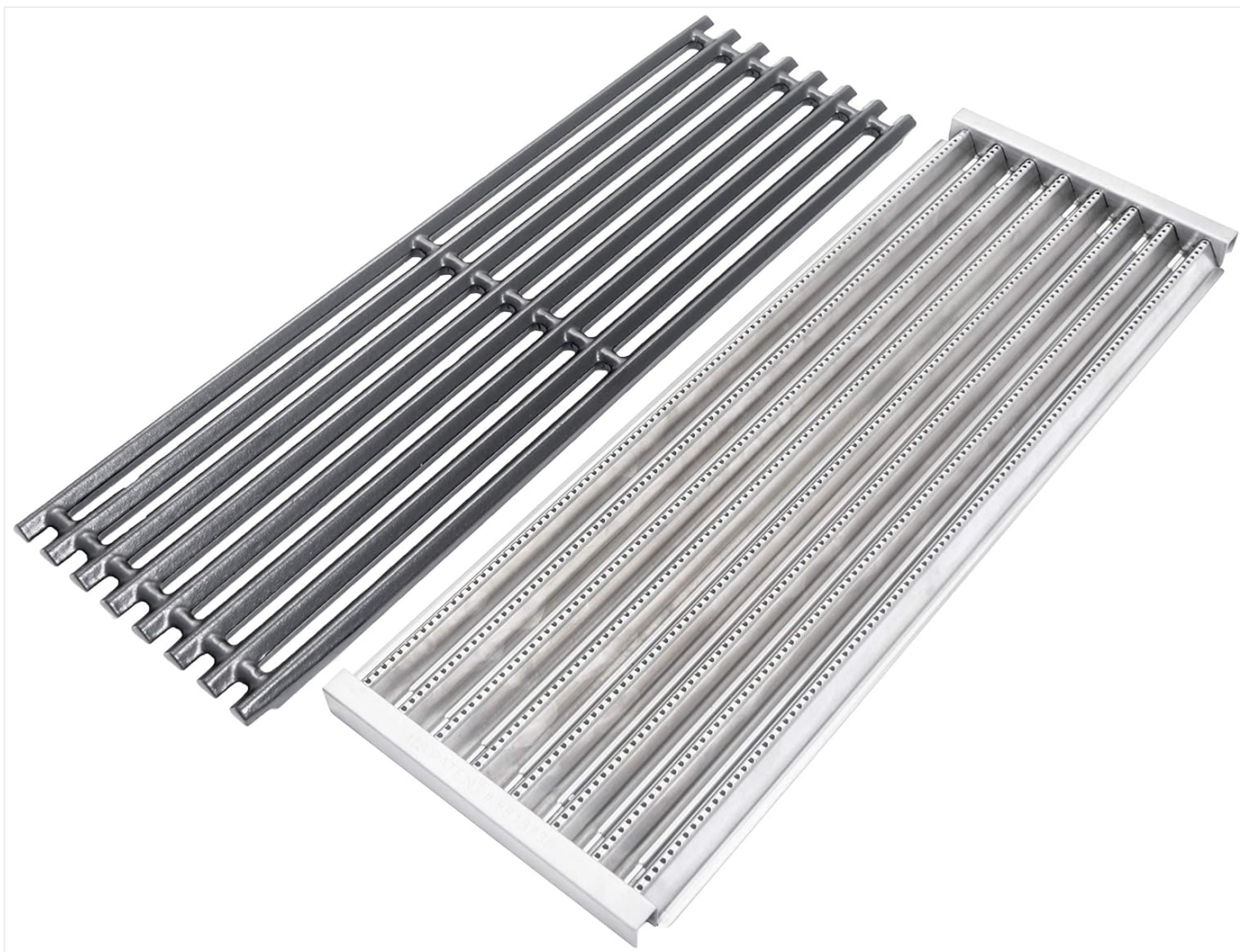
Figure 1: The Char-Broil TRU-Infrared Replacement Grate (top) and Emitter (bottom).