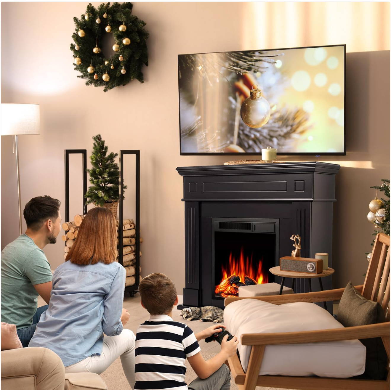
Figure 1: Overheating Protection Feature. The fireplace is designed with safety in mind, including overheating protection, making it suitable for households with children and pets.