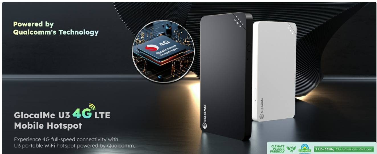
Figure 2: GlocalMe U3 Powered by Qualcomm Technology. This image highlights the internal Qualcomm chipset, indicating reliable and high-performance internet capabilities.