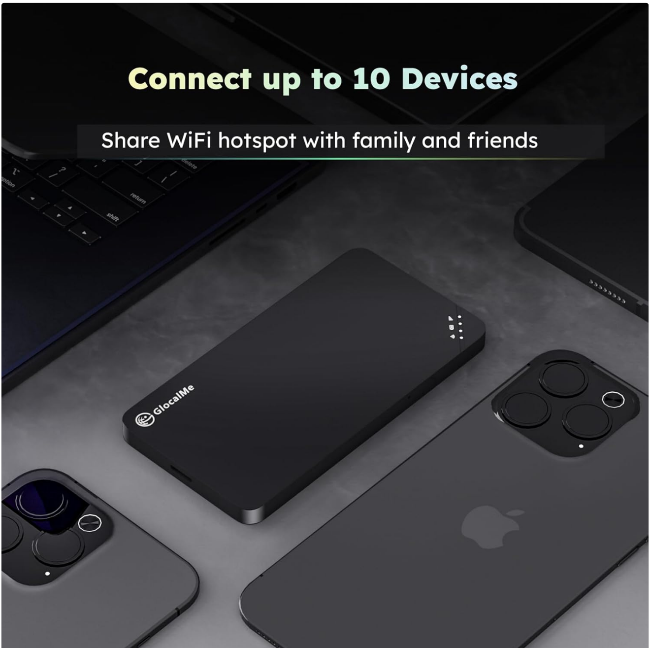
Figure 4: Connect up to 10 Devices. This image illustrates the GlocalMe U3 device surrounded by various electronic devices, showcasing its capability to connect multiple users simultaneously.

Share WiFi hotspot with family and friends