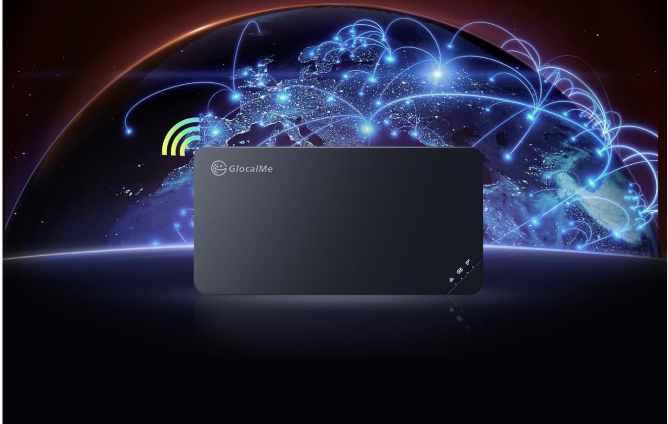
Figure 6: Internet Coverage in 200+ Countries. This image visually represents the extensive global coverage of the GlocalMe U3, showing a map of the world with network signals.

★ No Contract ★ Pay As You Go ★ No SIM Required