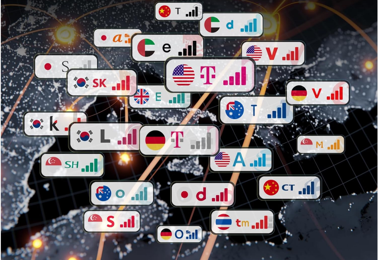
Figure 7: 390+ Global Carriers Access. This image illustrates the device's ability to connect to numerous carriers worldwide, ensuring optimal signal strength.

Automatically connects to the best 4G network