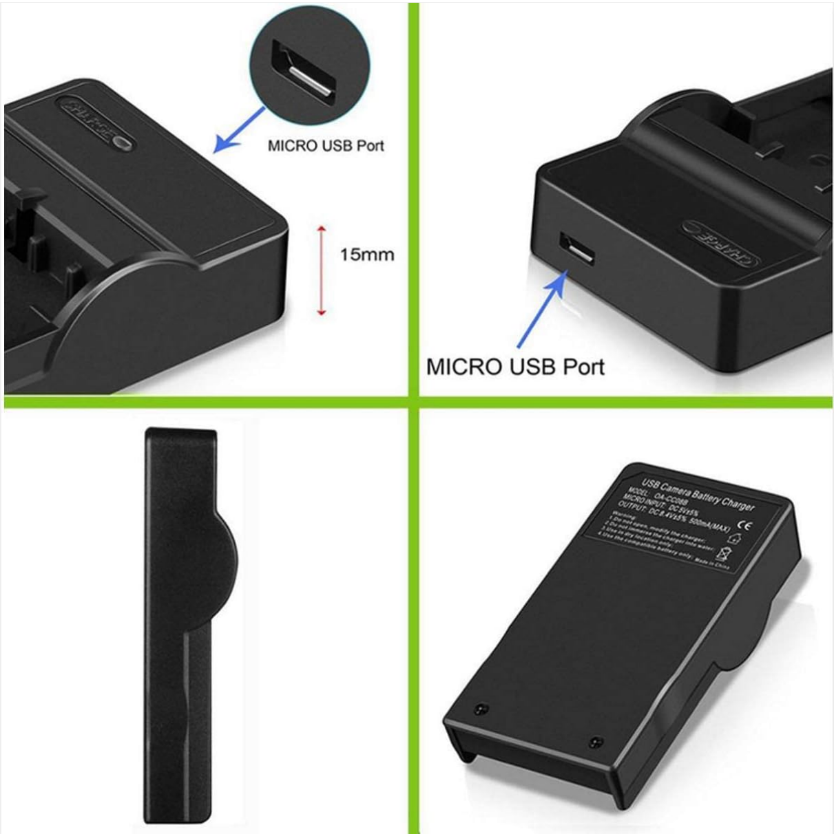
Image: Charger's Micro USB port and bottom label detailing input/output specifications.