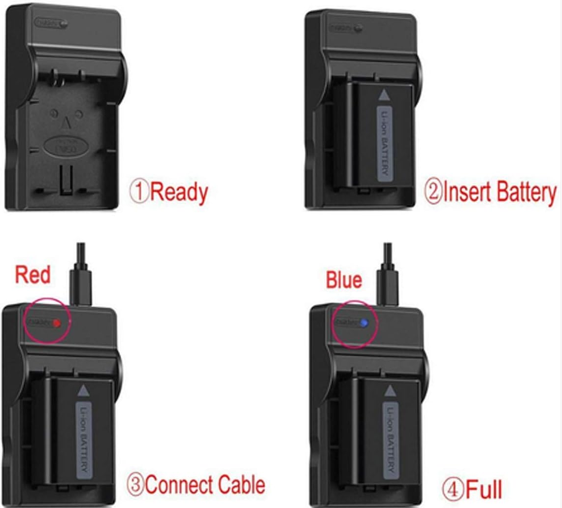
Image: Visual guide to the battery charging process, from insertion to full charge indication.