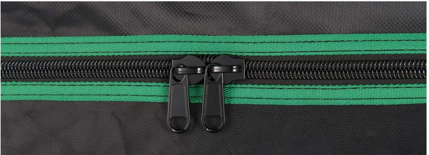
Image: Guide on how to properly operate the zipper for smooth movement and longevity.