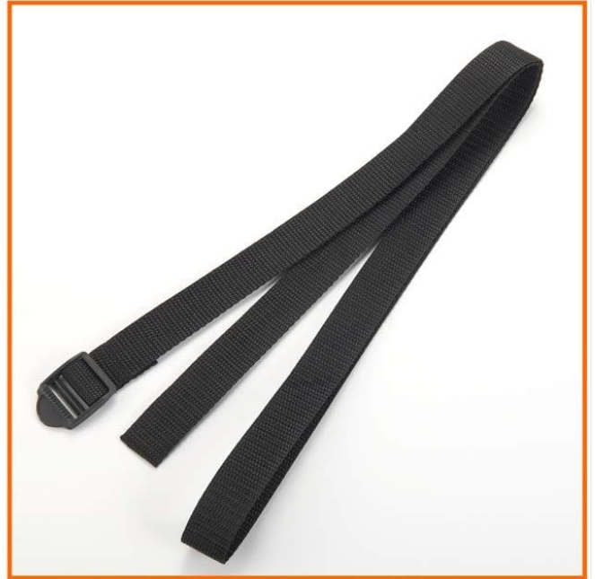
Carbon filter belts included