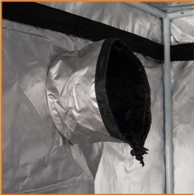
Dual ventilation socks