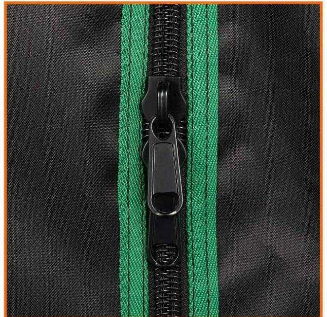
Heavy duty SBS zippers

Image: Internal features of the grow tent, including dual ventilation socks, tool-free connectors, and heavy-duty SBS zippers.