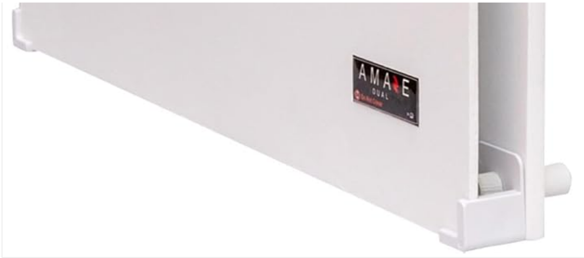
Image: Side view of the Amaze Heater Dual 400W panel, showcasing its slim profile and integrated on/off switch.