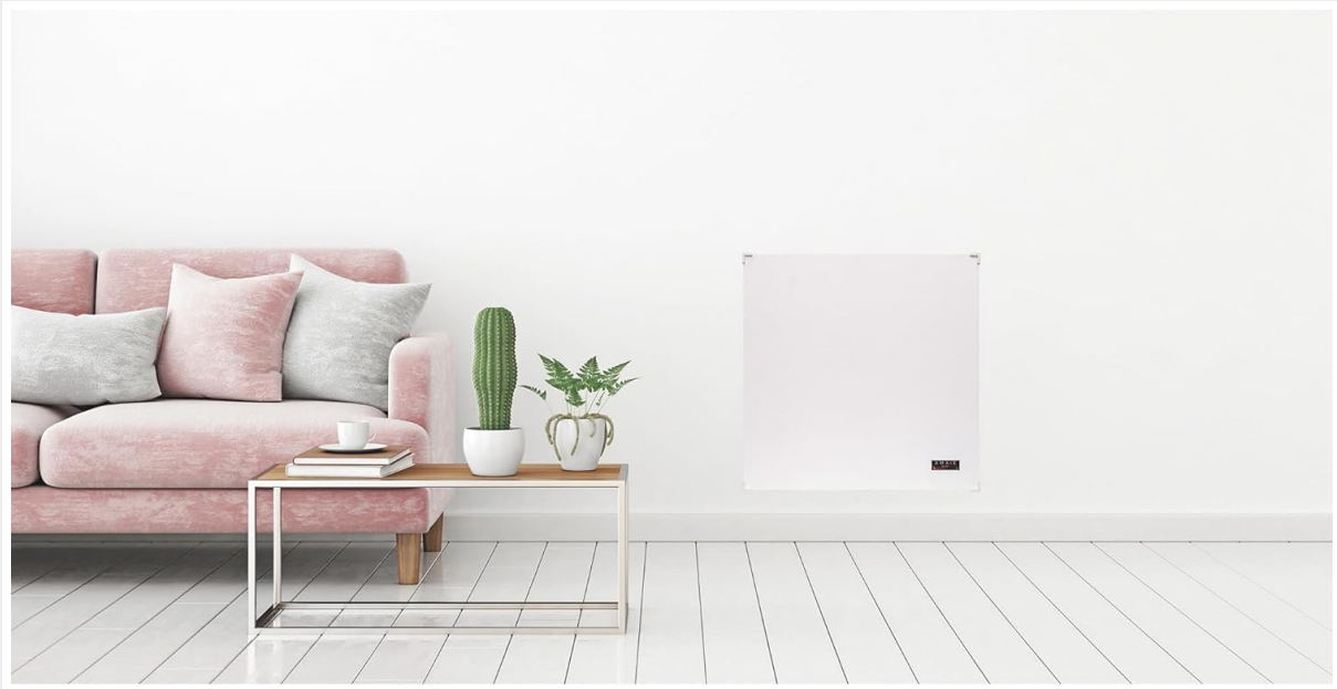
Image: Amaze Heater installed on a wall in a modern living room setting, demonstrating its discreet integration.