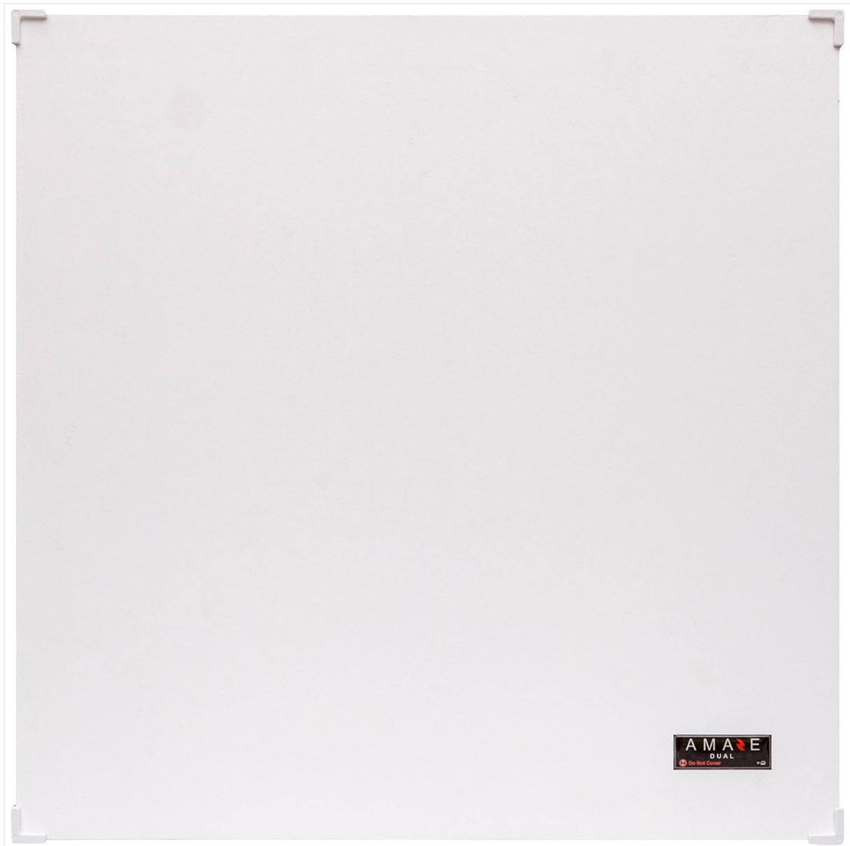
Image: Front view of the Amaze Heater Dual 400W panel, highlighting its minimalist design suitable for any room decor.