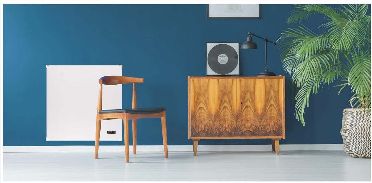
Image: Amaze Heater installed on a wall in an office environment, showing its suitability for various room types.