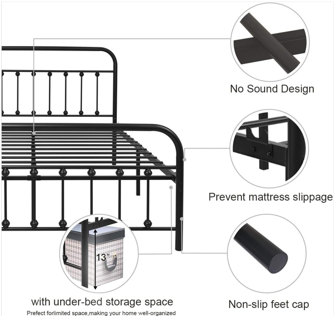
Figure 5.2: Visual representation of the bed frame's design features, including noise reduction, mattress stability, under-bed storage, and non-slip feet.