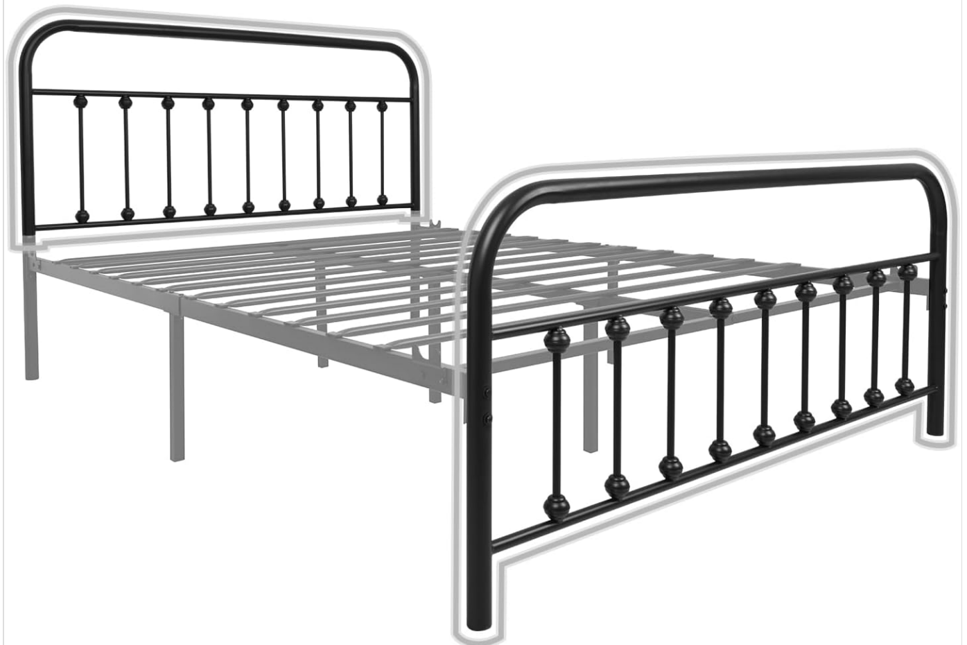
Figure 3.1: Integrated installation diagram, illustrating how the headboard, footboard, and side rails connect to form the bed frame structure.

THE ASSEMBLING OF COMPONENTS IS NOT REQUIRED FOR INTEGRATED INSTALLATION.