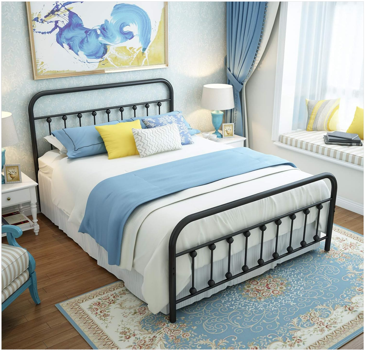
Figure 5.1: The NACHTIMOOR Queen Platform Metal Bed Frame fully assembled with a mattress and bedding.