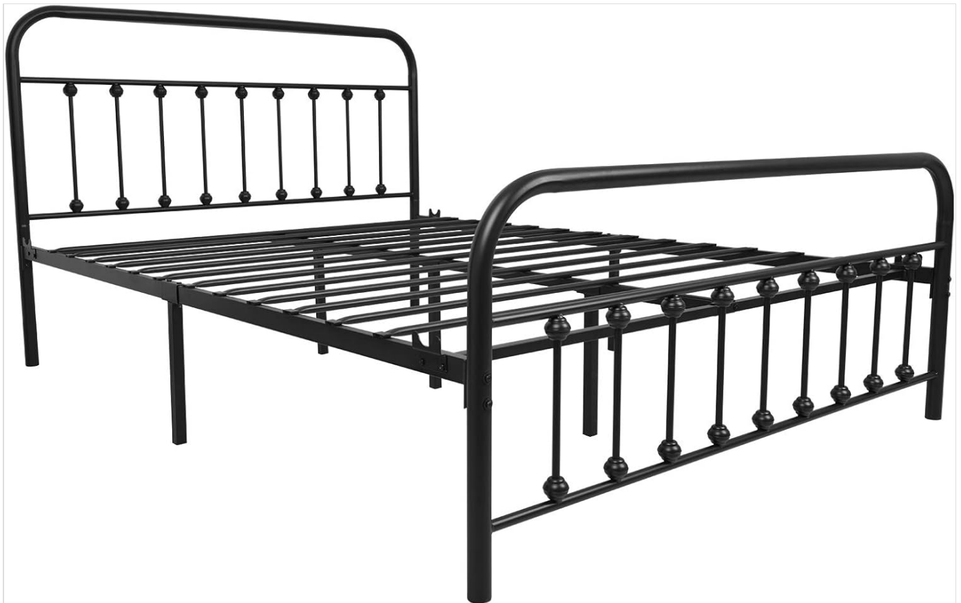
Figure 4.1: The assembled bed frame without a mattress, highlighting the metal slat foundation.