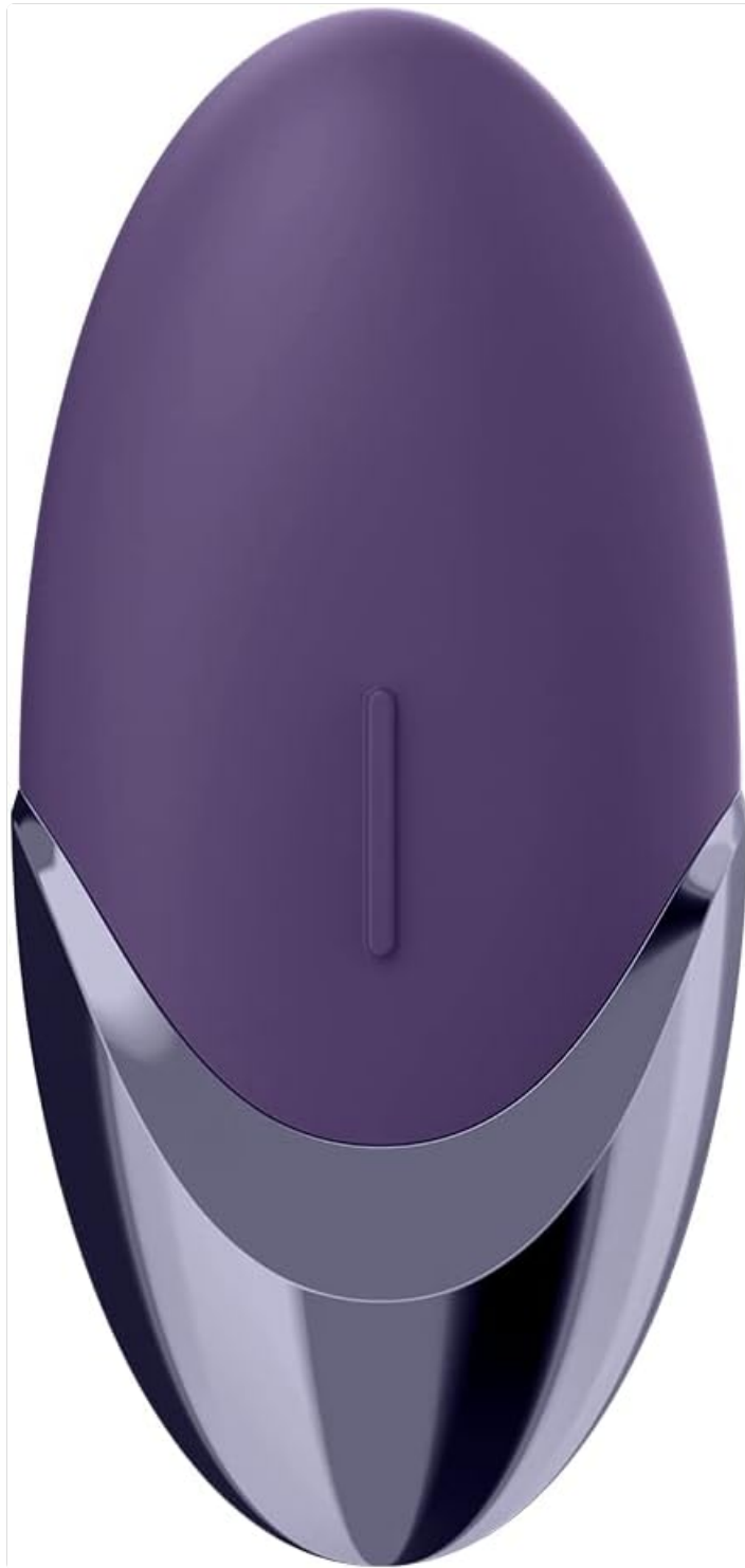
Image: The Satisfyer Purple Pleasure Vibrator, showcasing its ergonomic design and purple silicone finish.