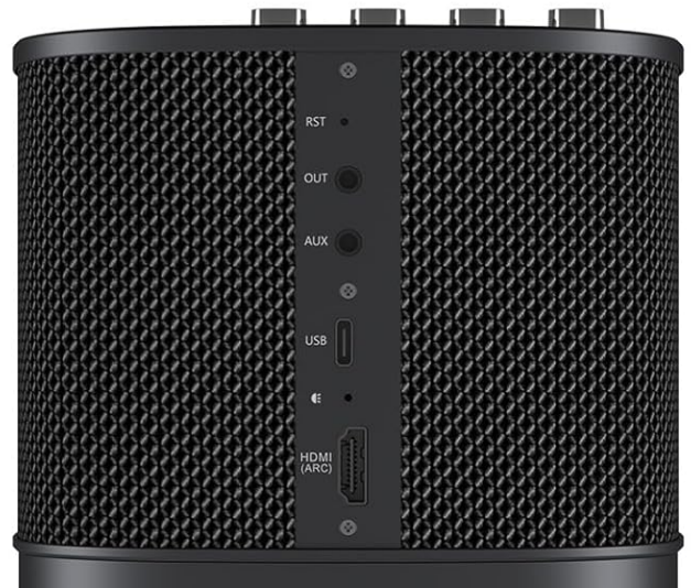
Figure 2: Top and Back Panel Controls (E500 3rd Gen vs. 2nd Gen). Note the 3rd Gen features separate Bass, Middle, and Treble sliders.