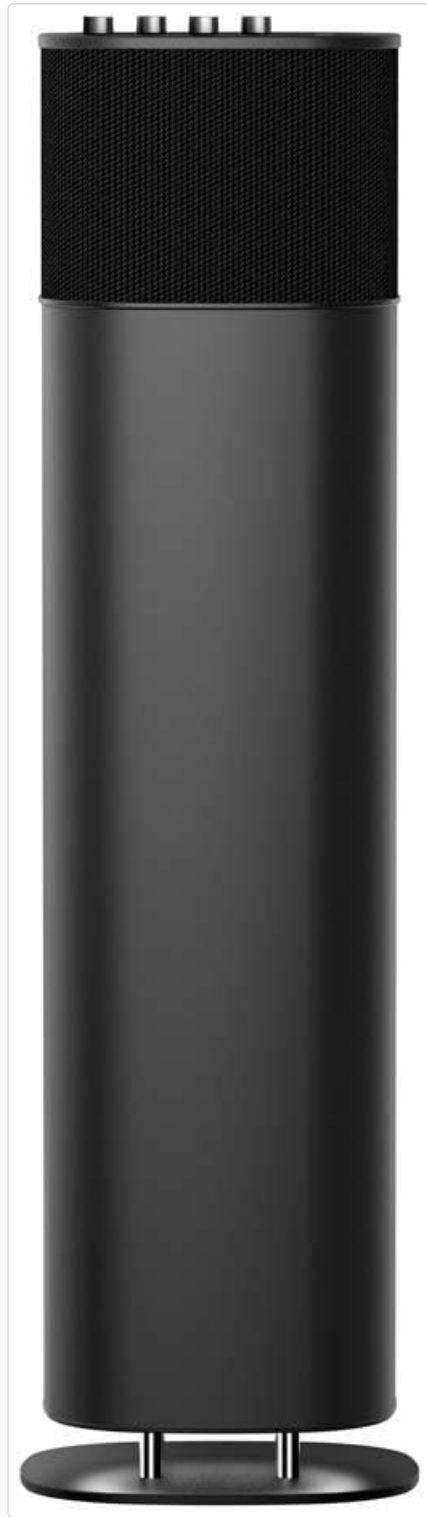
Figure 1: ABRAMTEK E500 Bluetooth Speaker (Dark Gray)