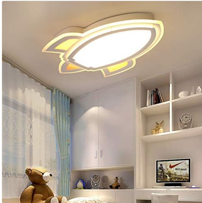
Image 4.1: The ceiling light installed in a child's bedroom, demonstrating its flush-mount appearance.