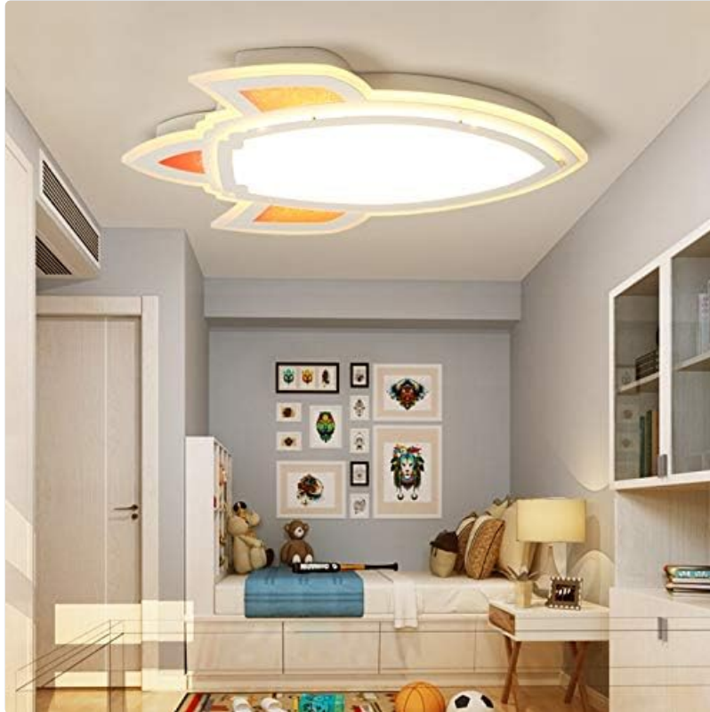
Image 5.1: The ceiling light emitting a warm white light, demonstrating its dimmable feature.

Note: The remote control may have Chinese labeling. Refer to the remote's diagram for specific button functions if available.