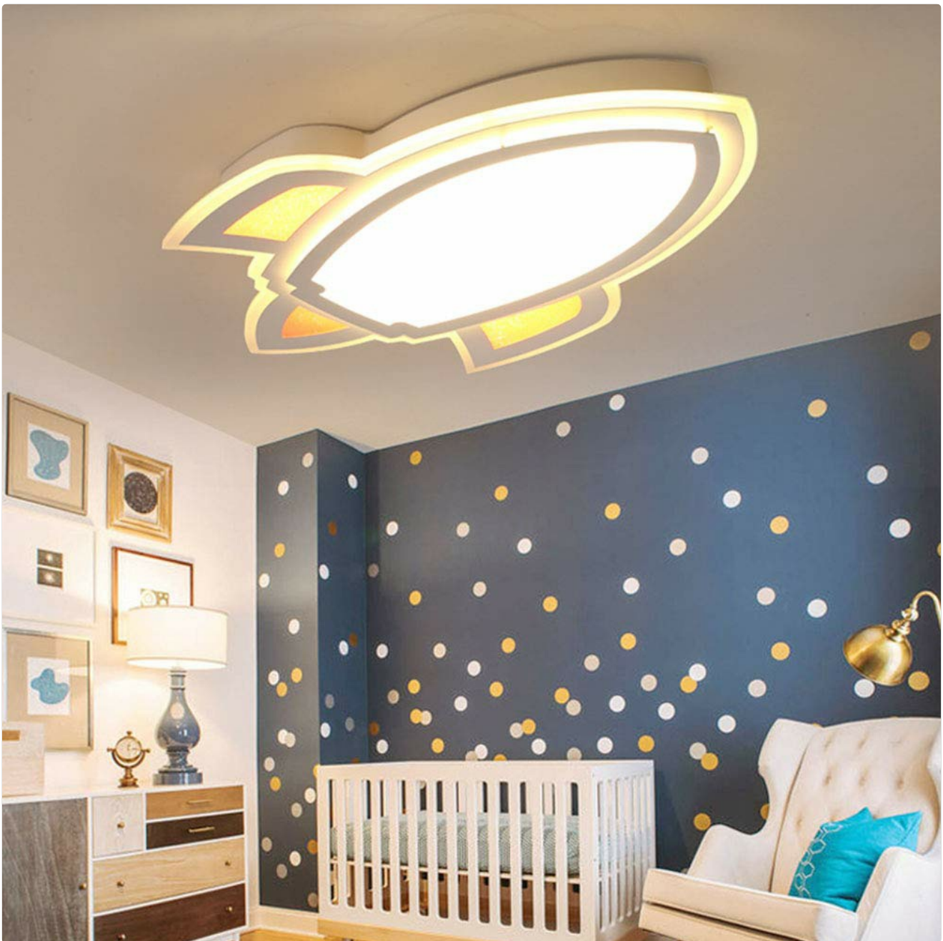
Image 1.1: The LITFAD Simple Cartoon Rocket Dimmable LED Ceiling Light, showcasing its design and illumination in a room setting.