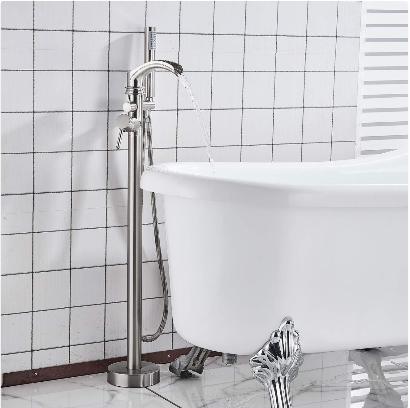
Figure 6.1: The brushed nickel faucet is shown actively filling a white freestanding bathtub, demonstrating the waterfall-style water flow from the spout.