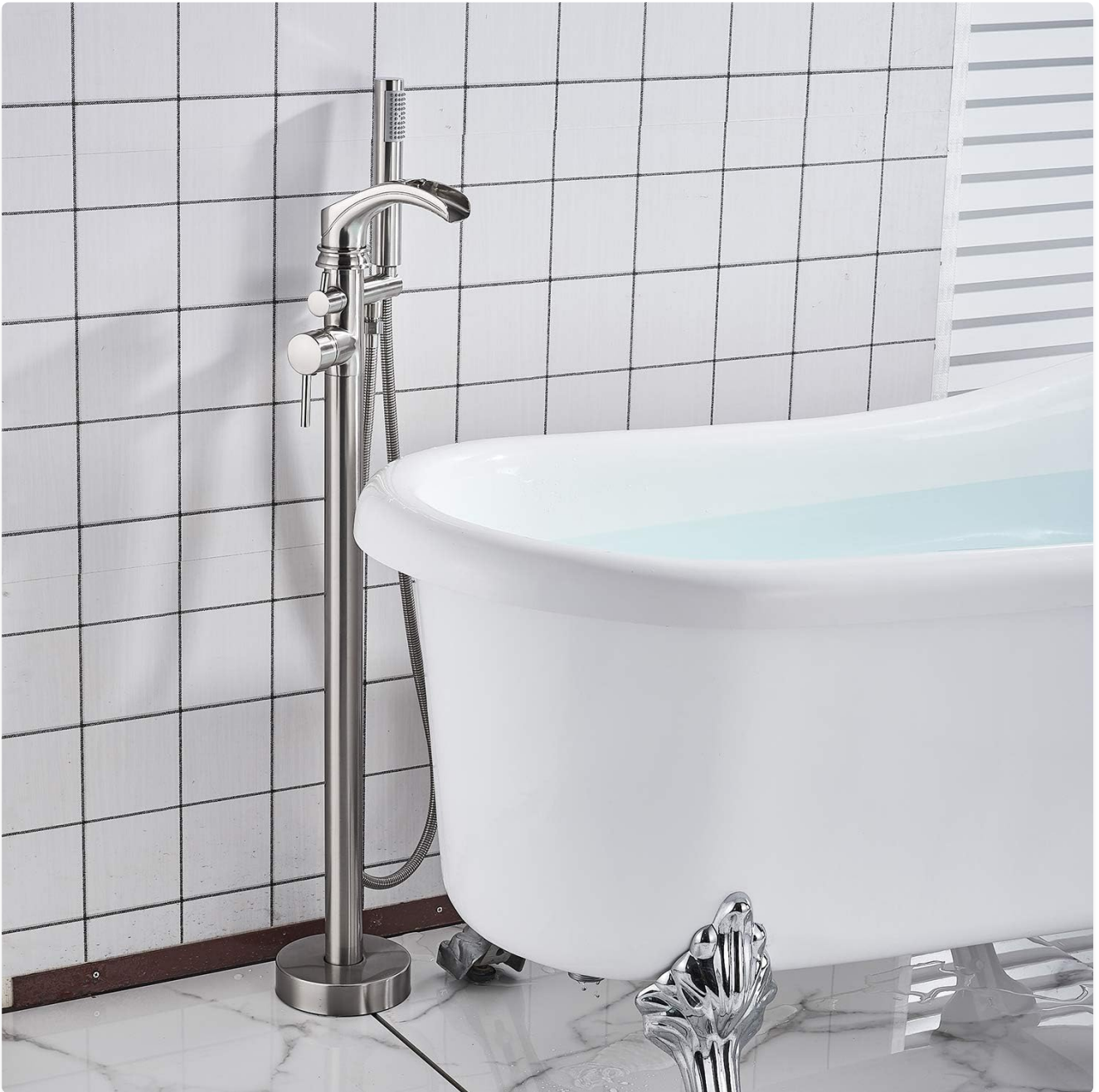
Figure 1.1: The Senlesen freestanding bathtub faucet in a brushed nickel finish, positioned beside a white freestanding bathtub. The faucet features a single handle and a hand shower.