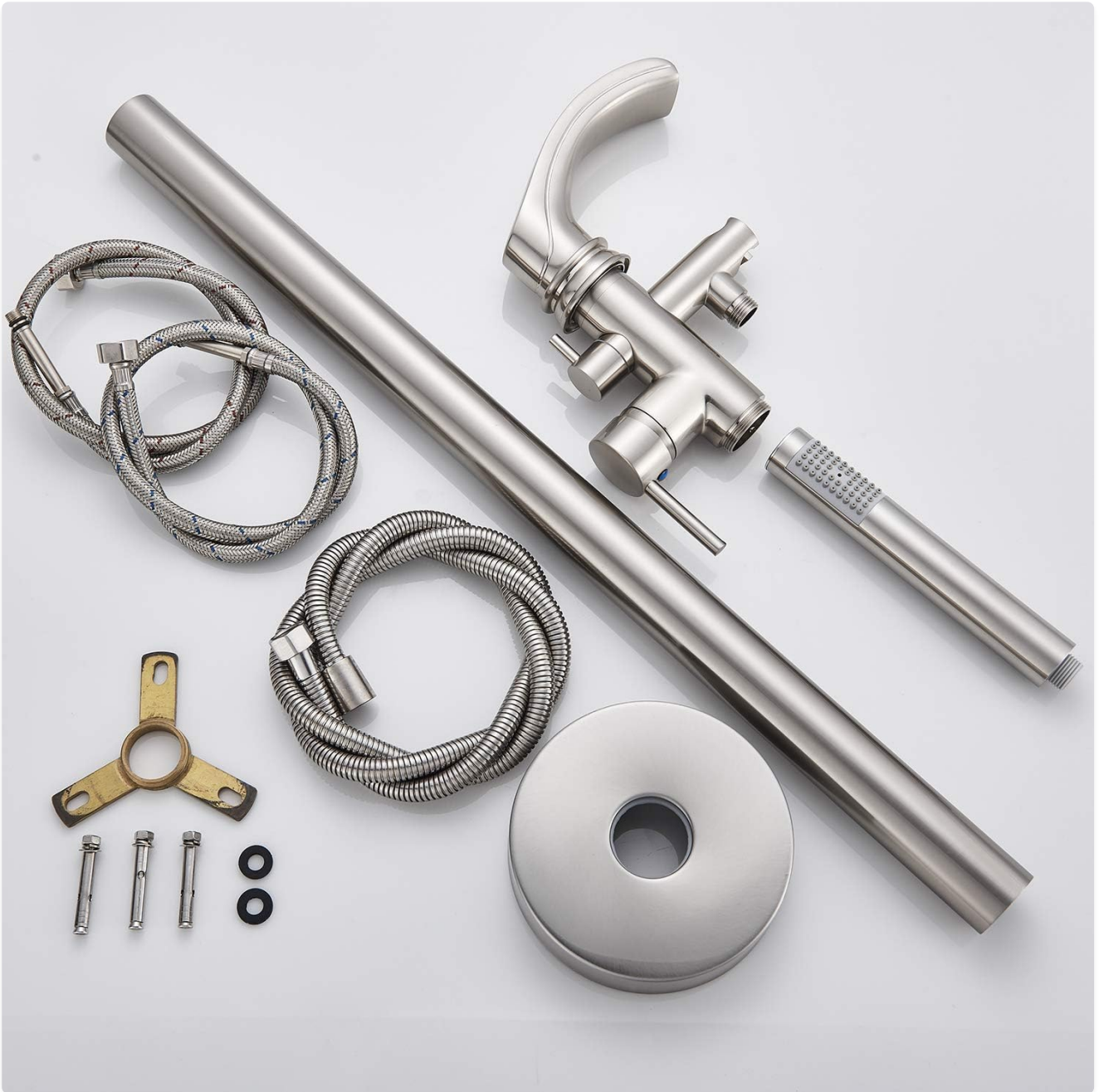
Figure 3.1: This image displays all the individual parts included with the faucet, such as the main faucet body, hand shower, hoses, base cover, mounting hardware, and seals, ready for installation.