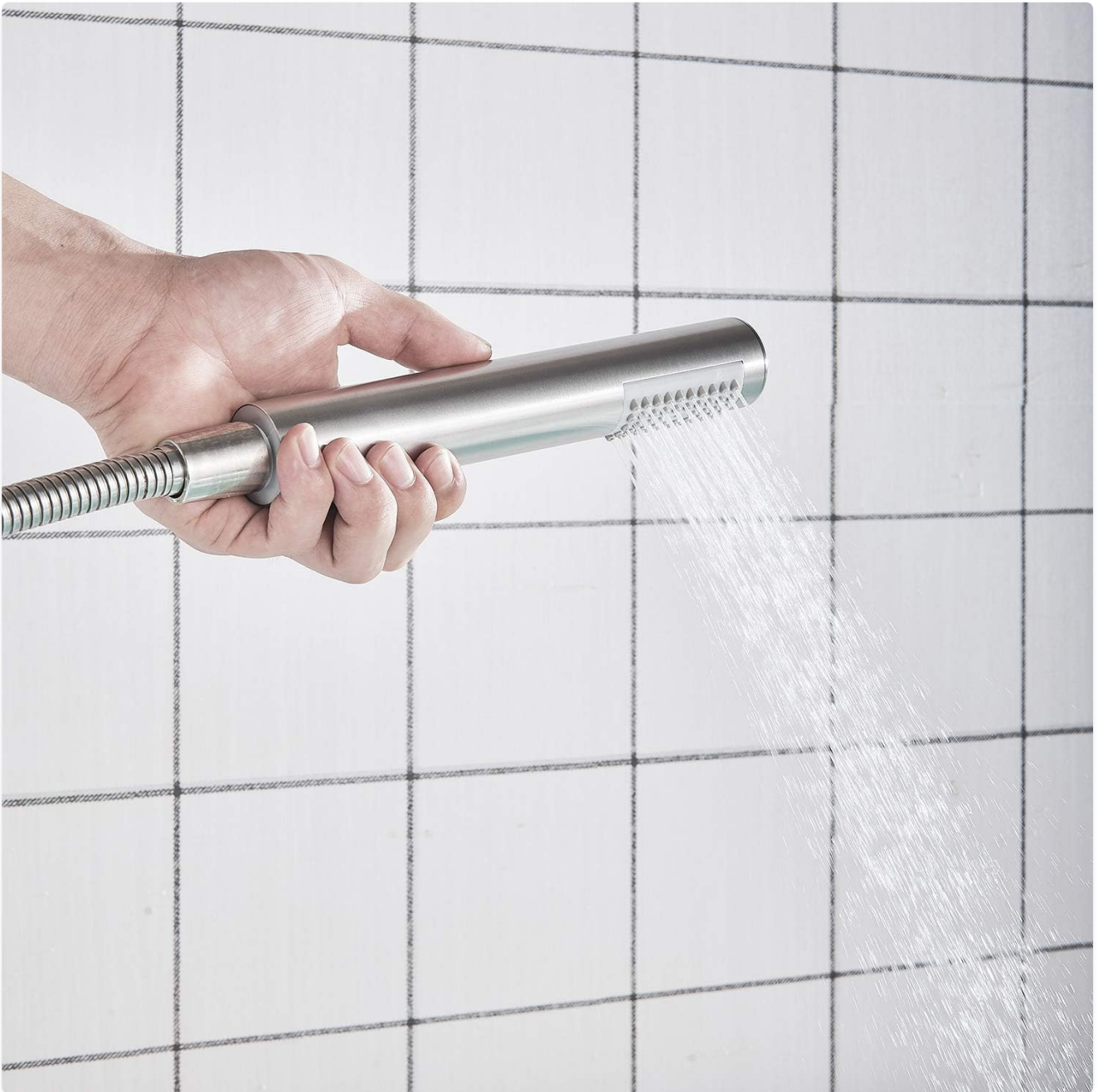
Figure 6.2: A close-up of the hand shower, detached from its holder, spraying water. This illustrates its functionality for rinsing or cleaning.