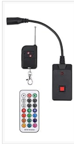
Image: The two remote controls provided with the fog machine: a wireless remote for fog output and a wired remote with a red button for fog output.

The VIRFUN Fog Machine can be operated using both wired and wireless remote controls for fog output, and a separate wireless remote for LED light effects.