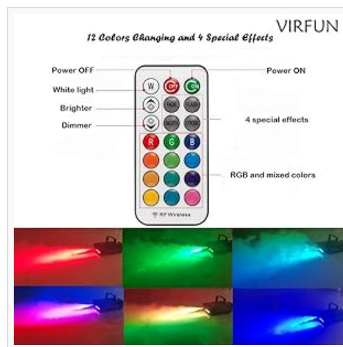
Image: A detailed diagram of the wireless remote control for the LED lights, showing buttons for power, brightness, dimmer, 4 special effects (Flash, Strobe, Fade, Smooth), and 12 fixed color buttons (Red, Green, Blue, and mixed colors).