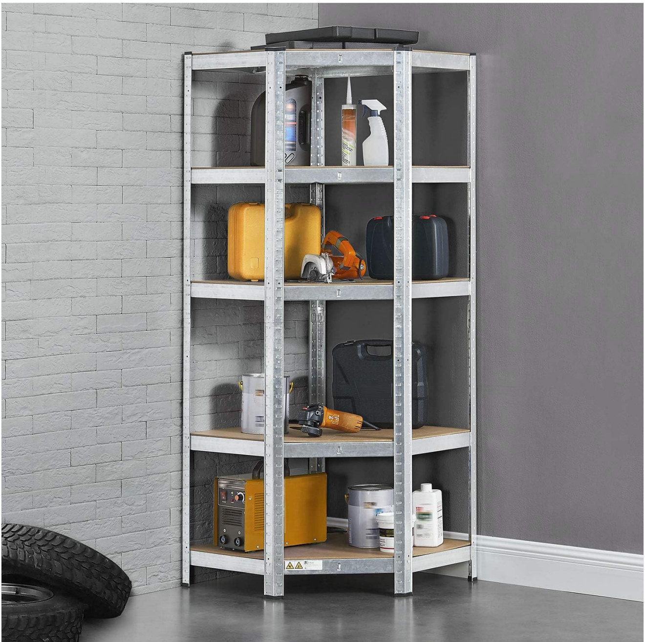
Image: The Juskys Corner Basic shelving unit in a garage setting, demonstrating its use for storing various items.