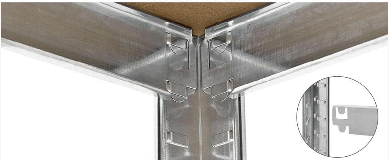
Image: Close-up of a securely connected corner joint of the shelving unit.