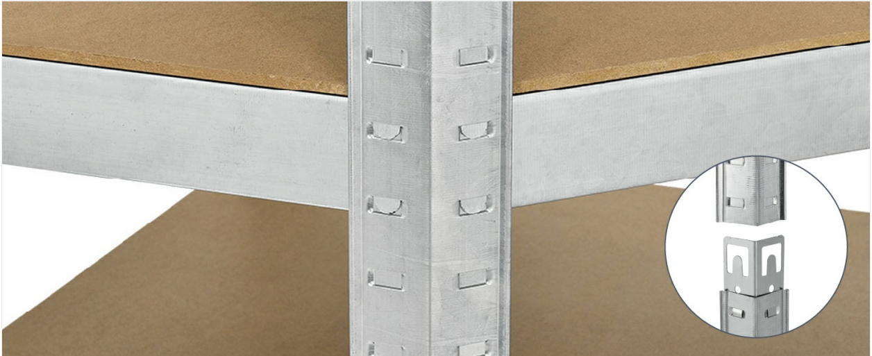
Image: Detailed view of the interlocking mechanism between vertical posts and horizontal beams.

tap with a rubber mallet (not included) if needed to secure connections.