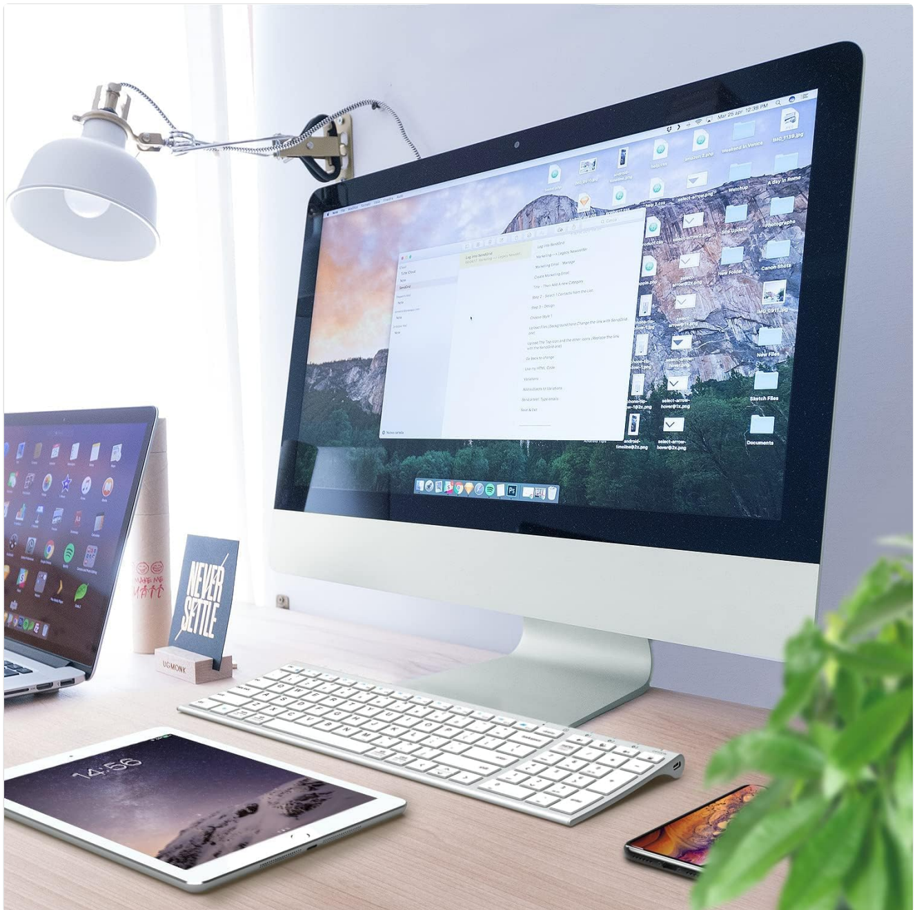
Image: The iClever BK10 keyboard positioned on a desk in front of a large monitor, with a laptop, tablet, and smartphone also visible. This setup demonstrates the keyboard's multi-device compatibility across different operating systems like iOS/macOS, Windows, and Android.