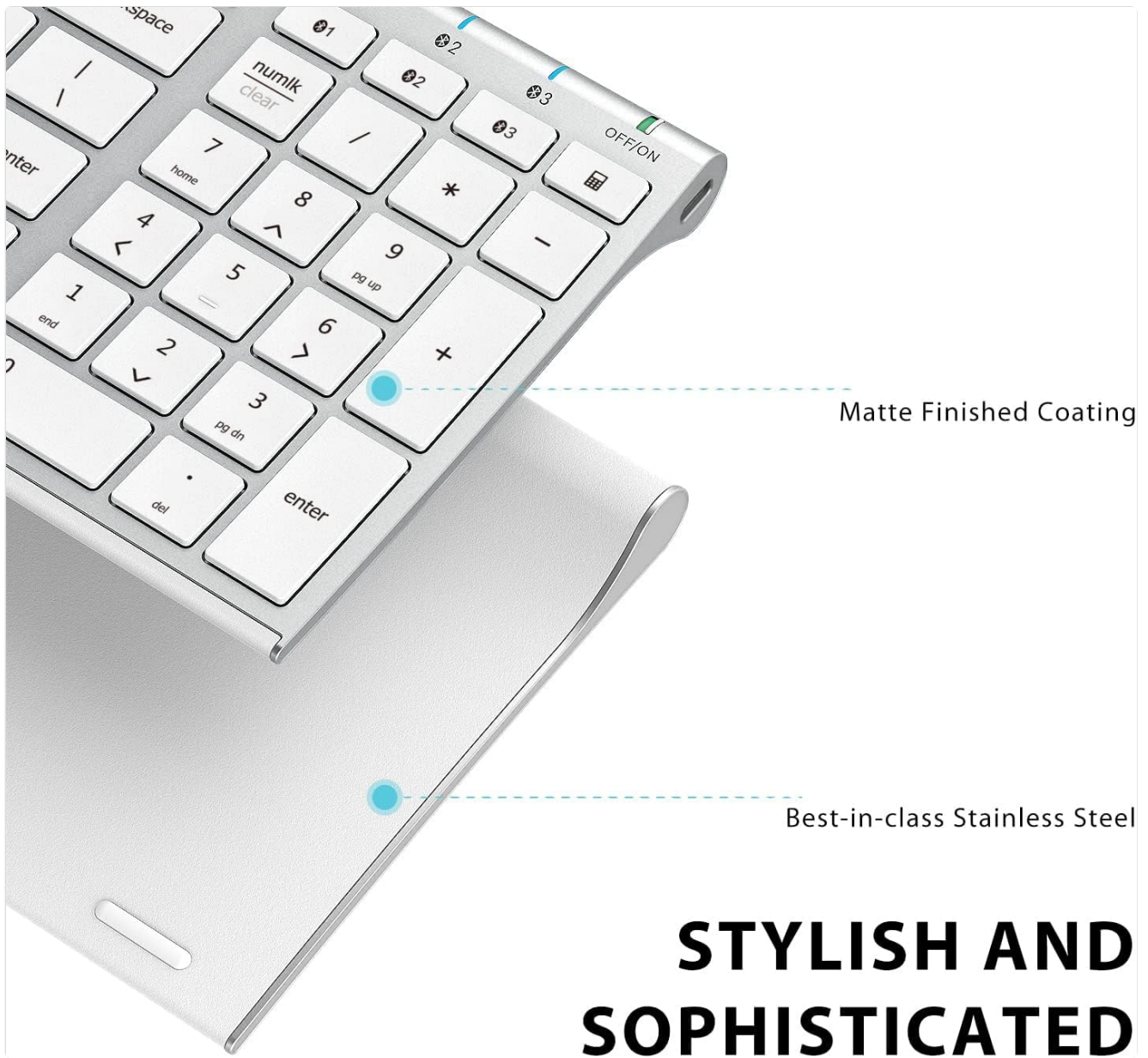
Image: A detailed side view of the iClever BK10 keyboard, showcasing its matte finished coating and best-in-class stainless steel base, contributing to its stylish and sophisticated appearance.