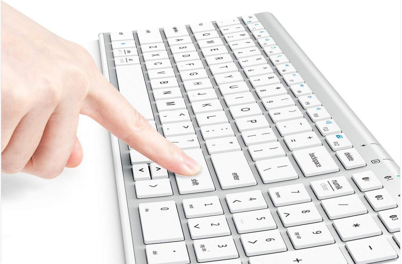
Image: A close-up view of the iClever BK10 keyboard's keys, emphasizing their low-profile design and the underlying scissor switch mechanism. This design ensures quiet and comfortable typing.