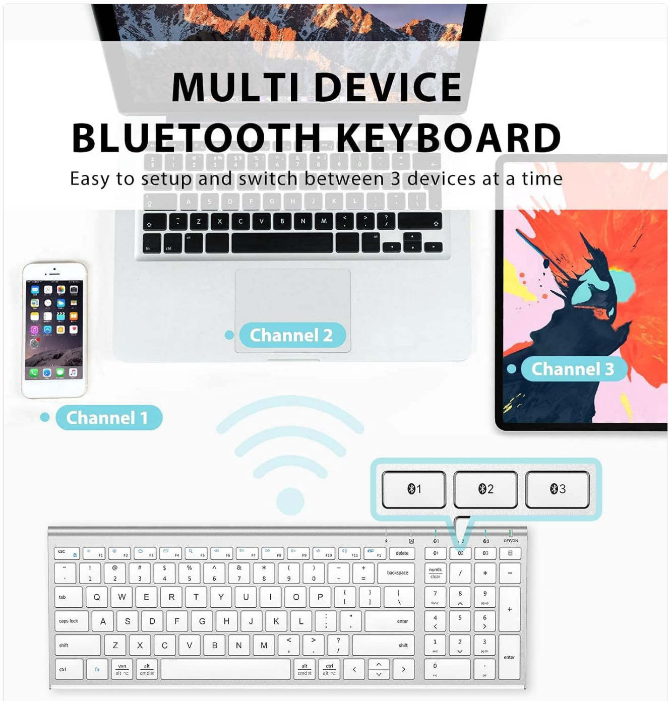
Image: The iClever BK10 keyboard shown in a multi-device setup, connecting to a laptop, iPad, and iPhone. The image highlights the three Bluetooth channel buttons (B1, B2, B3) on the keyboard, indicating easy switching between connected devices.

Easy to setup and switch between 3 devices at a time