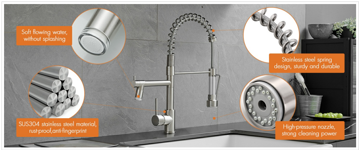
Image: Demonstration of the faucet's 360-degree rotation for enhanced flexibility.