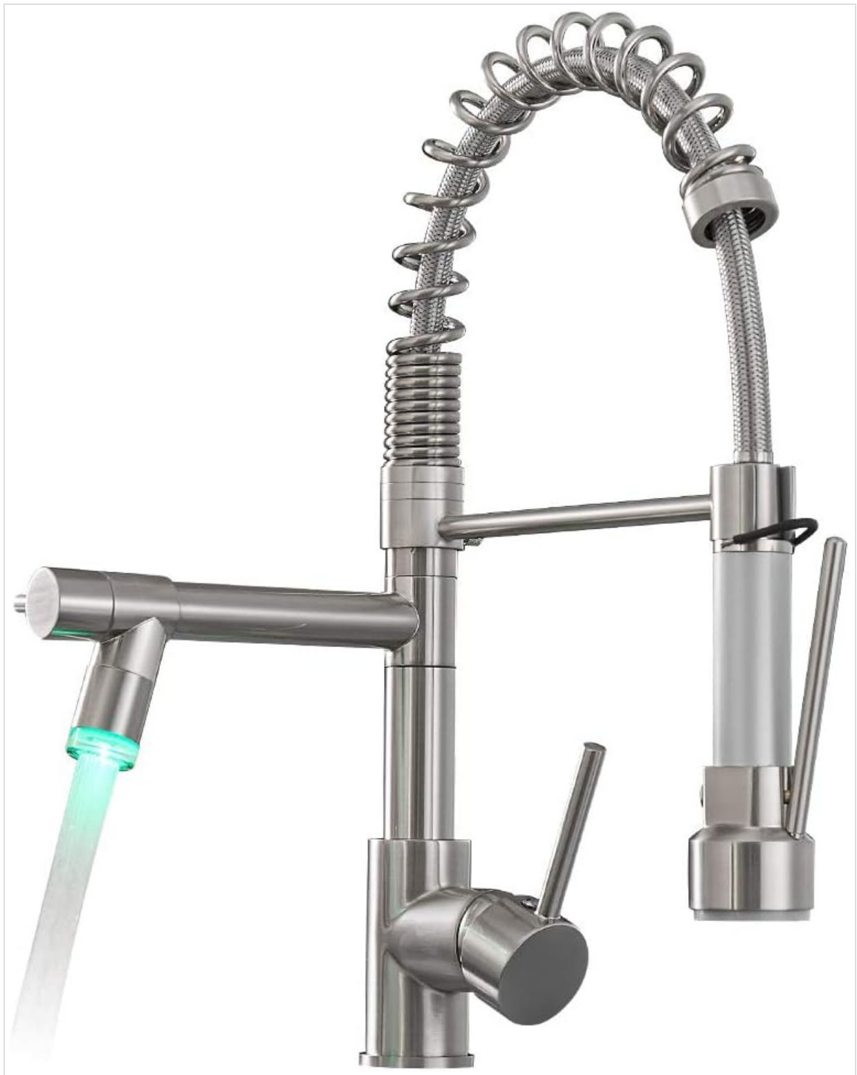
Image: The AIMADI Commercial Pull-Down Kitchen Faucet, showcasing its brushed stainless steel finish and integrated LED light.