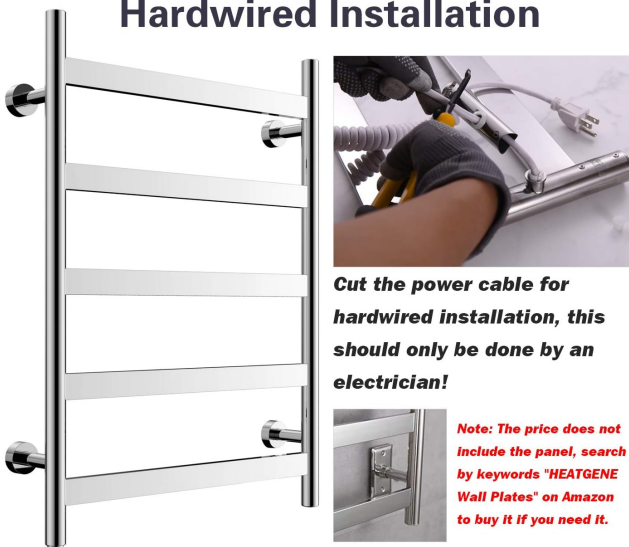
Image: Diagram illustrating hardwired installation. Professional