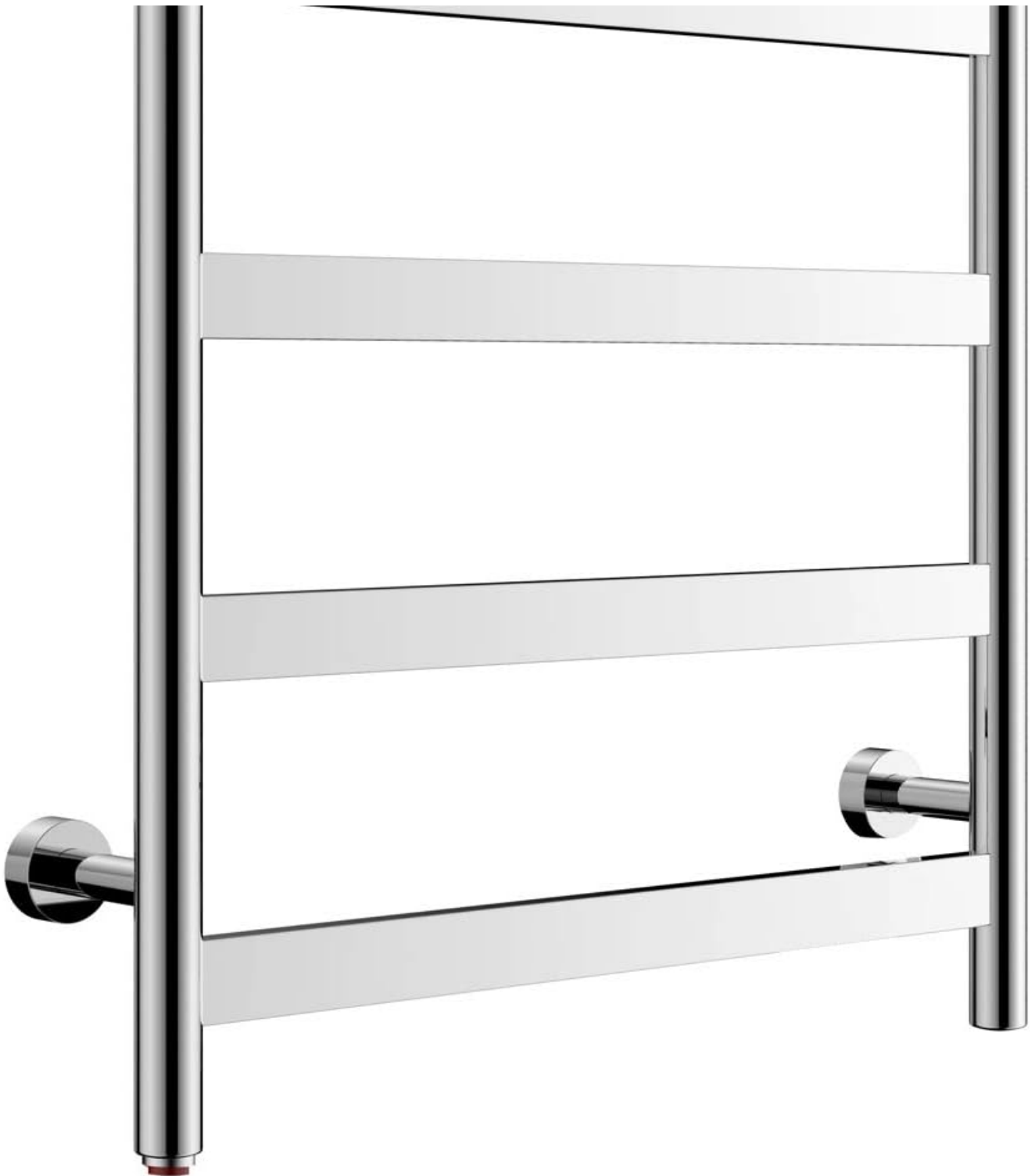
Image: Detailed dimensions of the HEATGENE R64136P Towel Warmer.