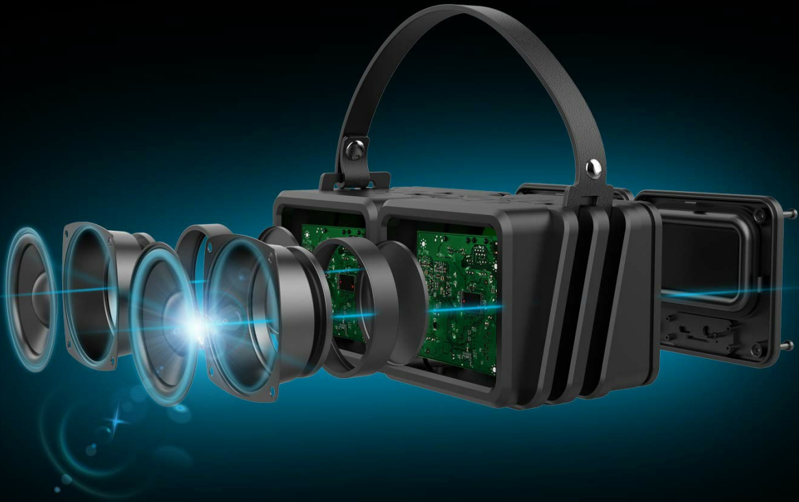
Image: An exploded view of the Zamkol speaker revealing its internal components, including two 12.5W dual high-performance drivers, illustrating the DSP Chip SoundPulse Technology for 25W deeper bass.

Two 12.5W Dual High-performance drivers delivers rich & clear sound