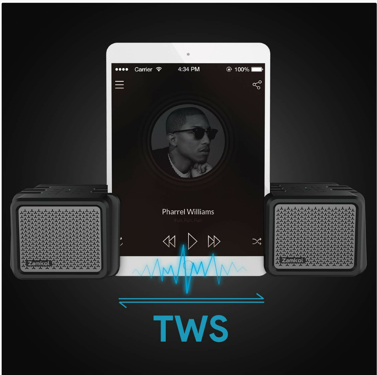
Image: An illustration showing two Zamkol speakers wirelessly connected to a tablet via TWS, indicating stereo sound separation.

The Zamkol ZK206 speakers support TWS pairing, allowing two speakers to connect wirelessly for a true stereo sound experience.