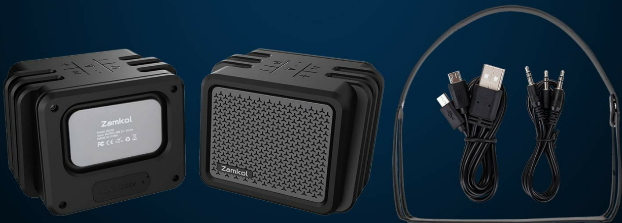
Image: The package contents include two Zamkol ZK206 wireless speakers, a USB charging cable with two ports, a 3.5mm audio cable with two ports, a leather belt, and a user guide.