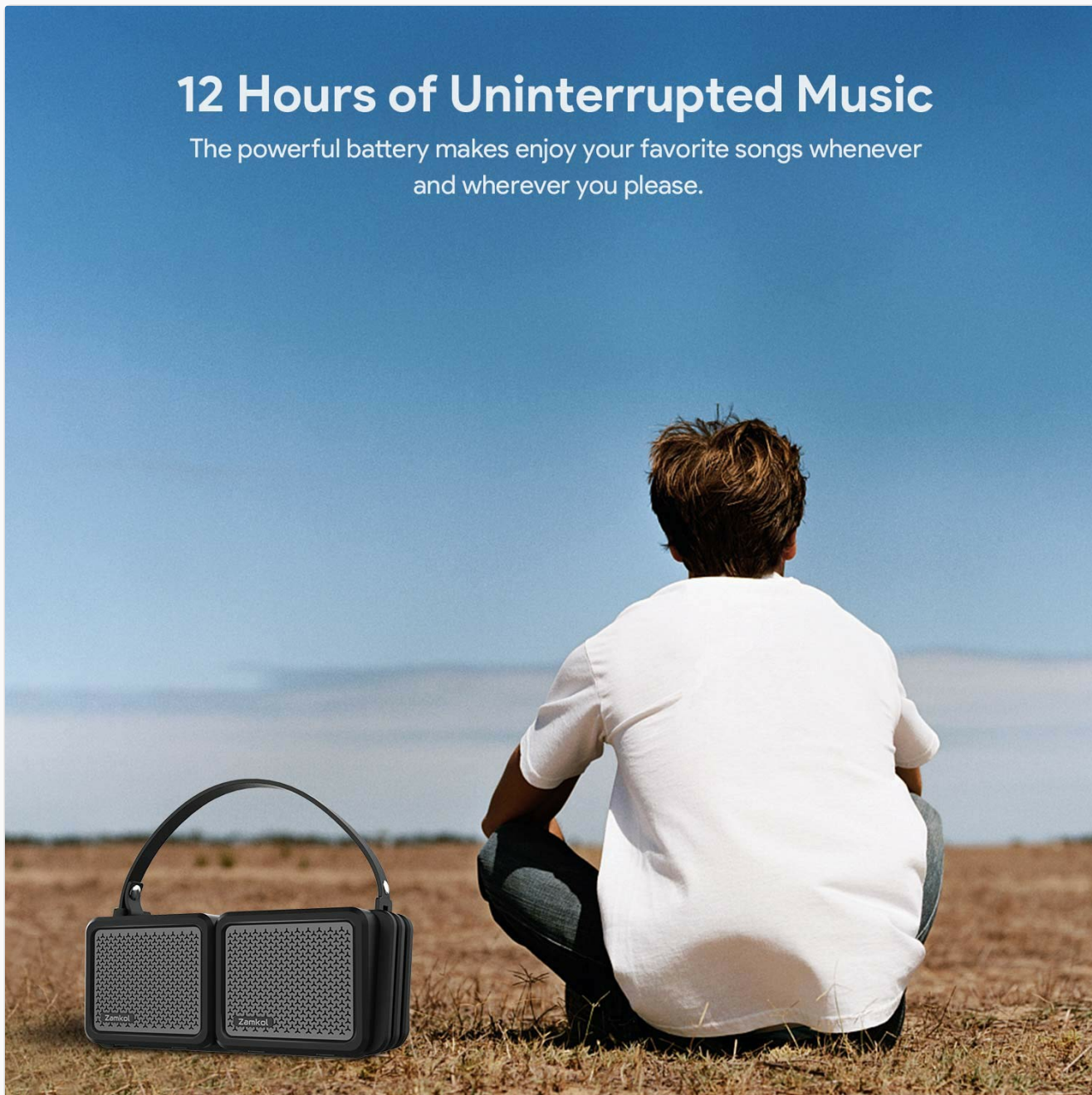
Image: A man is sitting in a field with the Zamkol speaker beside him, symbolizing the long battery life of 12 hours of uninterrupted music.

The powerful battery makes enjoy your favorite songs whenever and wherever you please.