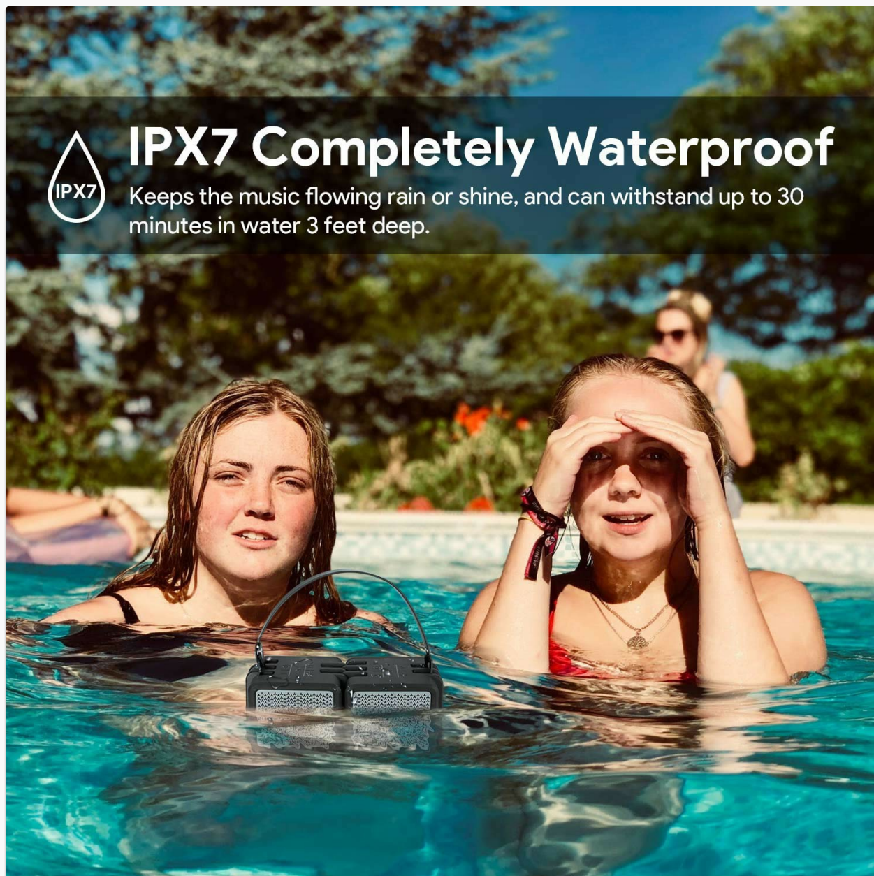
Image: Two individuals are in a swimming pool with the Zamkol speaker floating nearby, demonstrating its IPX7 completely waterproof capability, which allows it to withstand submersion up to 3 feet for 30 minutes.