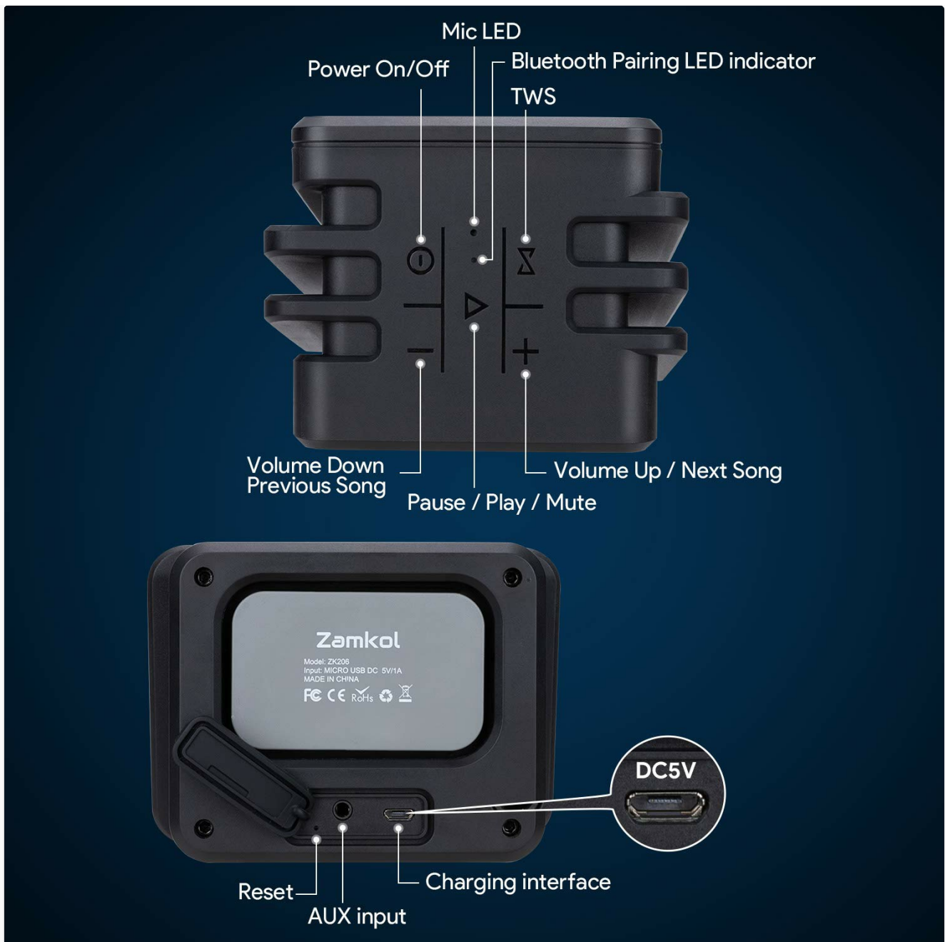
Image: A detailed diagram showing the top panel controls and rear ports of the Zamkol ZK206 speaker. Top controls include Mic, LED indicators for Bluetooth Pairing and TWS, Power On/Off, Volume Down/Previous Song, Volume Up/Next Song, and Pause/Play/Mute. Rear ports include DC5V charging interface, Reset button, and AUX input.