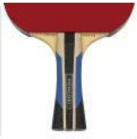
Figure 5: Detail of the bat handle, showing the Pongori branding and TTR 500 model designation.