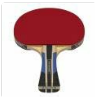
Figure 4: Rear view of the bat, showing the handle and the reverse side of the rubber.