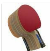
Figure 3: Side profile of the bat, illustrating the thickness of the rubber and wood layers.