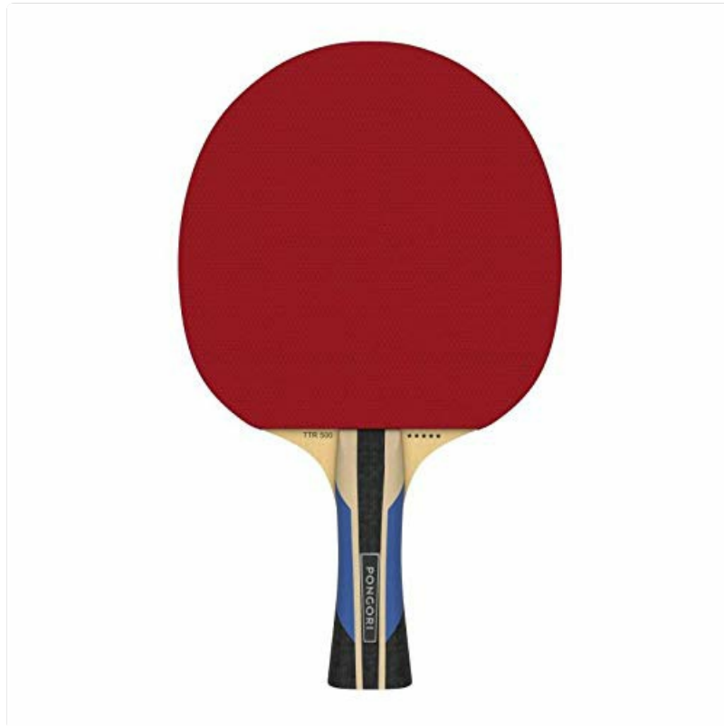
Figure 1: Front view of the Decathlon Pongori TTR 500 Table Tennis Bat, showcasing the red rubber and handle design.

The Decathlon Pongori TTR 500 is an all-round table tennis bat designed for regular play, offering a balance of control, spin, and speed. Its construction is optimized for versatile playing styles, allowing players to adapt to various game situations.