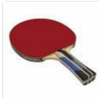
Figure 2: Angled view highlighting the rubber surface and handle grip, demonstrating the bat's construction.