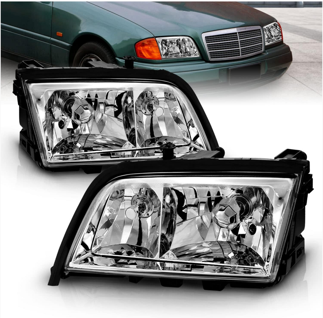
Figure 1: AmeriLite Crystal Headlights (Passenger and Driver Side)