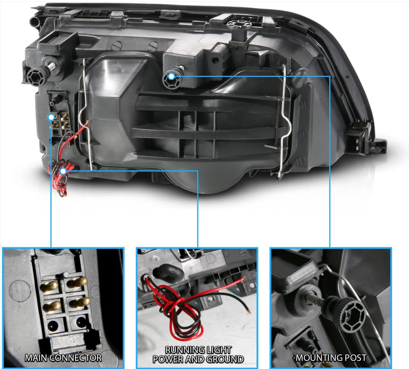
Figure 3: Rear View with Connection Points