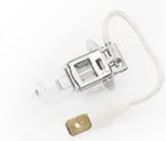
Low Beam H3 Bulb