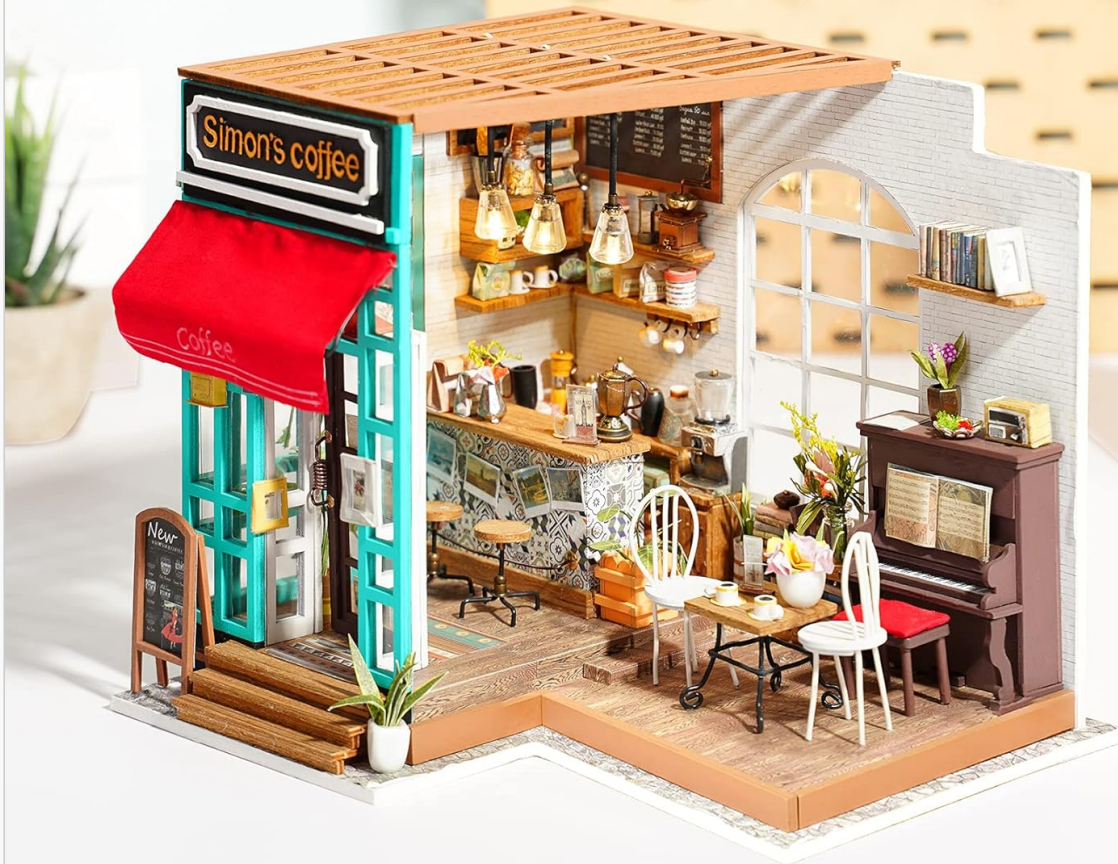
Image 7: The miniature coffee shop illuminated by its integrated LED lights, creating a warm and inviting atmosphere.