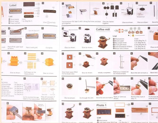
1. Read the English instructions