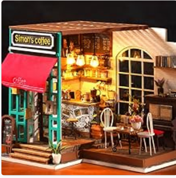
Image 5: The cozy seating area with a small table, two chairs, and a floral centerpiece.