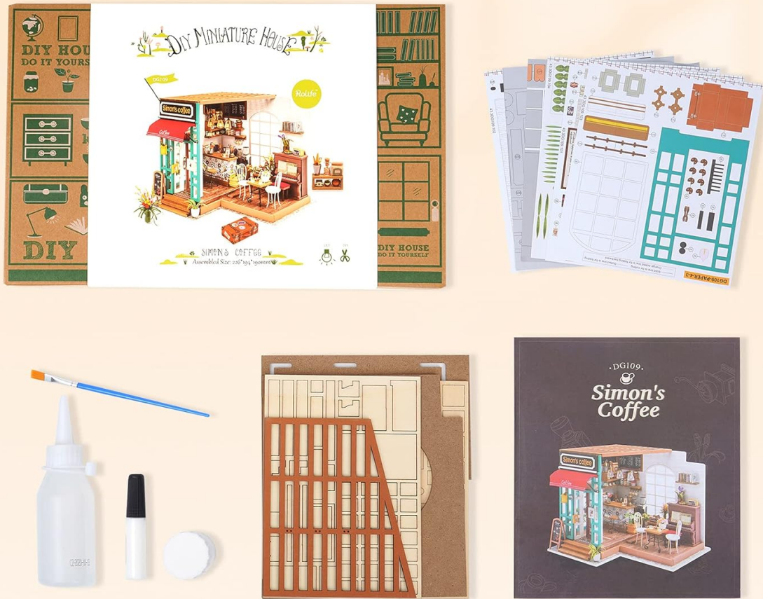
Image 2: An overview of the kit contents, including pre-cut wooden pieces, paper cutouts, fabric, and the instruction manual.

Your kit includes all necessary materials for construction. Please verify that all components are present before starting. Refer to the included instruction booklet for a complete list and visual guide to parts.