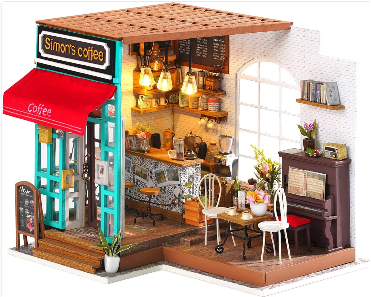
Image 1: The fully assembled Rowood Simon's Coffee Miniature Dollhouse Kit, showcasing its intricate details and cozy ambiance.

Video 1: An official product video from Rowood Direct showcasing the assembled Simon's Coffee miniature dollhouse kit with its detailed furniture and lighting.