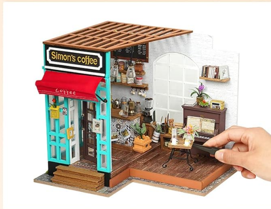
3. Install according to the instruction