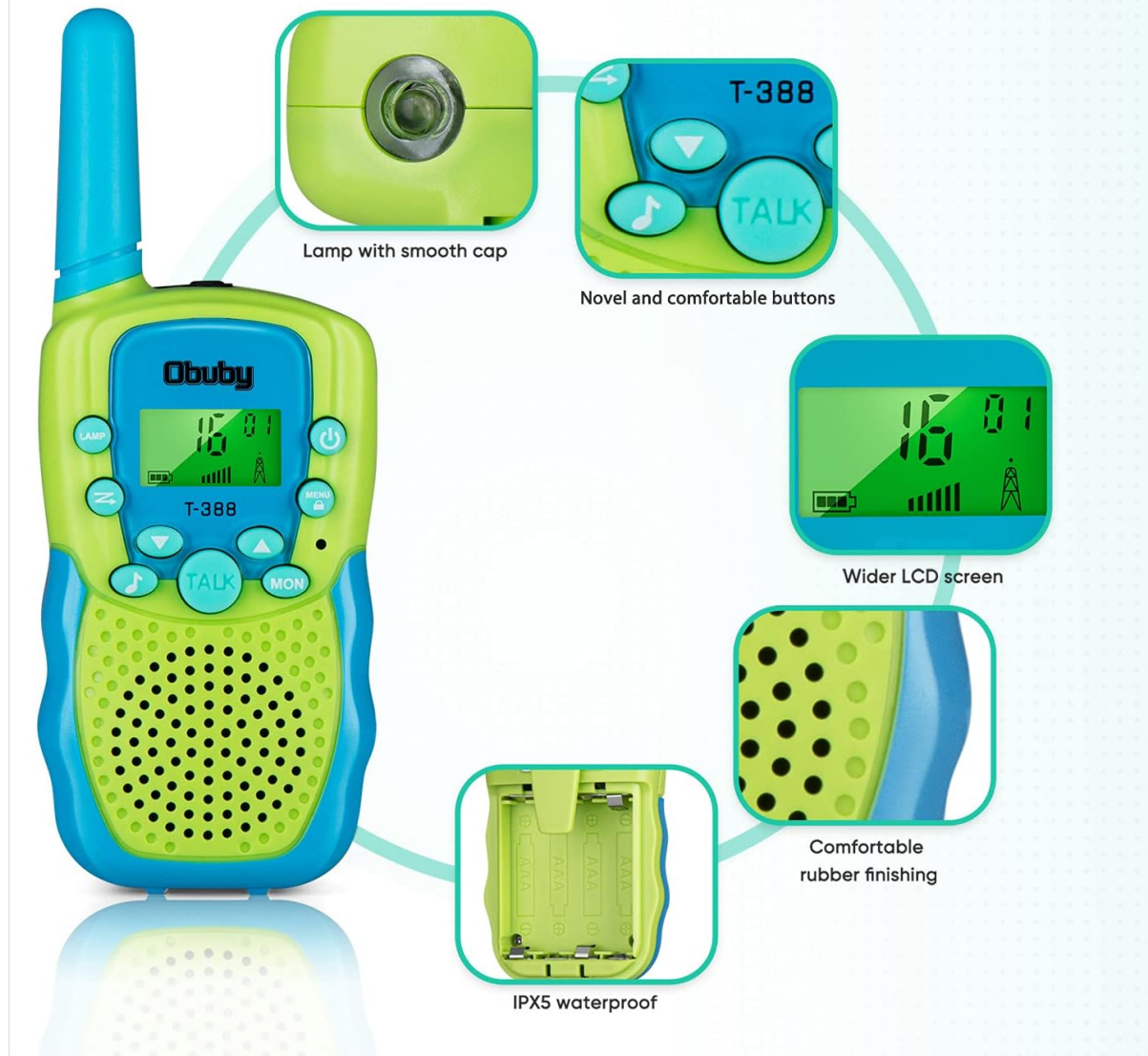
Image: Close-up of the walkie talkie's features and buttons.