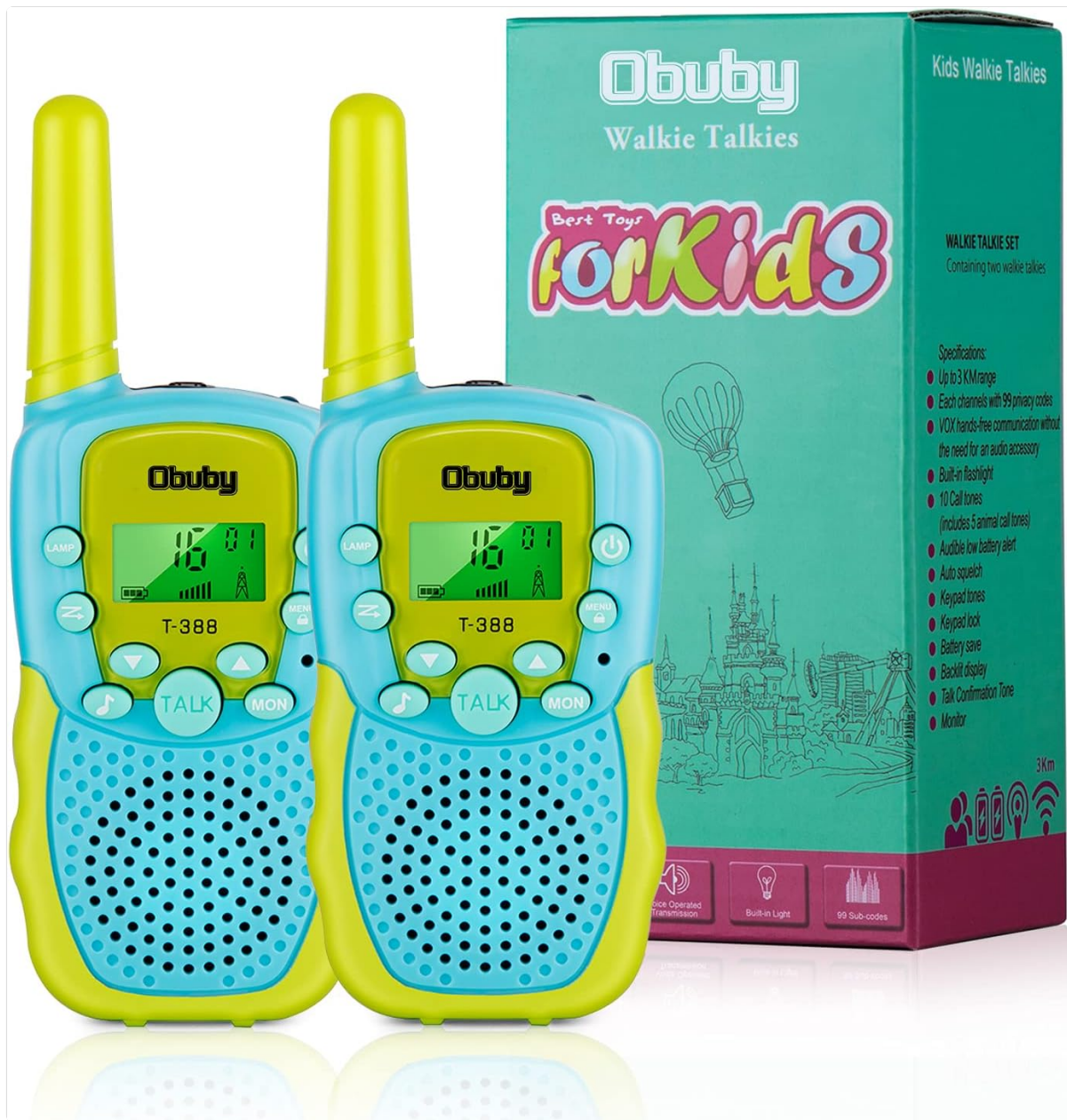
Image: The Obuby Kids Walkie Talkies set, featuring two units and their packaging.