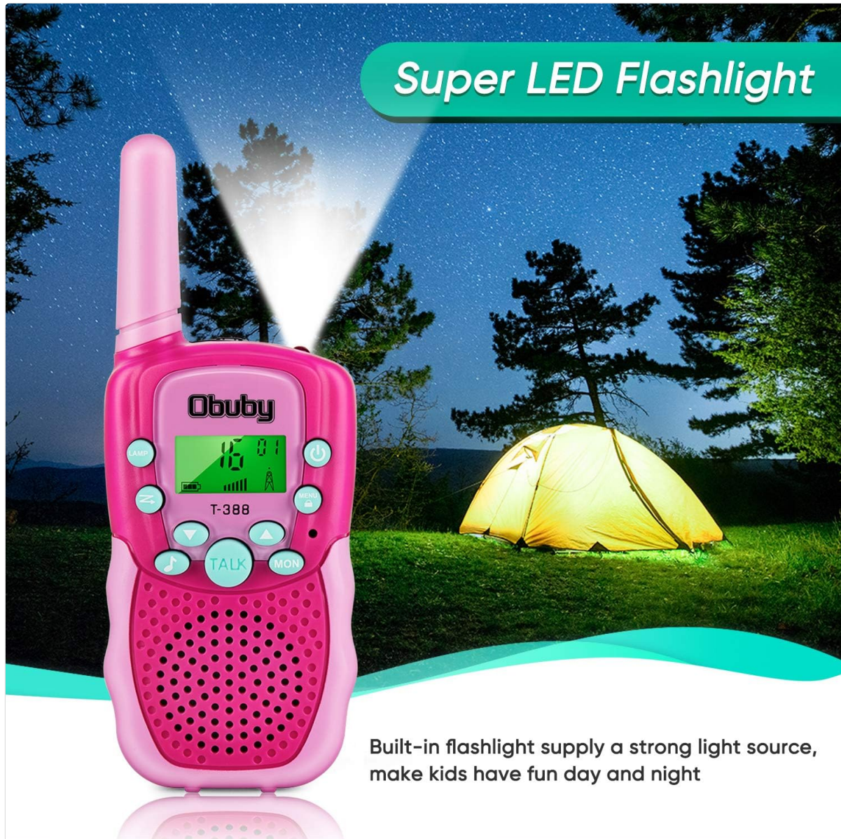
Image: Walkie talkie flashlight in use during an outdoor adventure.

The built-in LED flashlight is located at the top of the walkie talkie. Press the LAMP button (🔦) to turn the flashlight on or off. This feature is useful in low-light conditions.