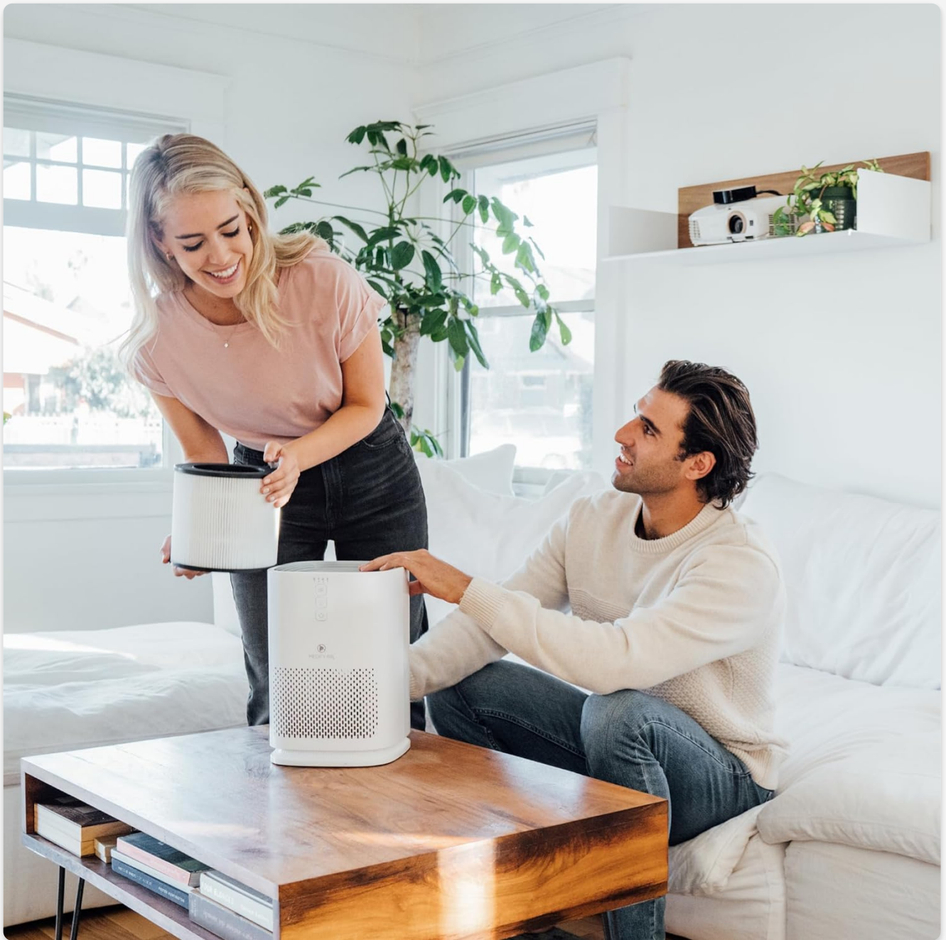
A person demonstrating the easy filter replacement process for the Medify MA-14 Air Purifier.