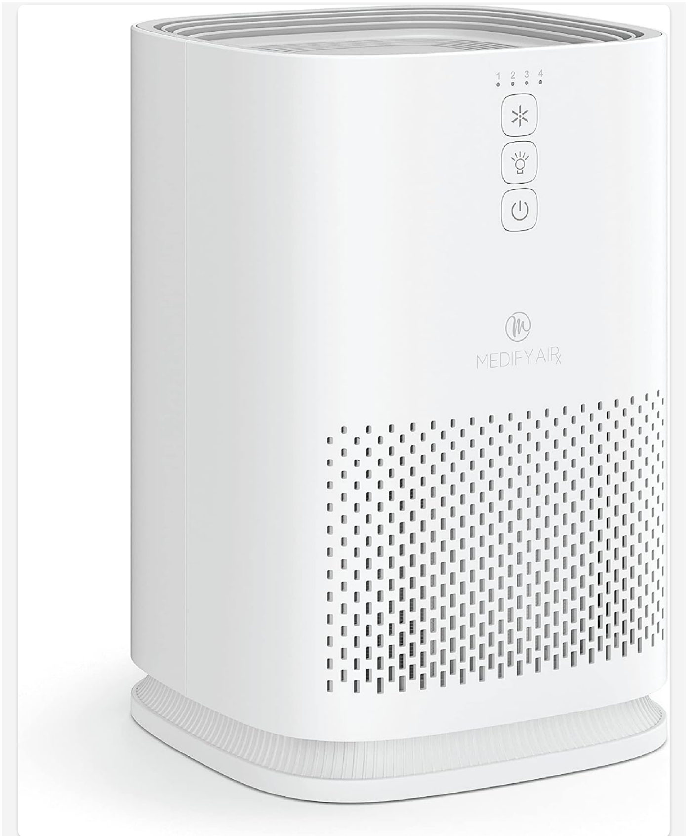
Medify MA-14 Air Purifier, front view, showcasing its compact design and control panel.

This air purifier is ideal for various settings such as homes, apartments, bedrooms, nurseries, living rooms, and offices. It features ultra-quiet operation with multiple fan speeds, a night light, and a sleep mode for undisturbed rest. A convenient filter replacement indicator ensures optimal performance.