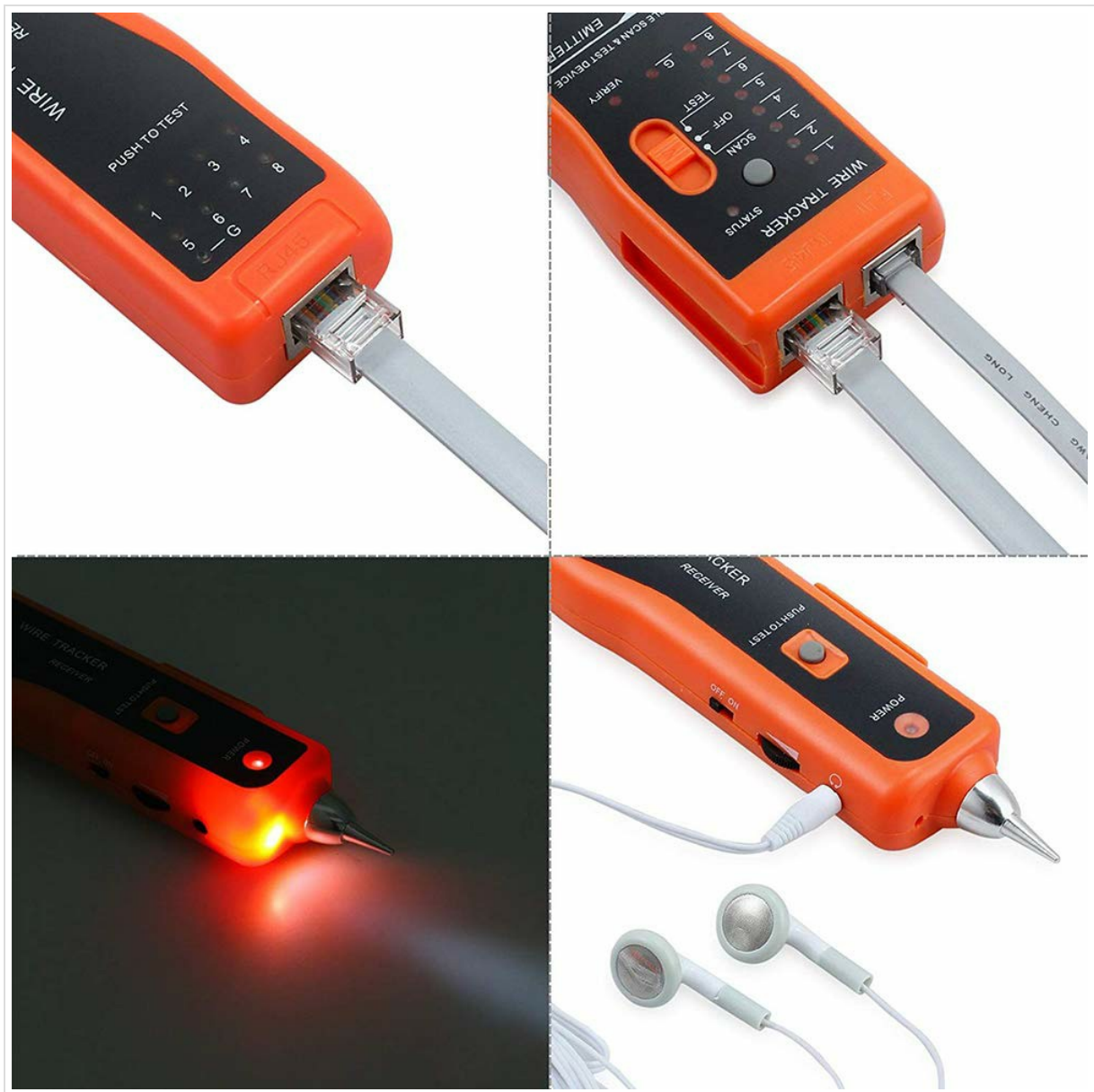
Figure 4.1: Emitter and Receiver Components. This diagram labels key parts of the Wire Tracker. The Emitter features wire finding indicators, wire sequence indicators, a function switching button, a function selector switch, and testing indicators. It also has RJ45 and RJ11 sockets. The Receiver includes a probe, signal indicator, inching button, wire sequence indicator, headset jack, spotlight switch, and volume adjuster.