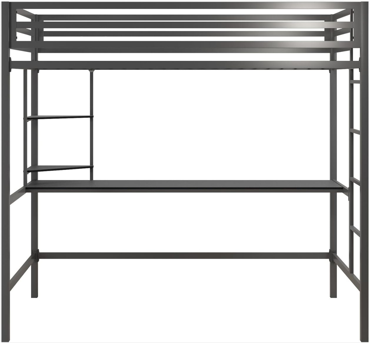
Image: A clear front view of the Novogratz Maxwell Loft Bed, highlighting the spacious desk area and integrated shelves.