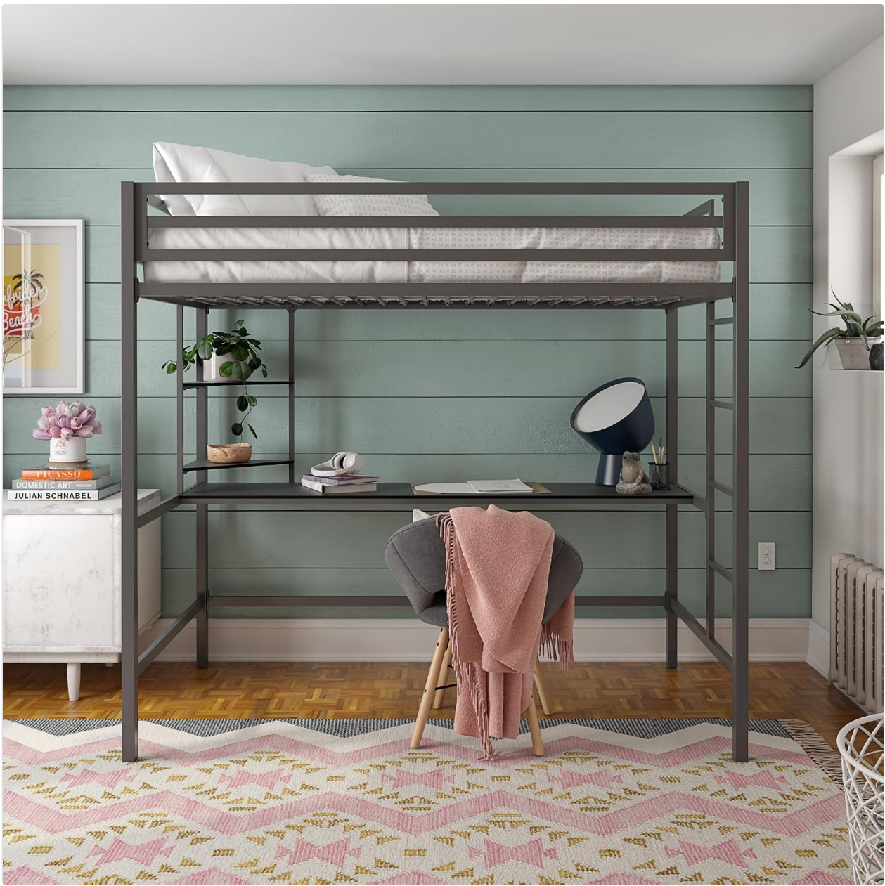
Image: The Novogratz Maxwell Loft Bed fully assembled, showcasing the bed, desk, and shelves in a modern room.