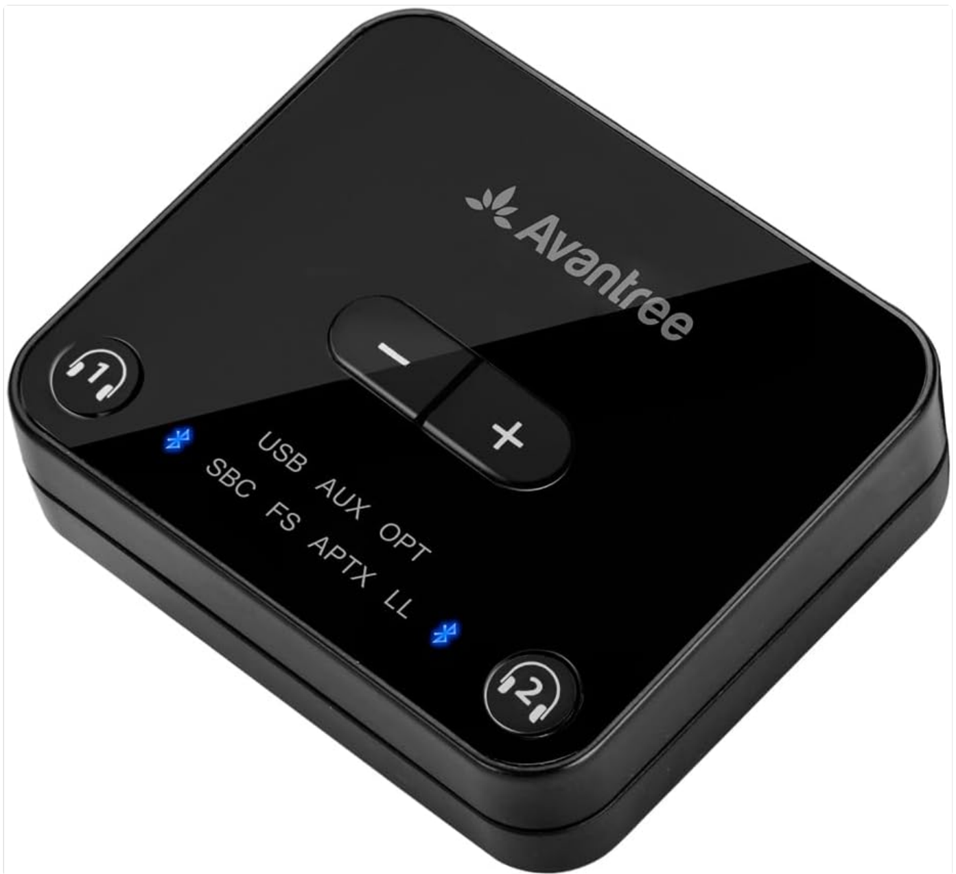
Image: The Avantree Audikast Plus unit, a compact black square device with control buttons and indicator lights on top.