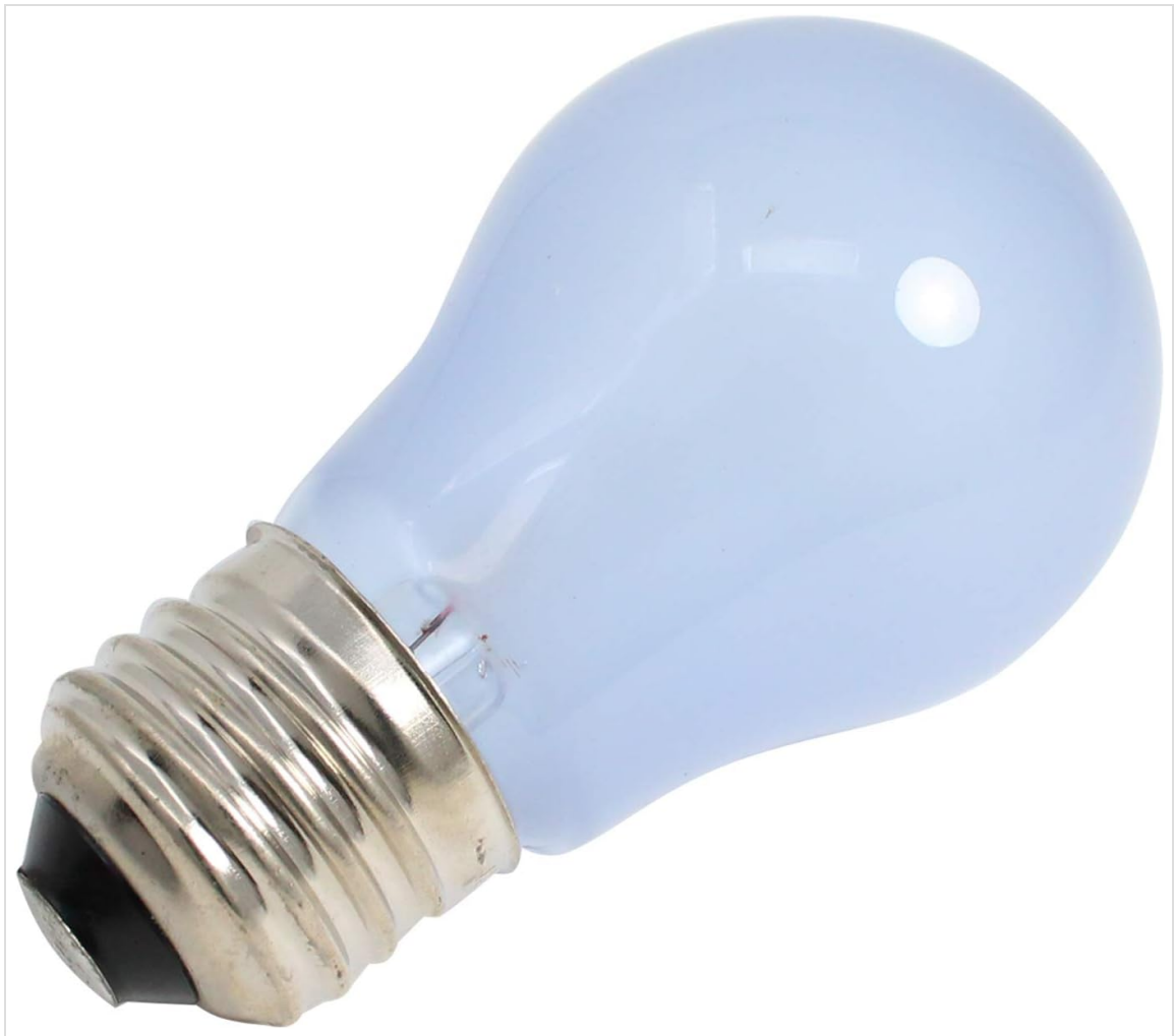
Image 3.1: Close-up of the replacement bulb, highlighting the screw base.

Gently twist the old bulb counter-clockwise to unscrew it from its socket. If the bulb is broken, use pliers to carefully remove the base, ensuring no glass fragments remain.