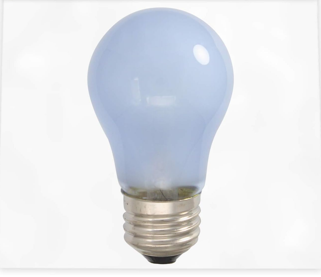
Image 3.2: The UpStart Components 241555401 refrigerator light bulb.

This image displays the complete UpStart Components 241555401 refrigerator light bulb, ready for installation. It features a standard bulb shape and an E26 base.