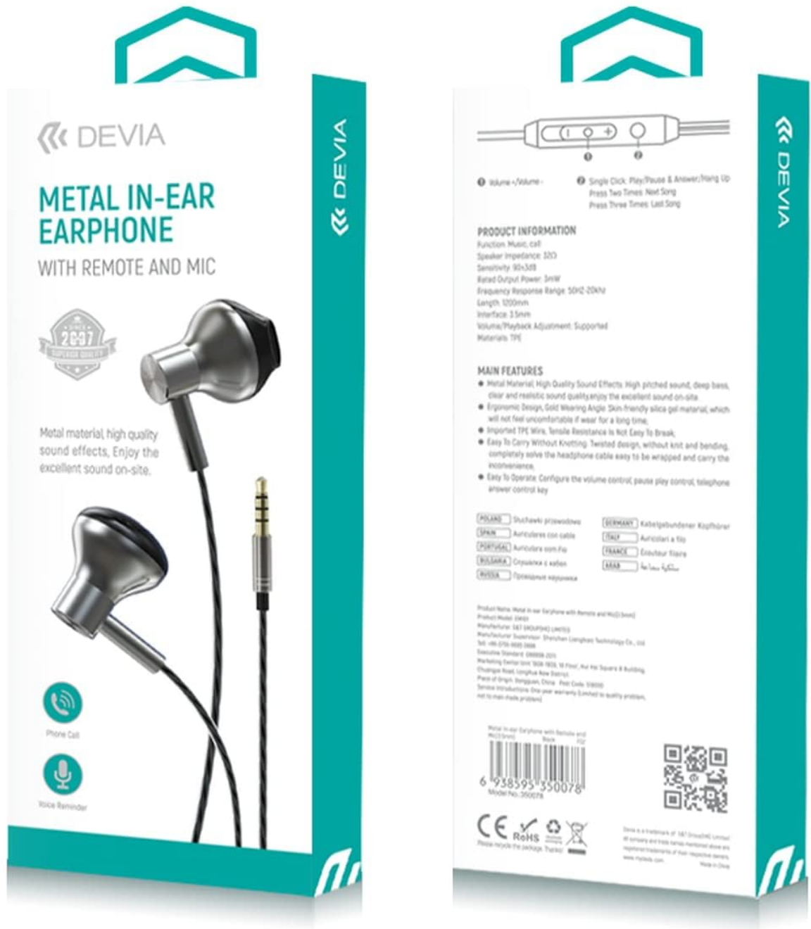
Front and back view of the Devia Metal In-ear Earphone packaging, displaying product features, specifications, and control functions, including remote control layout.