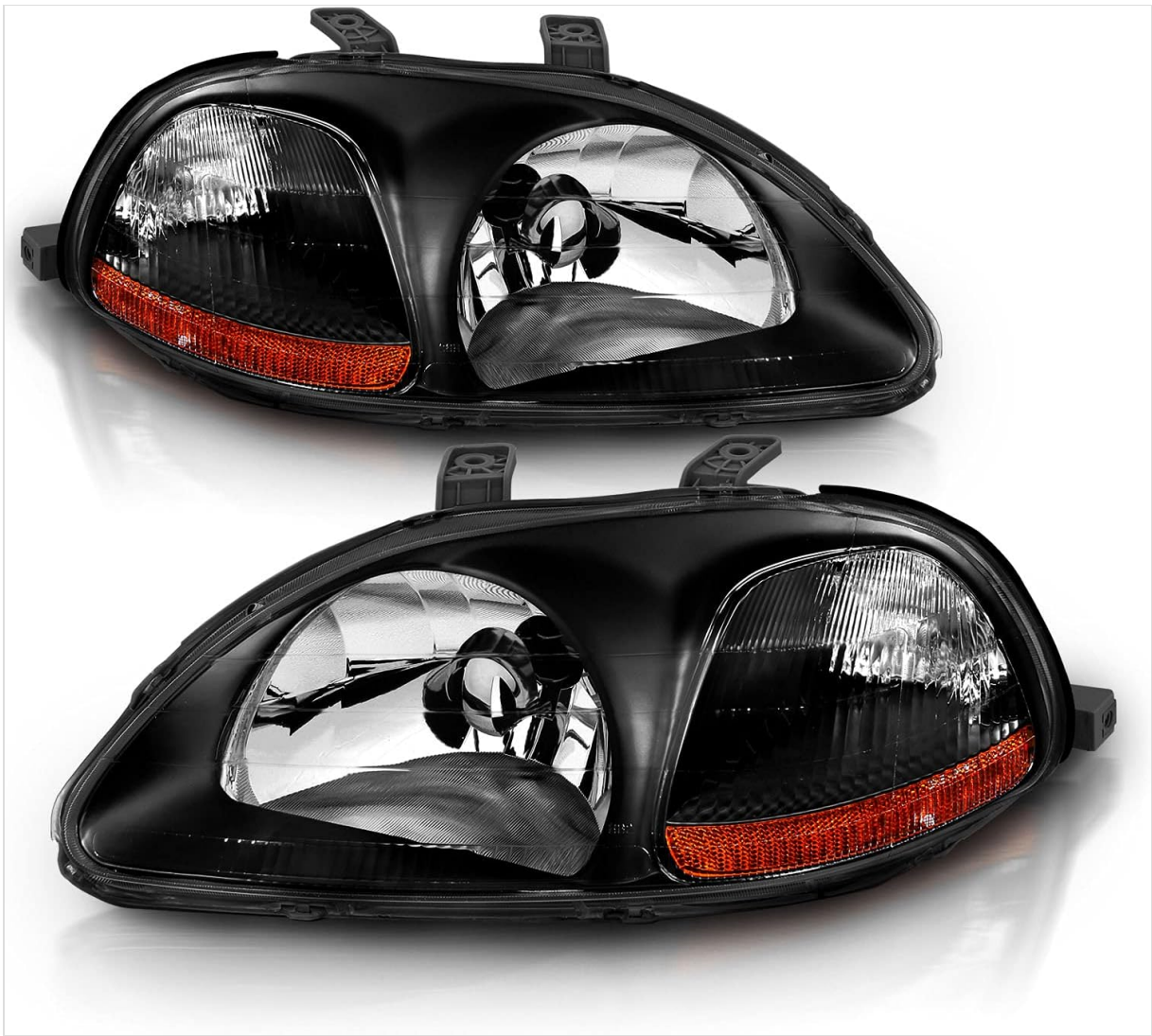
Figure 1: AmeriLite Black Replacement Headlights Set, showing both driver and passenger side units. Note the black housing and clear lens design.