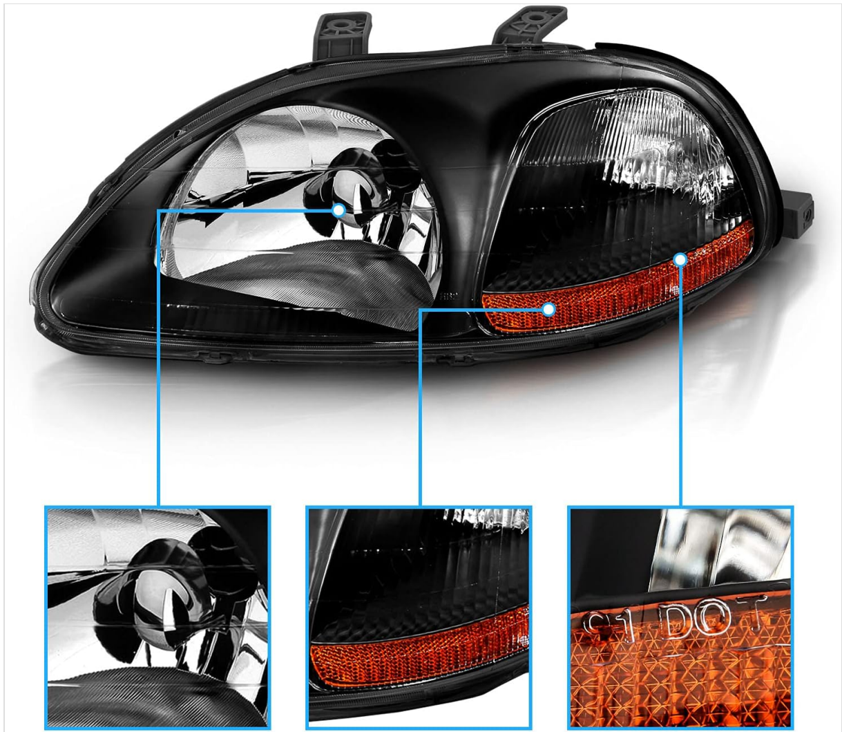
Figure 2: Detailed view of the headlight assembly, illustrating the internal reflector and the amber turn signal section.