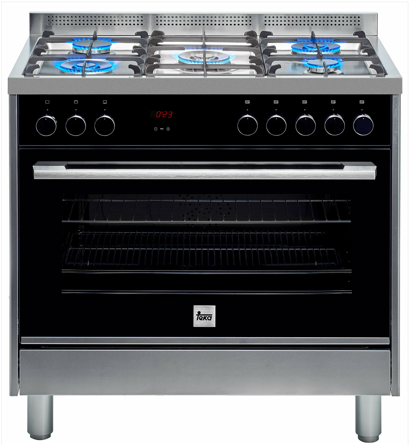
Figure 2.1: Front view of the Teka FS3FF L90GG S/S Freestanding Gas Cooker, showing the hob, control panel, and oven door.