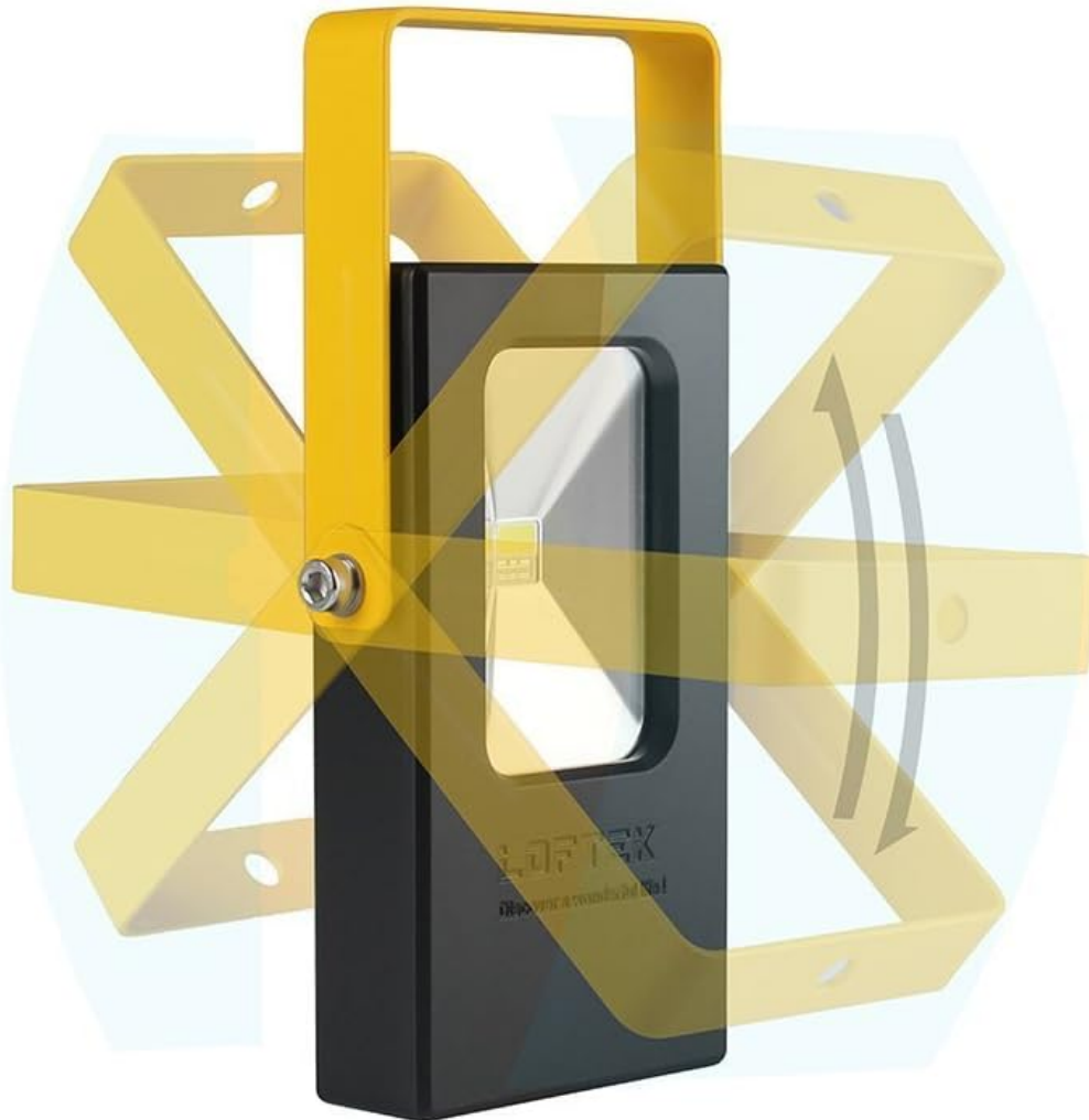
Figure 1: LOFTEK Rechargeable Work Light showing its 360-degree adjustable handle and steel belt clip, highlighting its durable construction, superb heat dispersal, and IP65-rated protection.