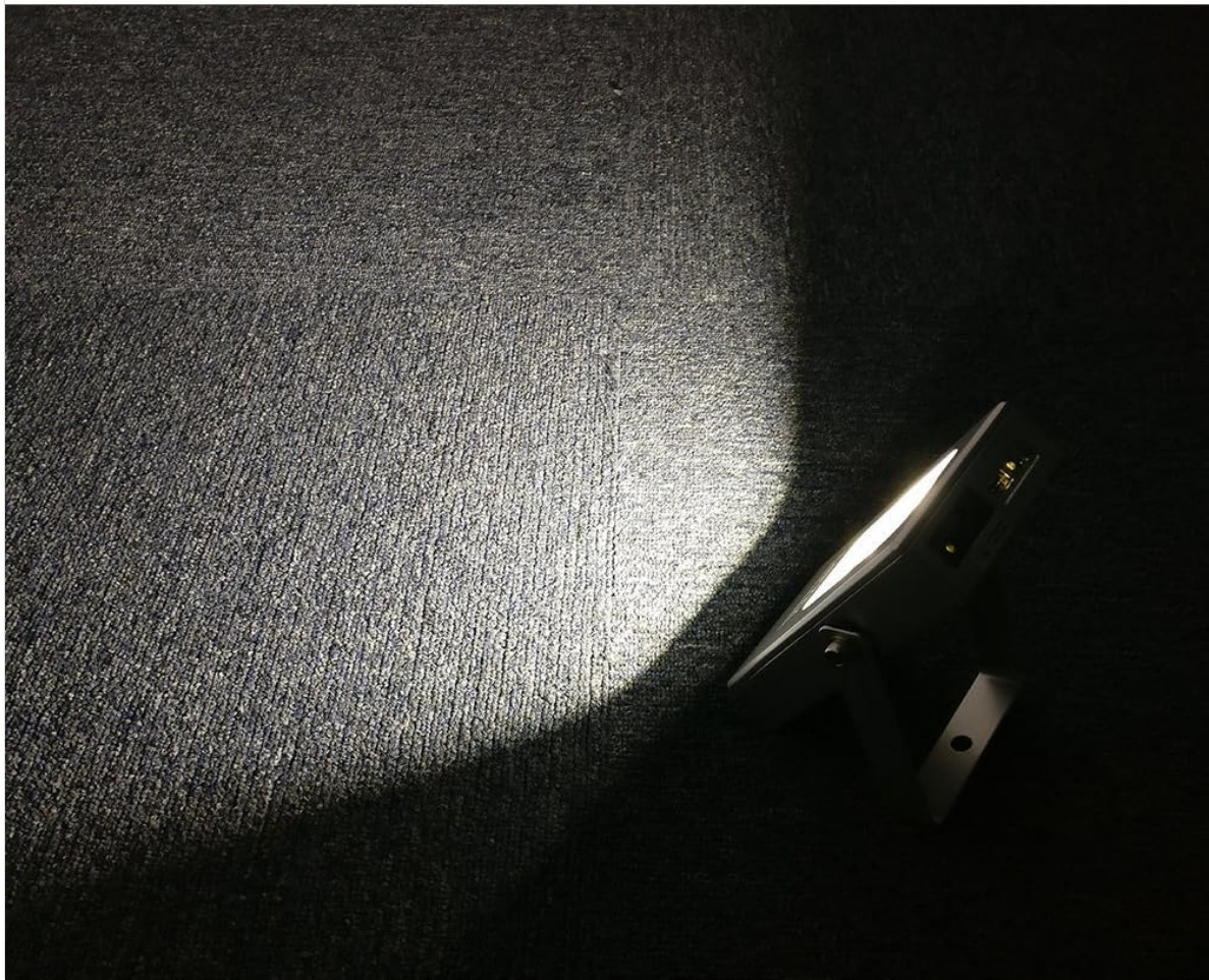
Figure 3: The LOFTEK Work Light demonstrating its powerful illumination on a dark surface, highlighting its 650 lumens maximum brightness.

650lm of maximum brightness with longer battery life.