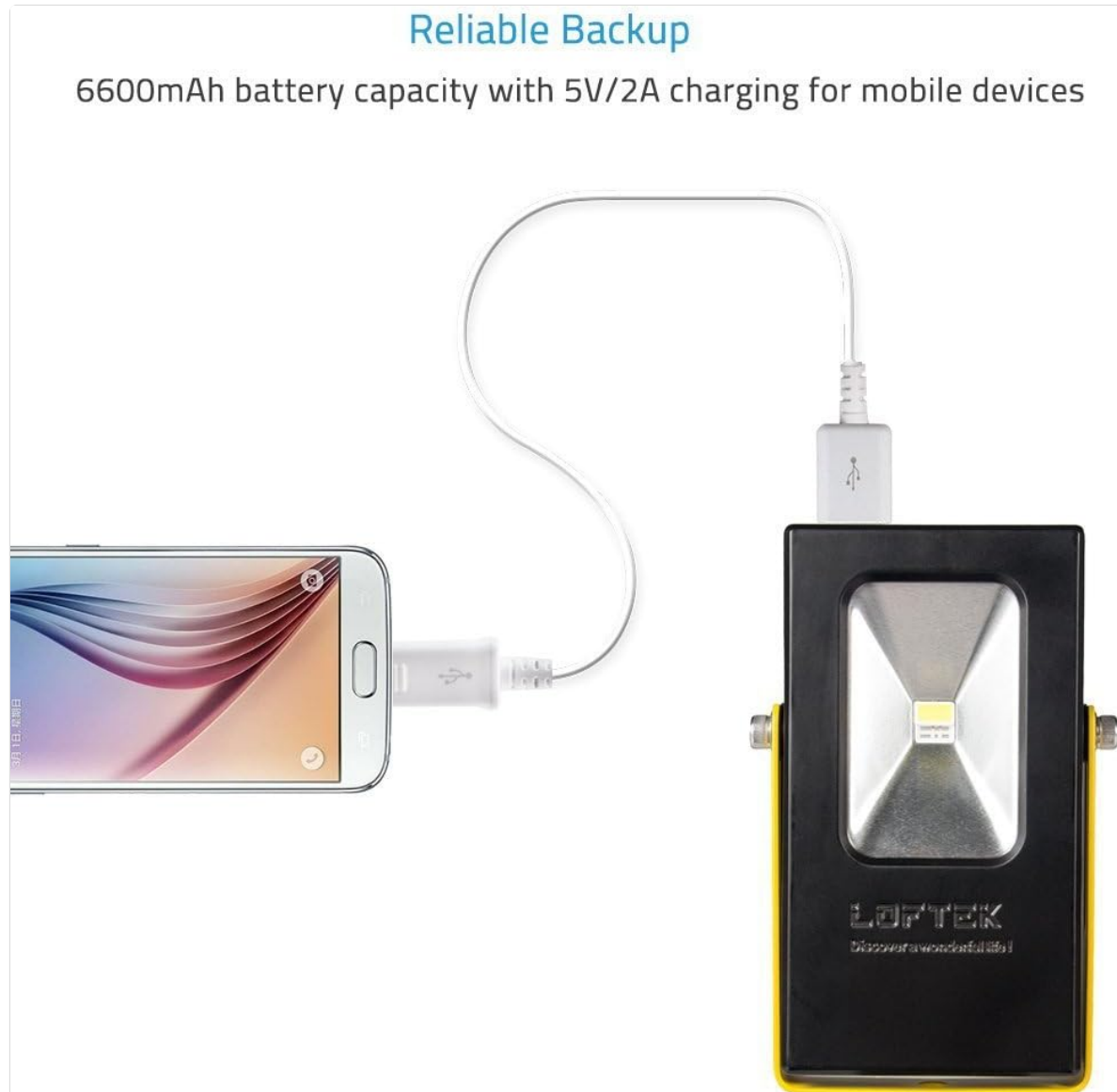
Figure 4: The LOFTEK Work Light providing power to a smartphone via its USB output port, demonstrating its 6600mAh battery capacity for mobile device charging.

The work light can be used to charge your mobile devices. Connect your device's USB charging cable to the output port of the sealed USB interface (3) on the work light. The 6600mAh battery capacity provides reliable backup power.