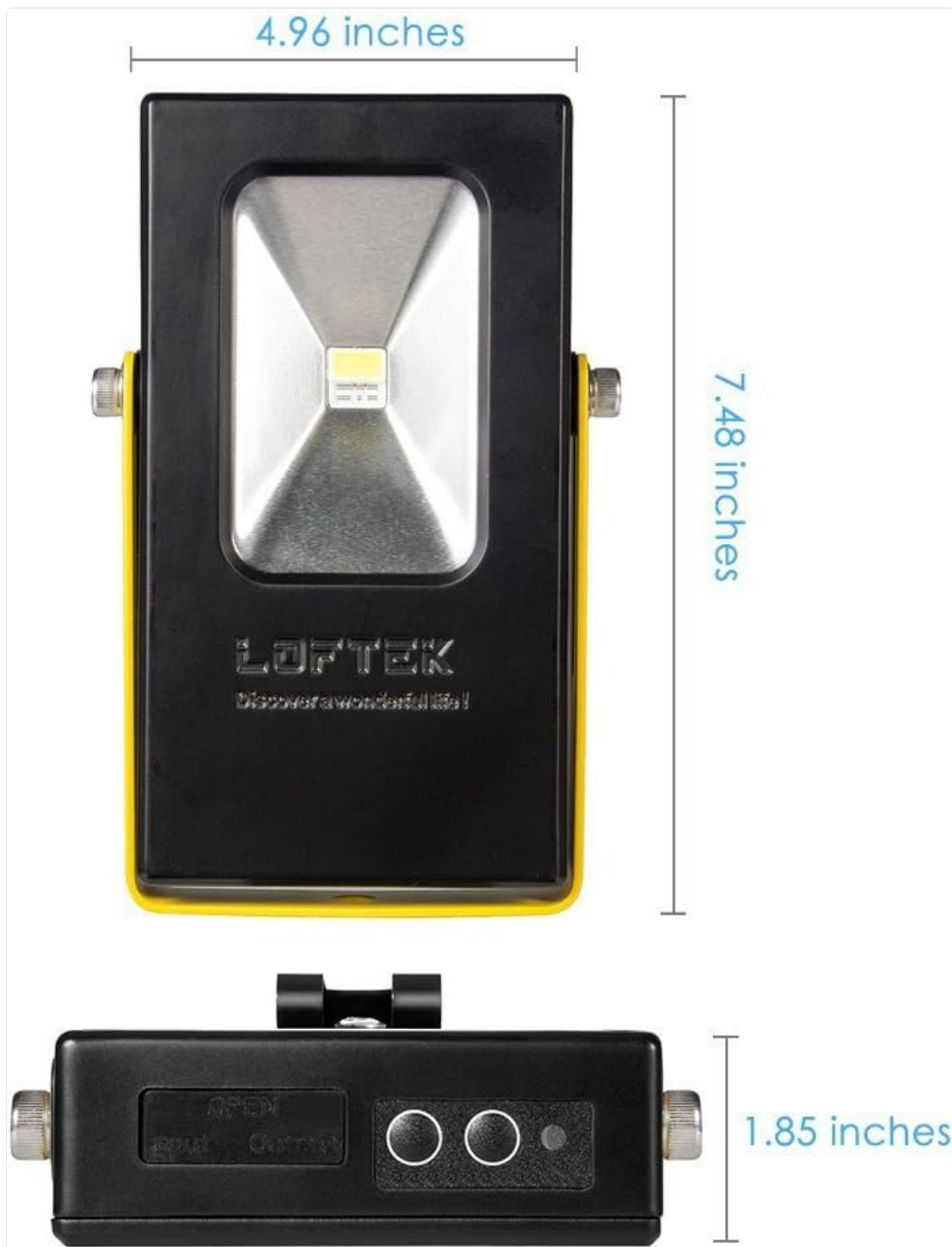
Figure 5: Physical dimensions of the LOFTEK Rechargeable Work Light, showing its length of 4.96 inches, height of 7.48 inches, and thickness of 1.85 inches.