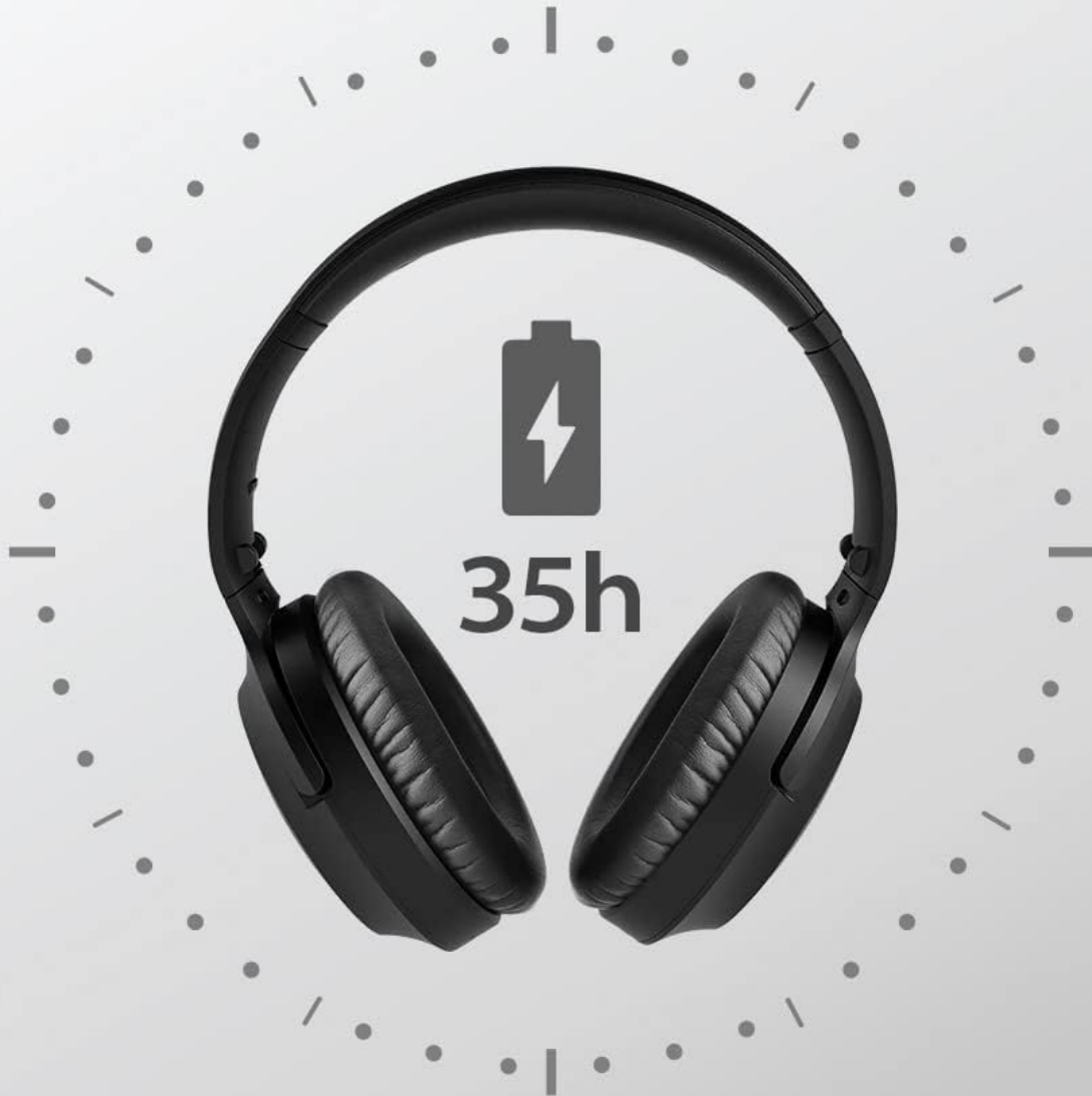
Image: An illustration indicating the extended playtime of the headphones, approximately 35 hours.