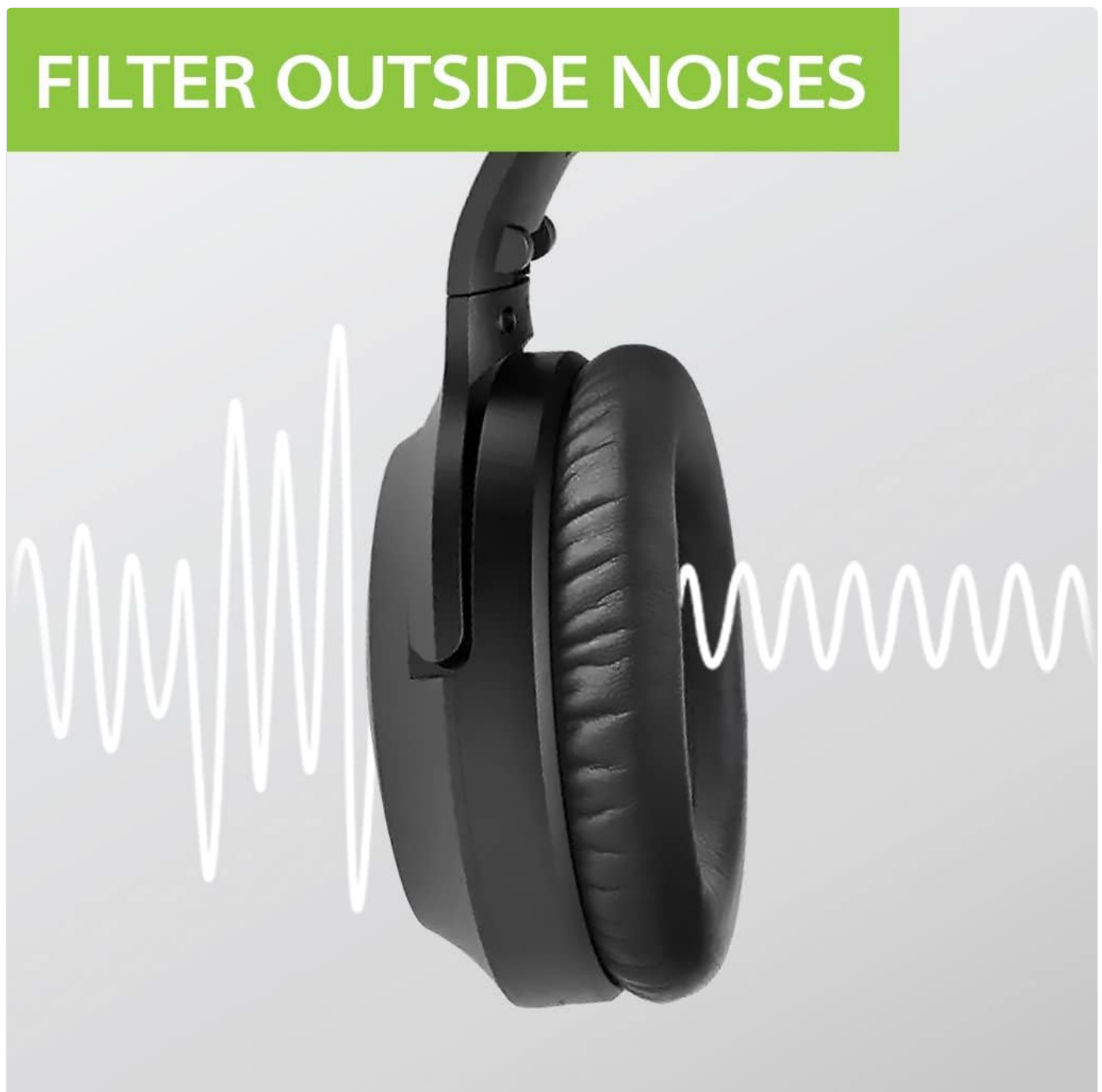
Image: An illustration depicting the active noise cancellation feature, showing sound waves being filtered by the headphones.

The ANC feature reduces ambient noise, providing a more immersive listening experience. To activate or deactivate ANC, locate the dedicated ANC switch on the earcup and slide it to the desired position. Note that ANC is most effective at reducing constant low-frequency sounds.