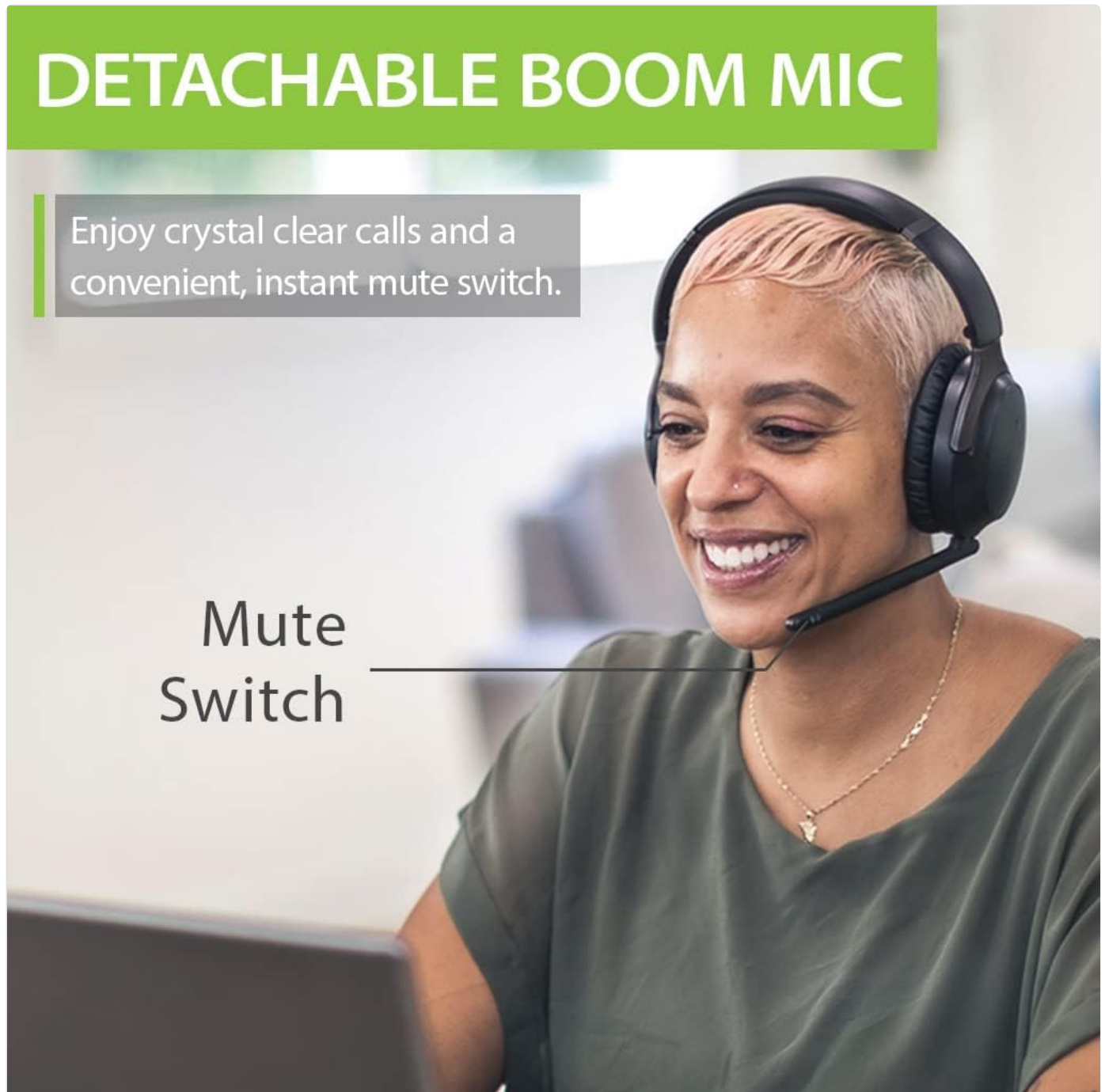
Image: A woman using the Avantree Aria headphones with the detachable boom microphone, highlighting the convenient mute switch.

For clear voice communication, attach the boom microphone to the dedicated port on the left earcup. Ensure it is securely inserted. The microphone can be detached when not needed.