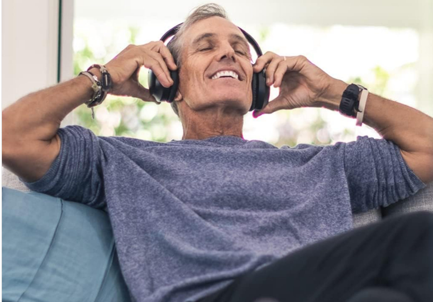
Image: A man wearing the Avantree Aria headphones, demonstrating their comfortable fit for extended use.

Roomy earcups, soft leather earpads and an adjustable headband provide you with long-lasting comfort.