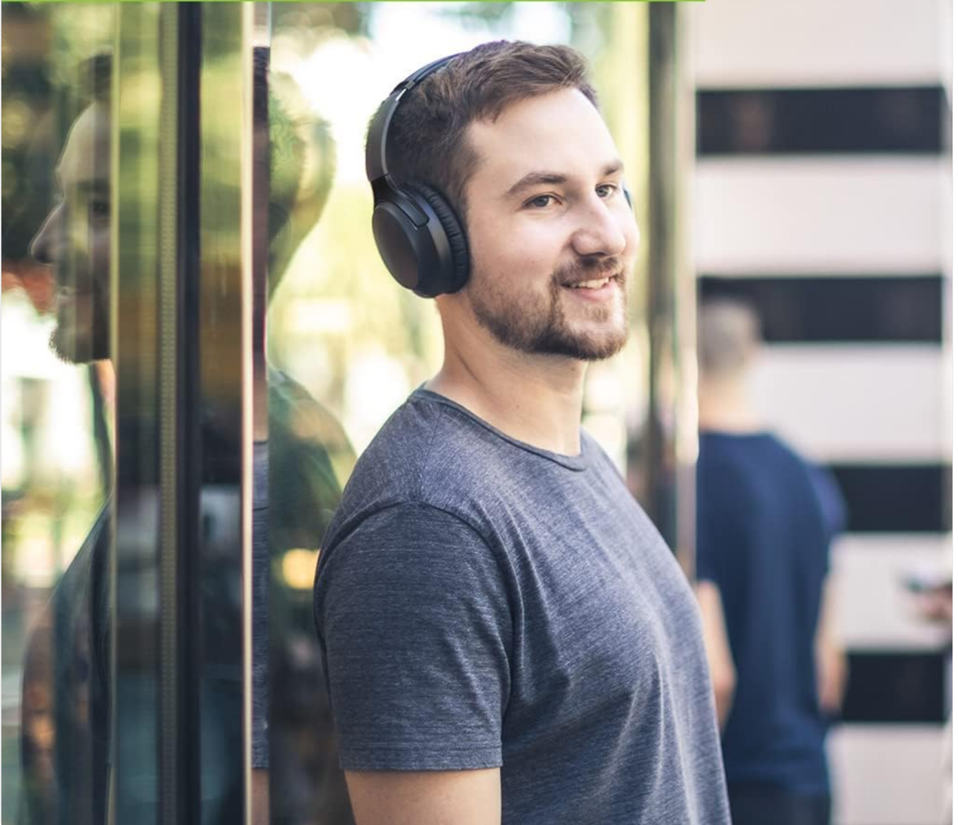
Image: A man listening to music with Avantree Aria headphones, emphasizing the rich stereo sound quality.