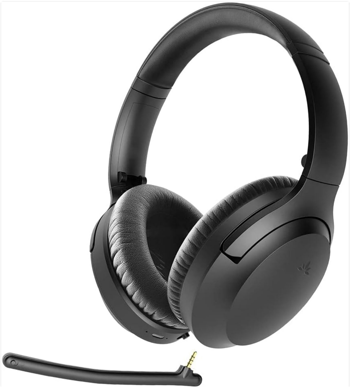
Image: Avantree Aria headphones in black, shown with the detachable boom microphone.