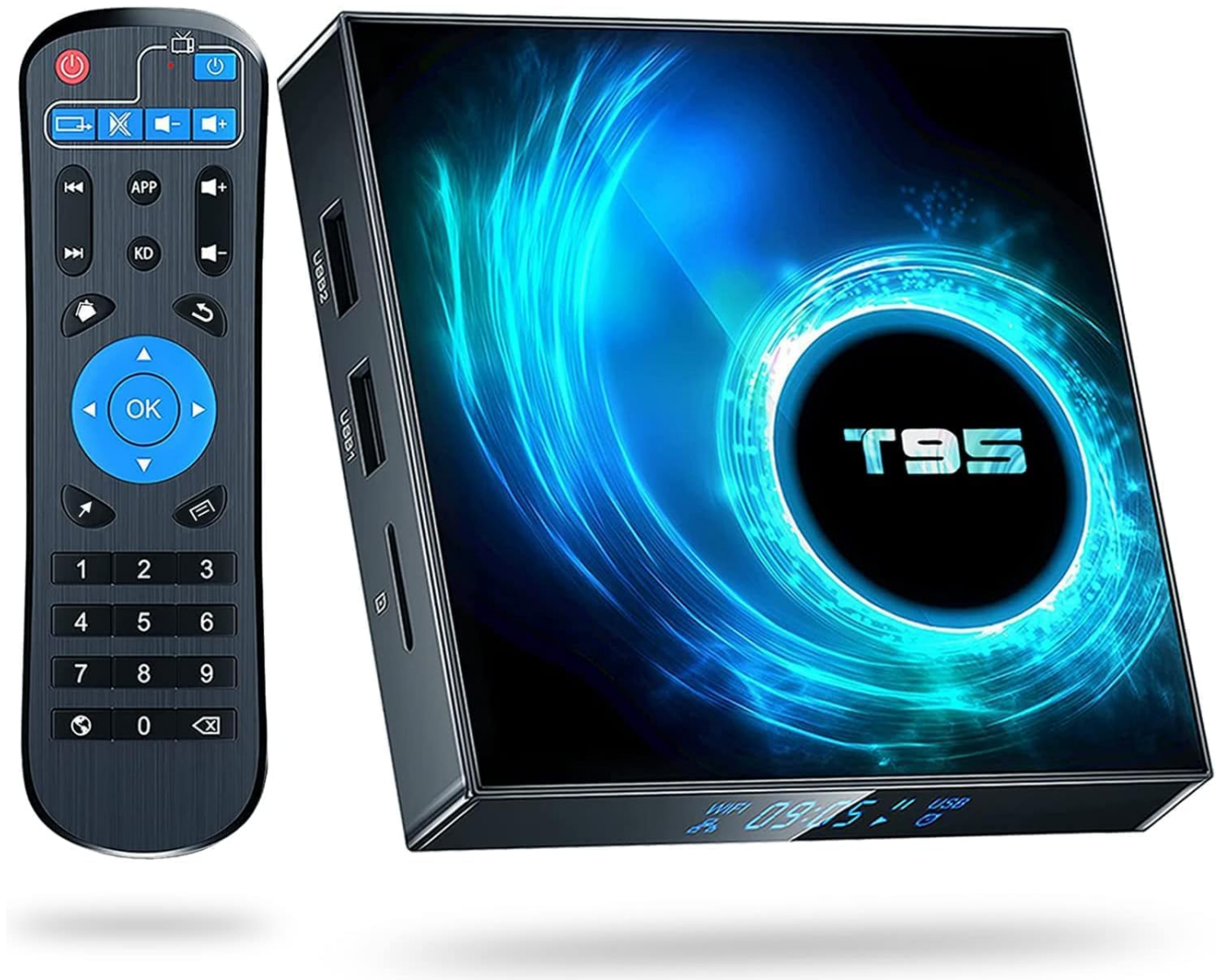
The T95 Android TV Box and its included remote control.