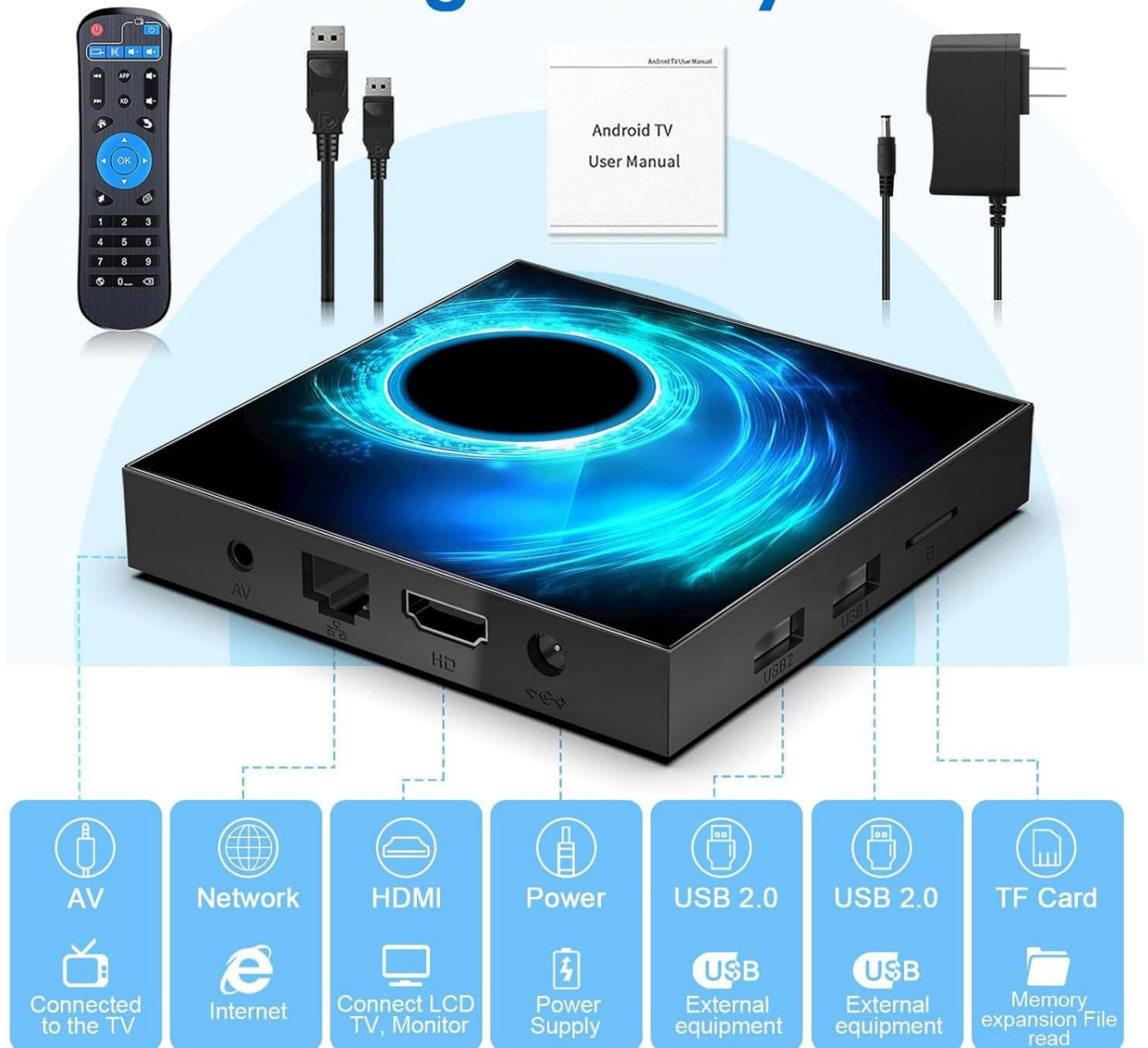
Diagram illustrating the various ports and connections on the T95 Android TV Box, including AV, Network, HDMI, Power, USB 2.0, and TF Card slot.