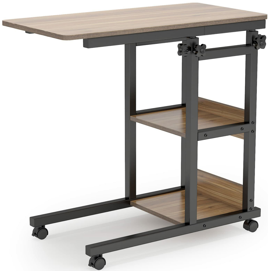
Figure 1.1: Tribesigns Adjustable C Table in use.

The table's C-shaped design allows it to slide easily under sofas, beds, or chairs, bringing the tabletop closer to you. The height can be adjusted to suit different needs and preferences.