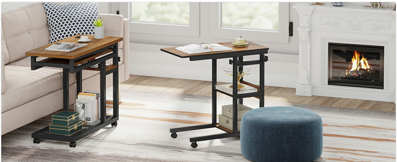
Figure 5.4: C Table in a living room setting.