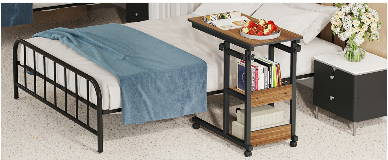
Figure 5.5: C Table used as a bedside table.