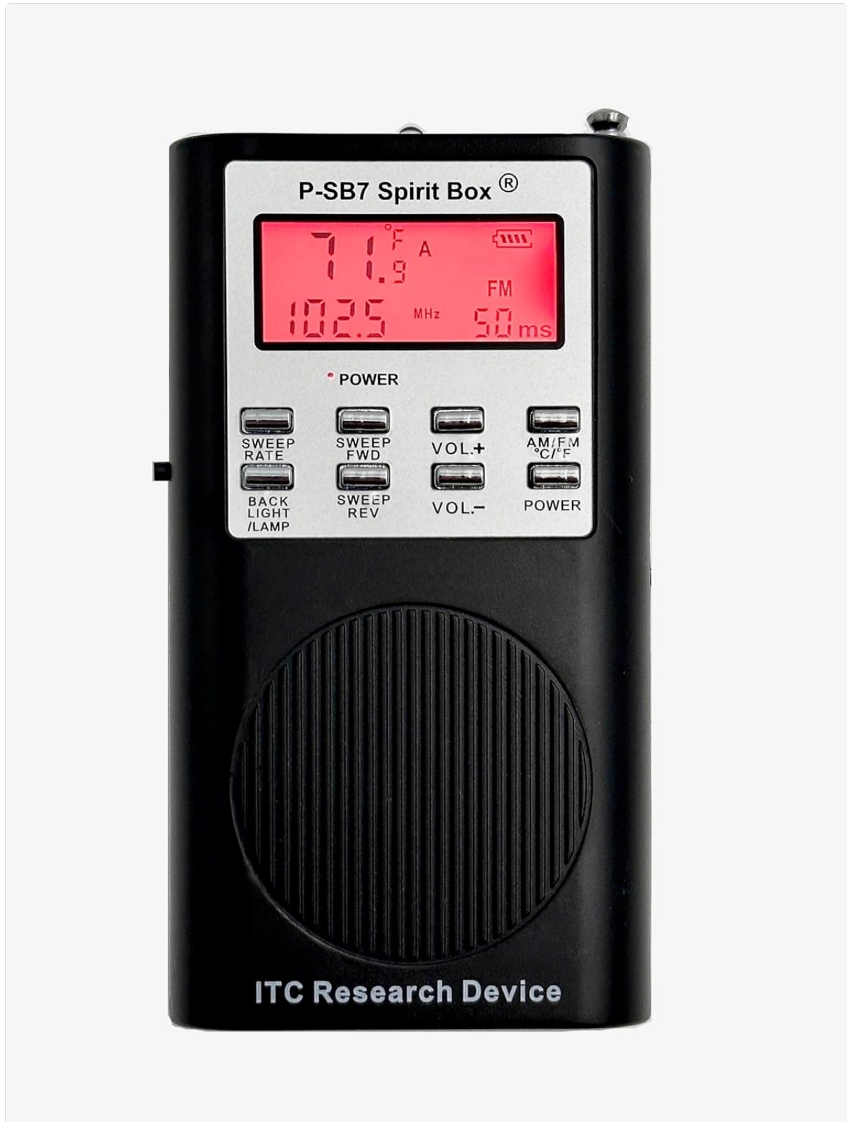
Figure 2: Front view of the P-SB7 Spirit Box, showing the display and control buttons.

Press the 'POWER' button located on the front panel to turn the device on or off. The backlit display will illuminate upon activation, indicating the device is ready for use.