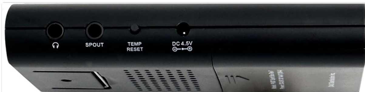
Figure 3: Top view of the P-SB7 Spirit Box, illustrating the headphone and SPOUT ports.

For private listening or connecting the device to an external recording unit or speaker, utilize the 3.5mm headphone jack or the 'SPOUT' port located on the top edge of the unit.