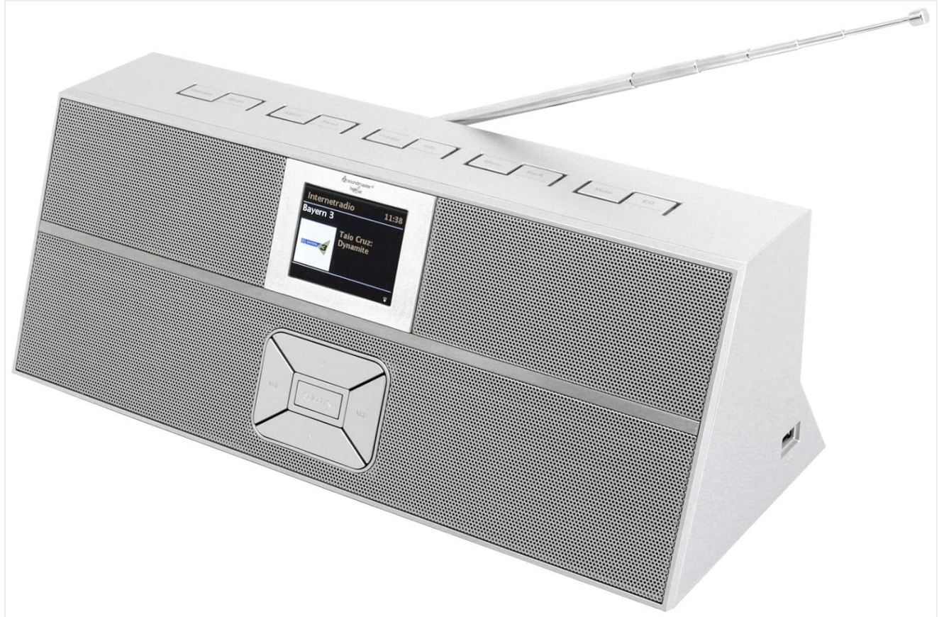
Figure 4.1: Front angled view of the Soundmaster IR300SI radio, showing the display, speakers, and control buttons.

Familiarize yourself with the various parts and controls of your Soundmaster IR300SI radio.