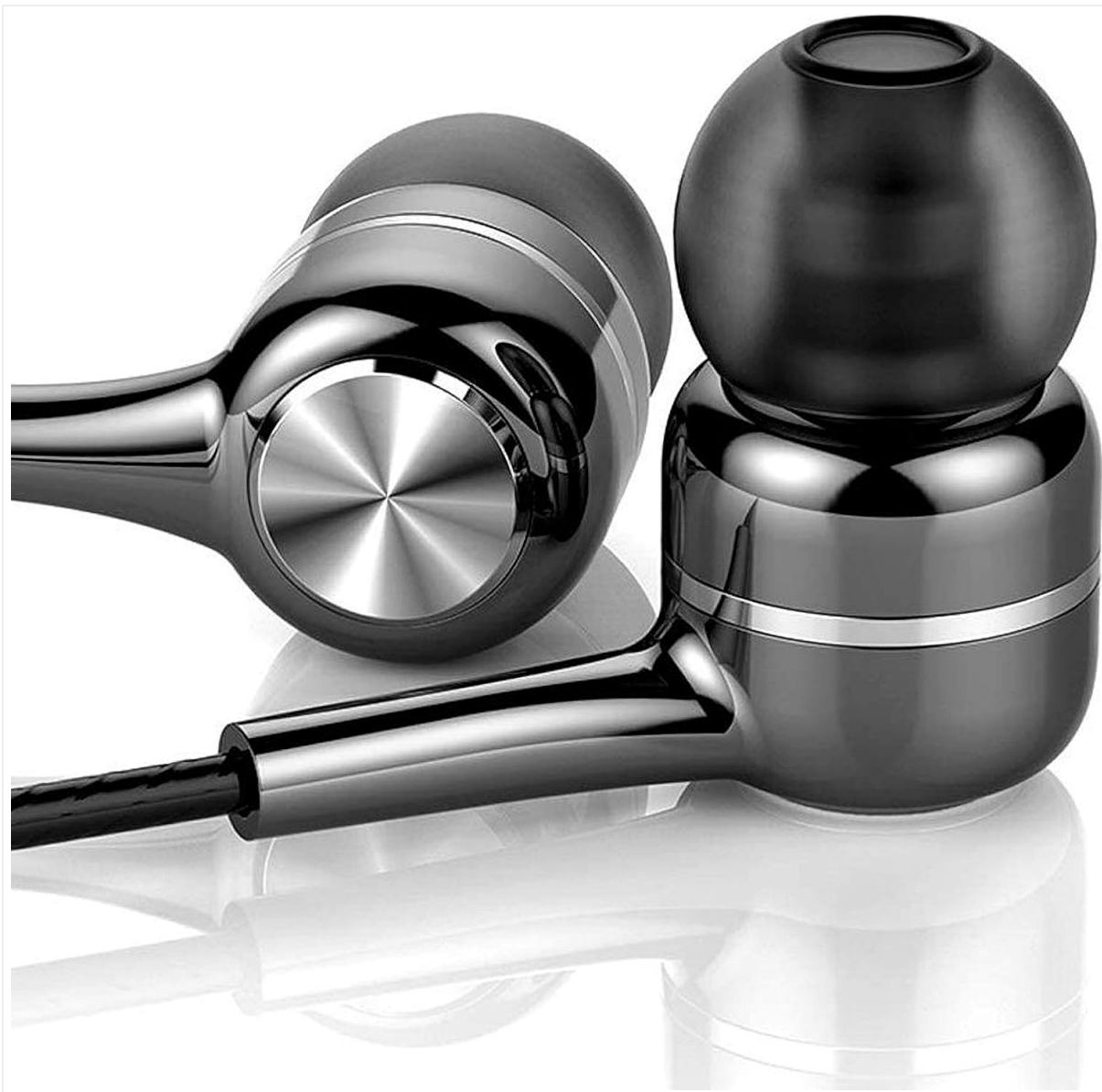
Image: Close-up of an Earbud.

A close-up shot of a single earbud, illustrating its in-ear design and the quality of its construction.