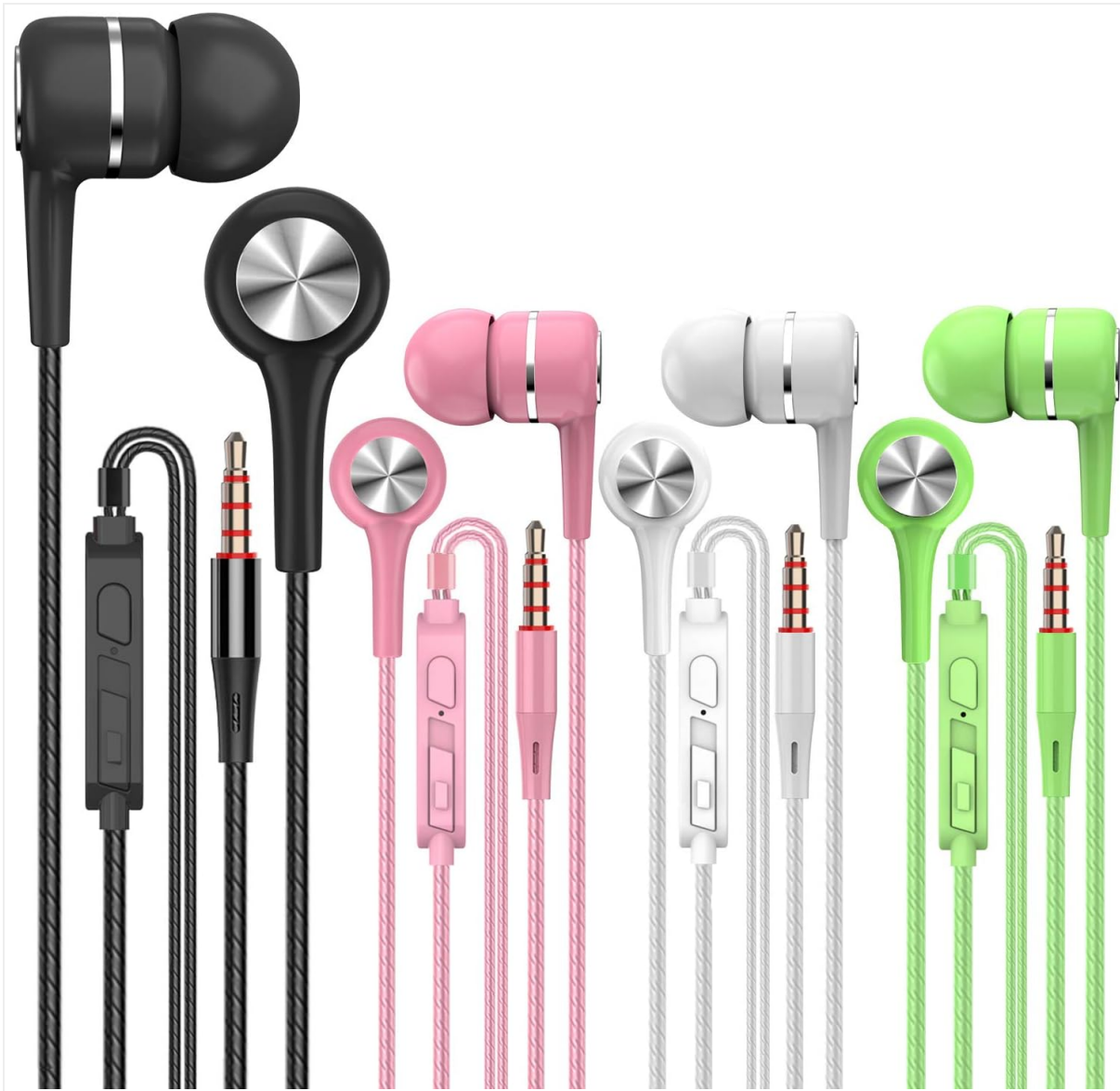
Image: YNR A12-4 Wired Earbuds in various colors.

The image displays four pairs of YNR A12-4 wired earbuds, each in a different color: black, pink, white, and green. The earbuds feature a standard 3.5mm audio jack, suitable for a wide range of devices.