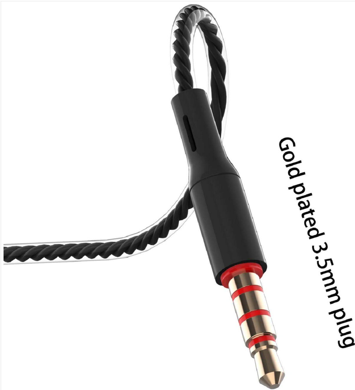
Image: Gold-Plated 3.5mm Audio Jack.

A detailed view of the gold-plated 3.5mm audio jack, designed for reliable connection with various audio devices.