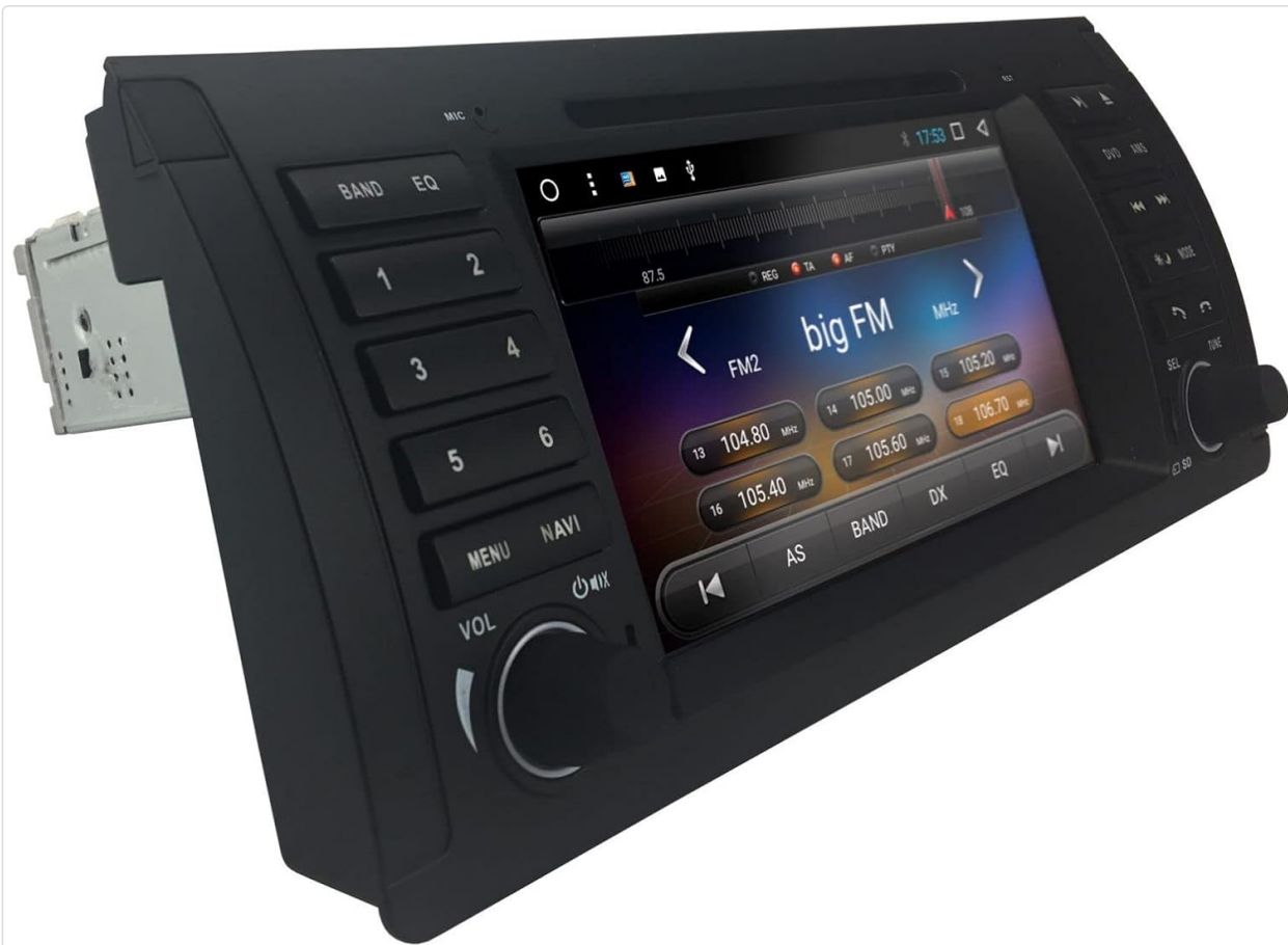
Figure 4: Radio Interface. This image displays the unit's radio screen, showing FM frequencies and preset options, indicating the current station and available tuning controls.