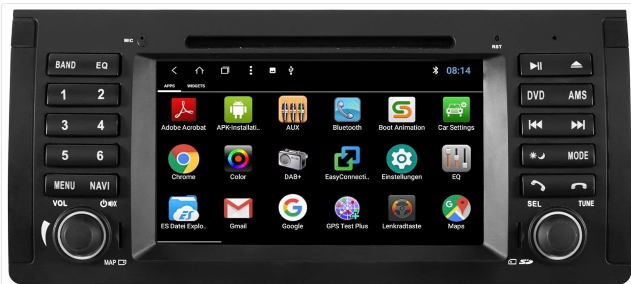
Figure 2: Android Home Screen. This image shows the main interface of the ESX VN715-E39-DAB, featuring the Android operating system with various application icons such as navigation, radio, Bluetooth, and settings, accessible via the