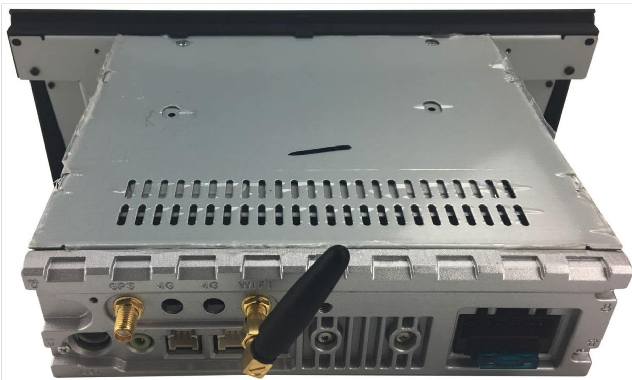
Figure 1: Rear Connections. This image displays the rear panel of the ESX VN715-E39-DAB unit, highlighting the various input and output ports for power, speakers, GPS, Wi-Fi, and other accessories. Proper connection of these ports is crucial for system functionality.