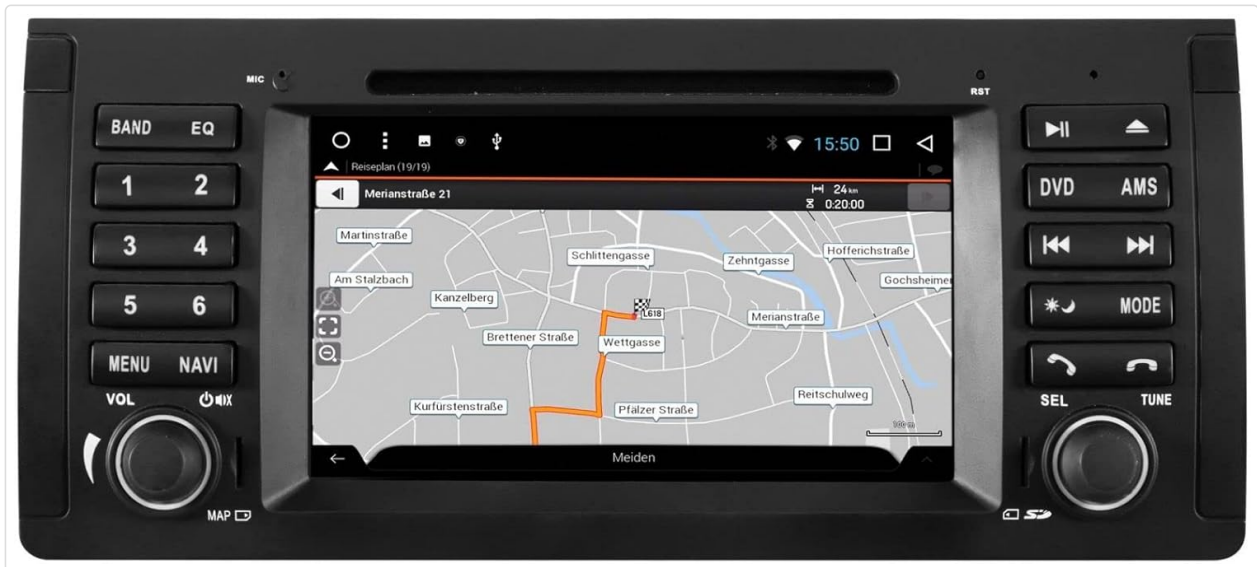
Figure 3: Navigation Interface. This image illustrates the navigation screen of the unit, showing a detailed map with a planned route and current location, demonstrating the system's guidance capabilities.

Access the navigation application (e.g., Google Maps) from the home screen. Input your destination, and the system will provide turn-by-turn directions. Ensure GPS antenna is properly connected for accurate positioning.