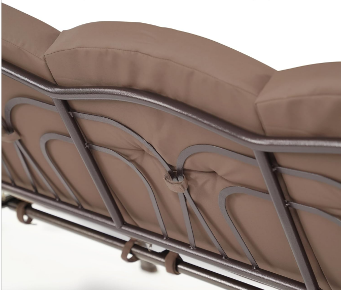
Image: Velcro straps on cushions to keep them securely in place on the metal seat, preventing sliding.

Ensuring that the cushions & backrest remain securely in place.