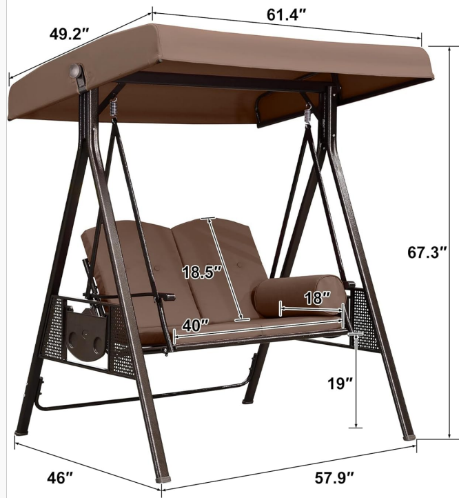
Image: Detailed product dimensions for the 2-seat porch swing.