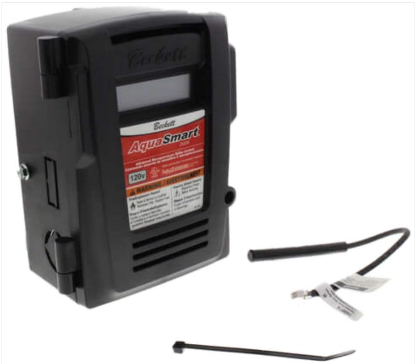
Figure 1: The Beckett AquaSmart Boiler Temperature Control unit, showing the main control box and associated wiring components.