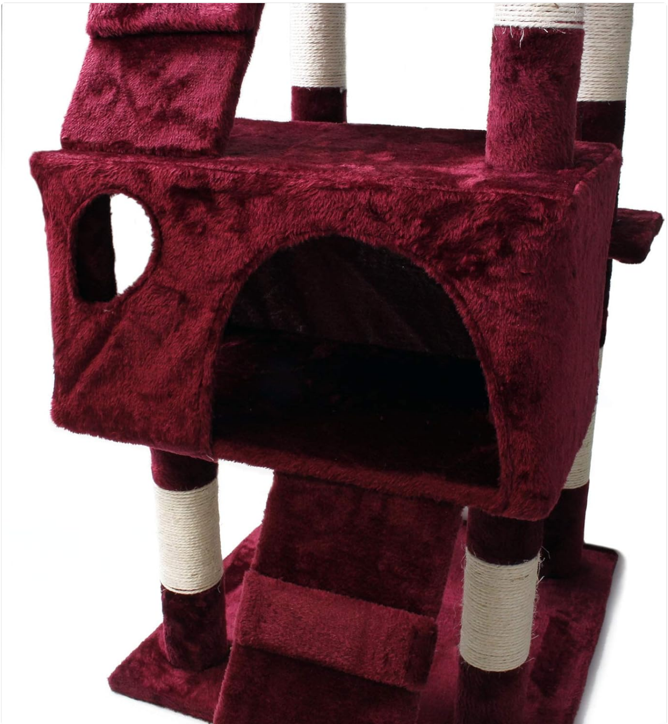
Figure 5: Detail of an enclosed cat cave with its entrance and an adjacent ramp, highlighting the comfortable retreat and accessibility features.