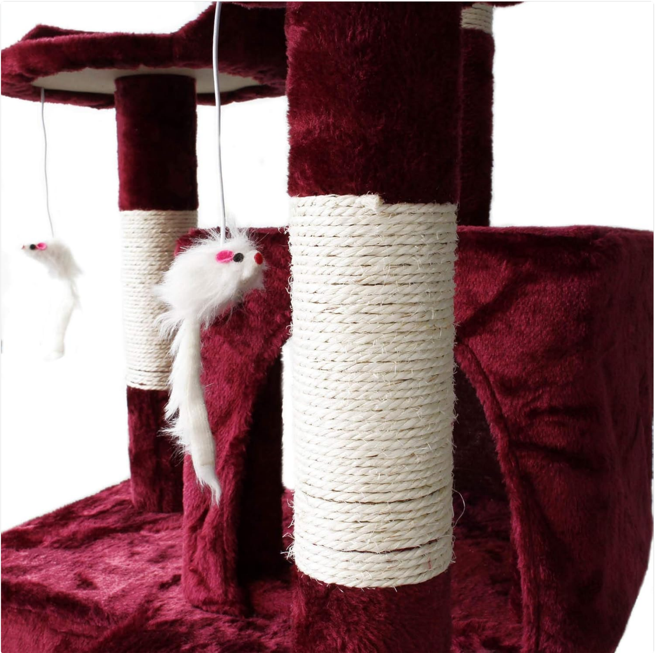
Figure 4: Detail of a sisal-wrapped scratching post and a hanging toy, illustrating the durable material and interactive elements.