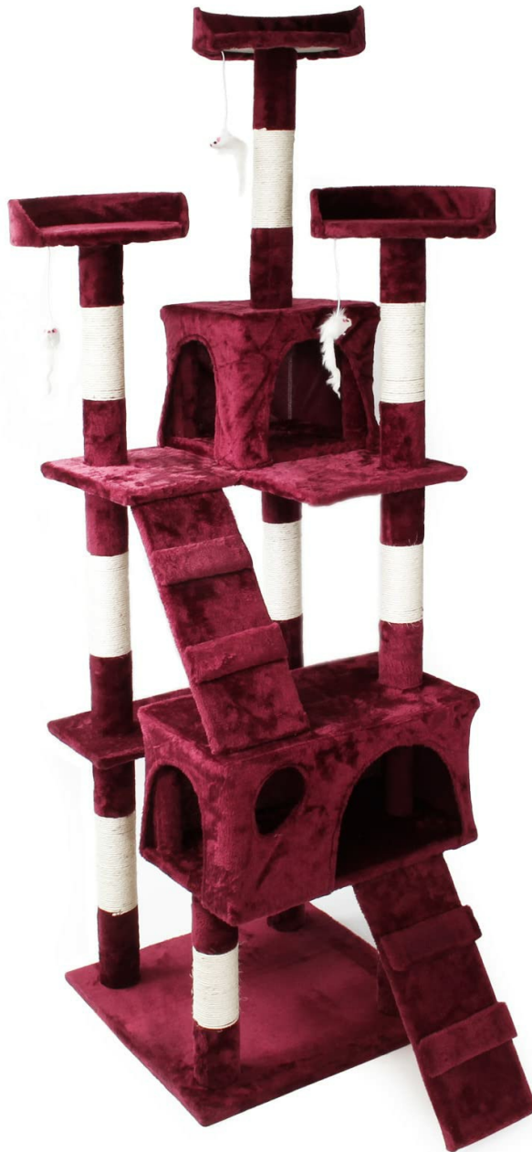
Figure 1: Complete view of the WiTec Cat Tree, showcasing its multi-level design, scratching posts, and resting areas in wine red.