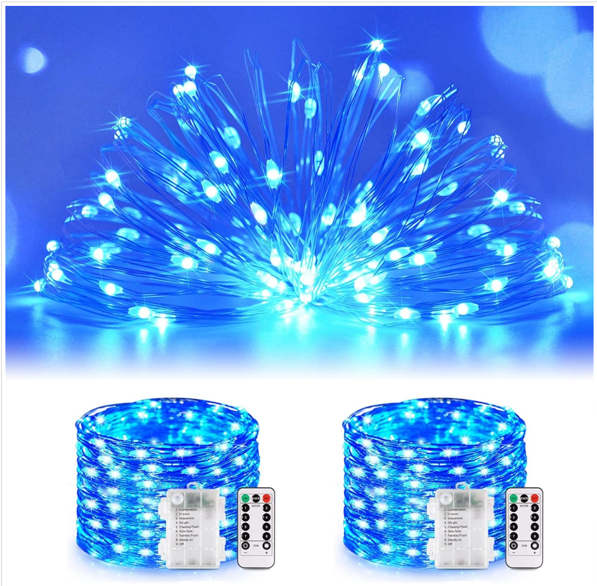
Image: The complete package contents, including two sets of blue fairy lights, battery boxes, and remote controls.