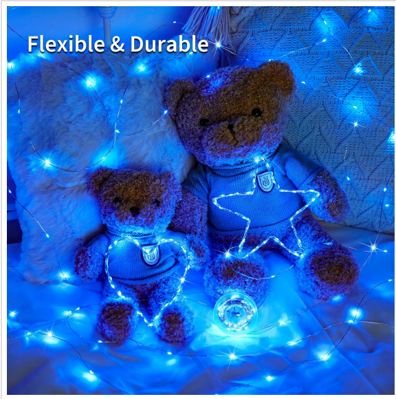
Image: Close-up of the flexible copper wire lights.