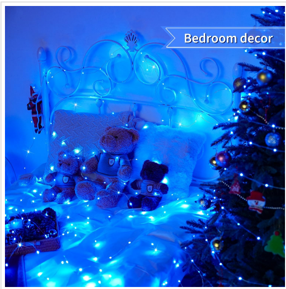
Image: Bedroom decor with blue fairy lights on a canopy bed.