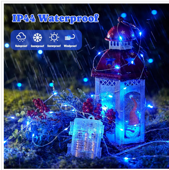
Image: Waterproof battery box and lights in a rainy outdoor setting.