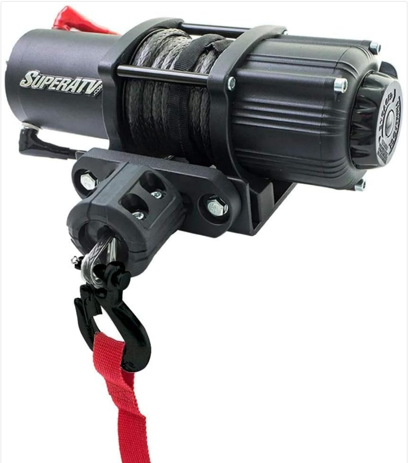
Figure 3.1: SuperATV 3500 LB Black Ops Winch Kit, showing the main winch assembly with synthetic rope and hook.

Carefully unpack all components and verify against the packing list. The kit typically includes the winch assembly, synthetic rope, aluminum hawse fairlead, waterproof solenoid, wireless remote, dash rocker switch, and installation hardware.