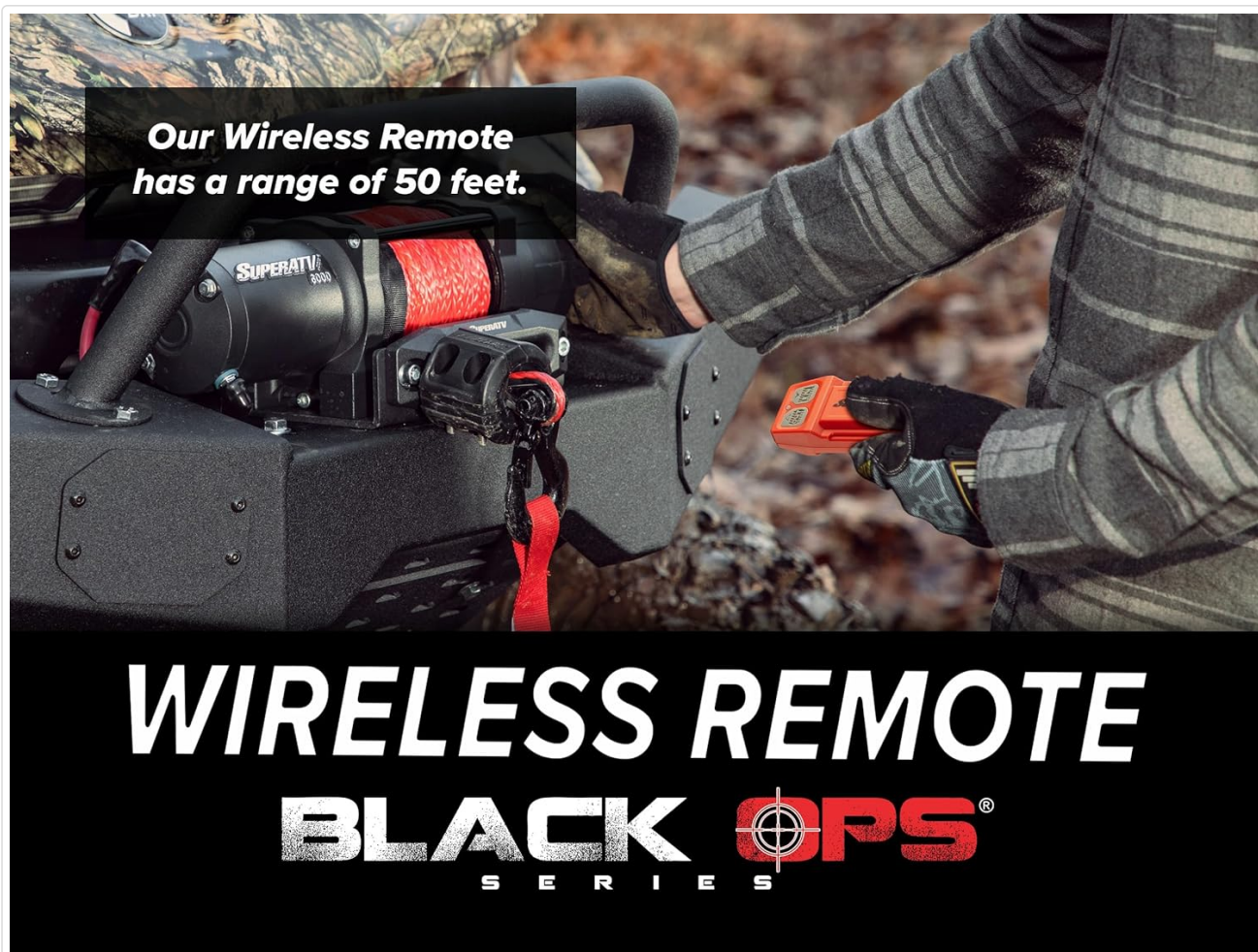
Figure 4.1: User operating the SuperATV winch with the wireless remote control.