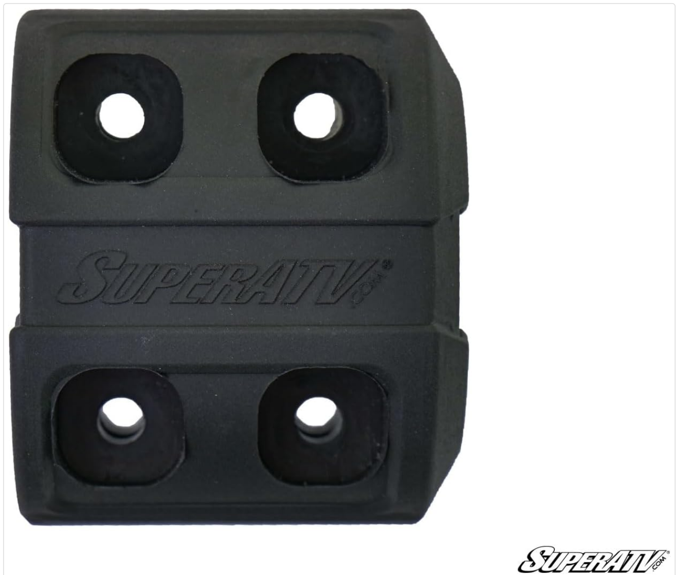
Figure 5.1: Winch rope stopper, used to prevent the hook from being pulled too far into the fairlead.