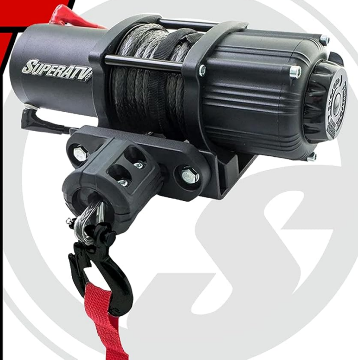
Figure 7.1: SuperATV 3500 LB Winch highlighting key specifications.