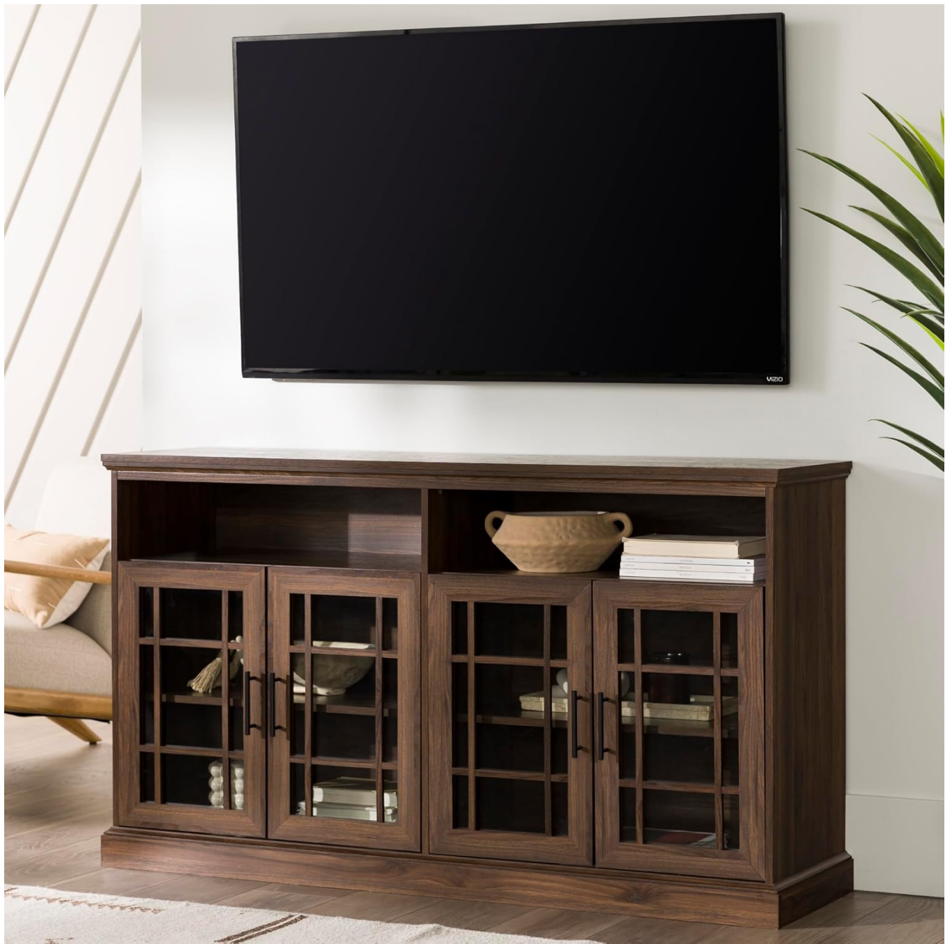
The TV stand integrated into a living room, demonstrating its use with a wall-mounted television and decorative items.