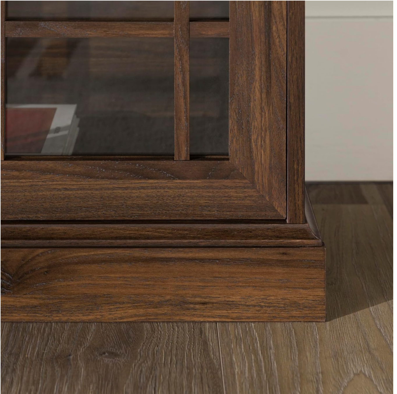
Close-up of the base molding of the TV stand, showing the craftsmanship and dark walnut finish.