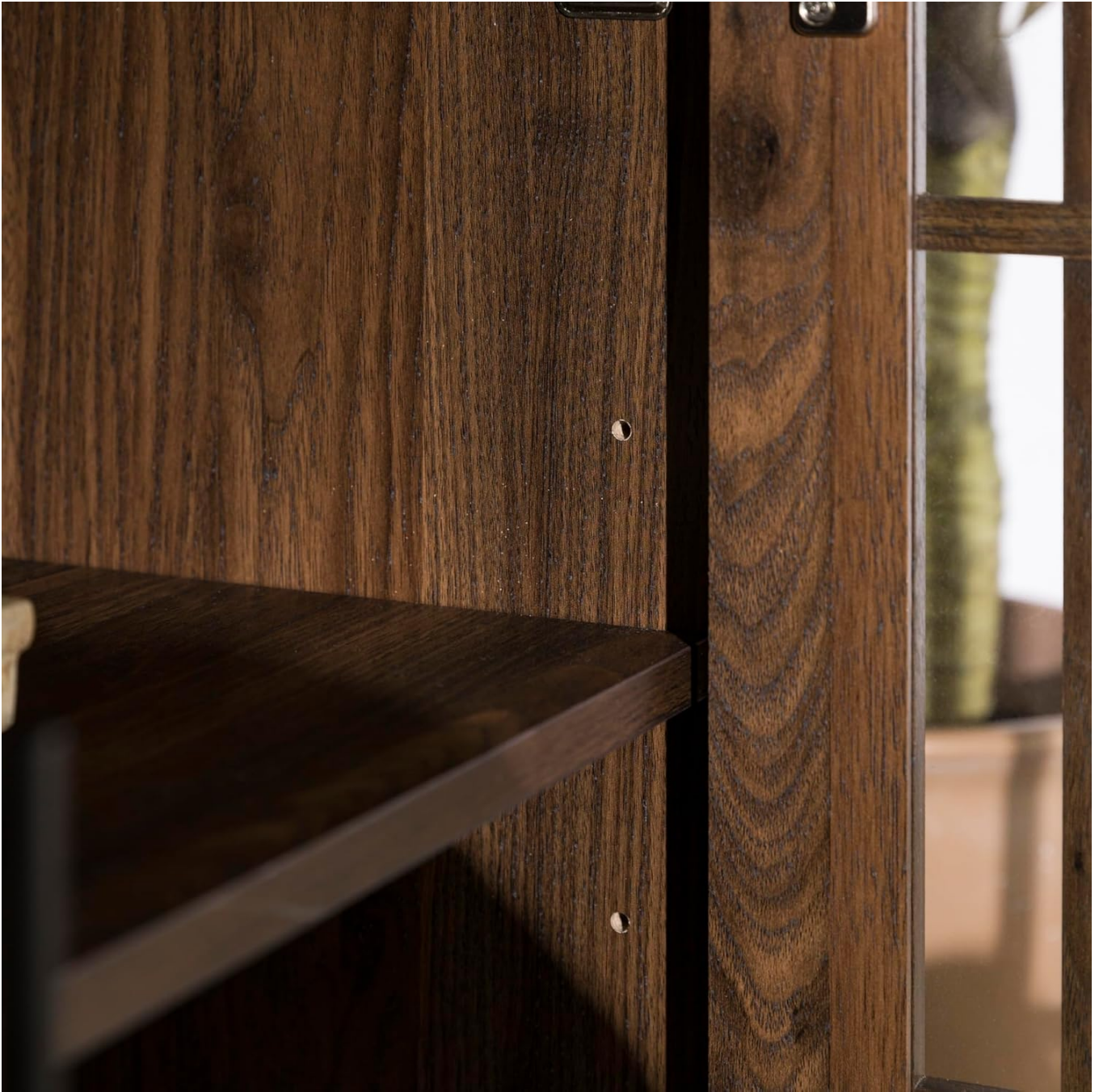
Interior view of the cabinet, showing the pre-drilled holes for adjusting shelf height.