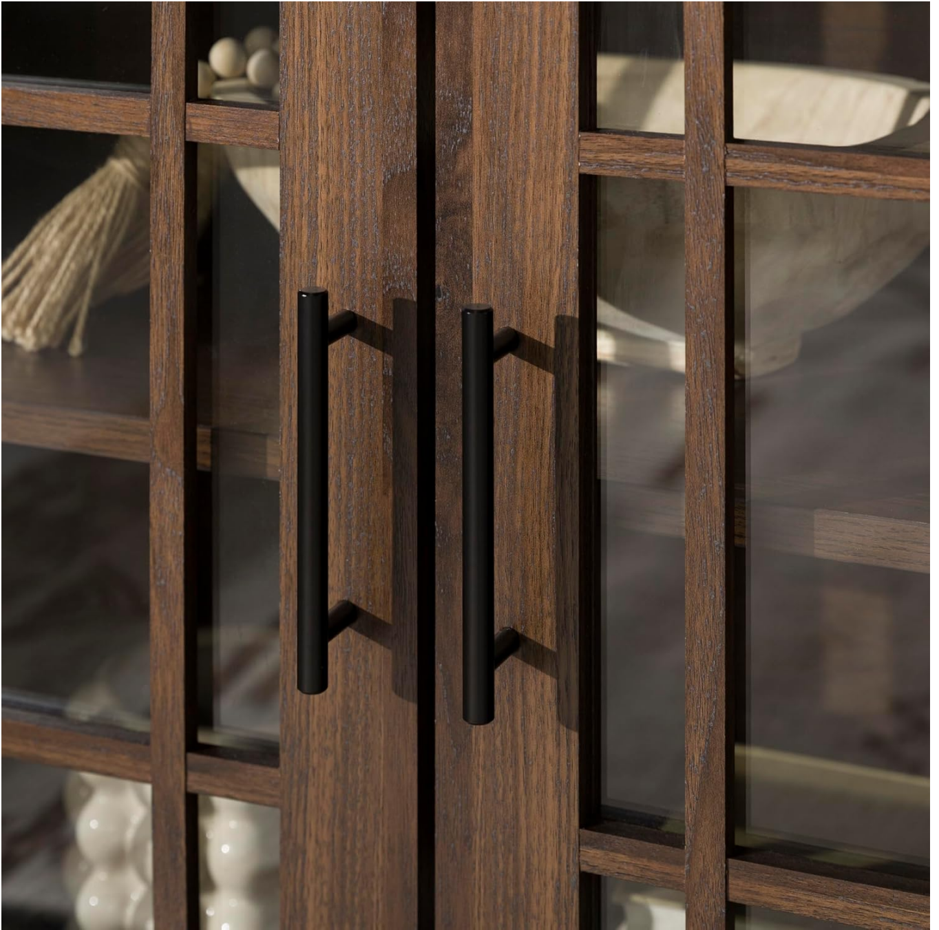
Close-up of the black bar handles on the glass doors, complementing the dark walnut finish.