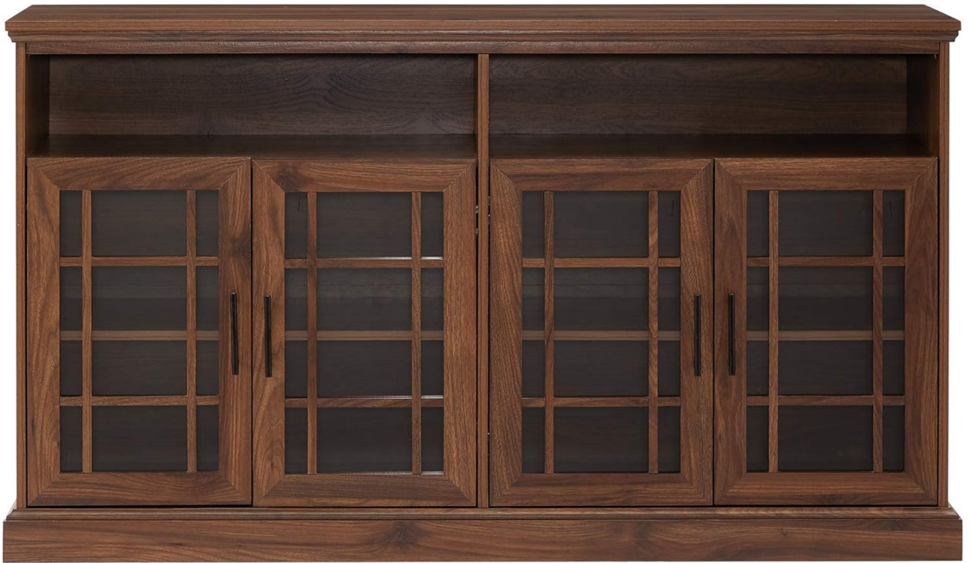
Another front view of the TV stand, highlighting the symmetrical design of the glass doors and open shelving.