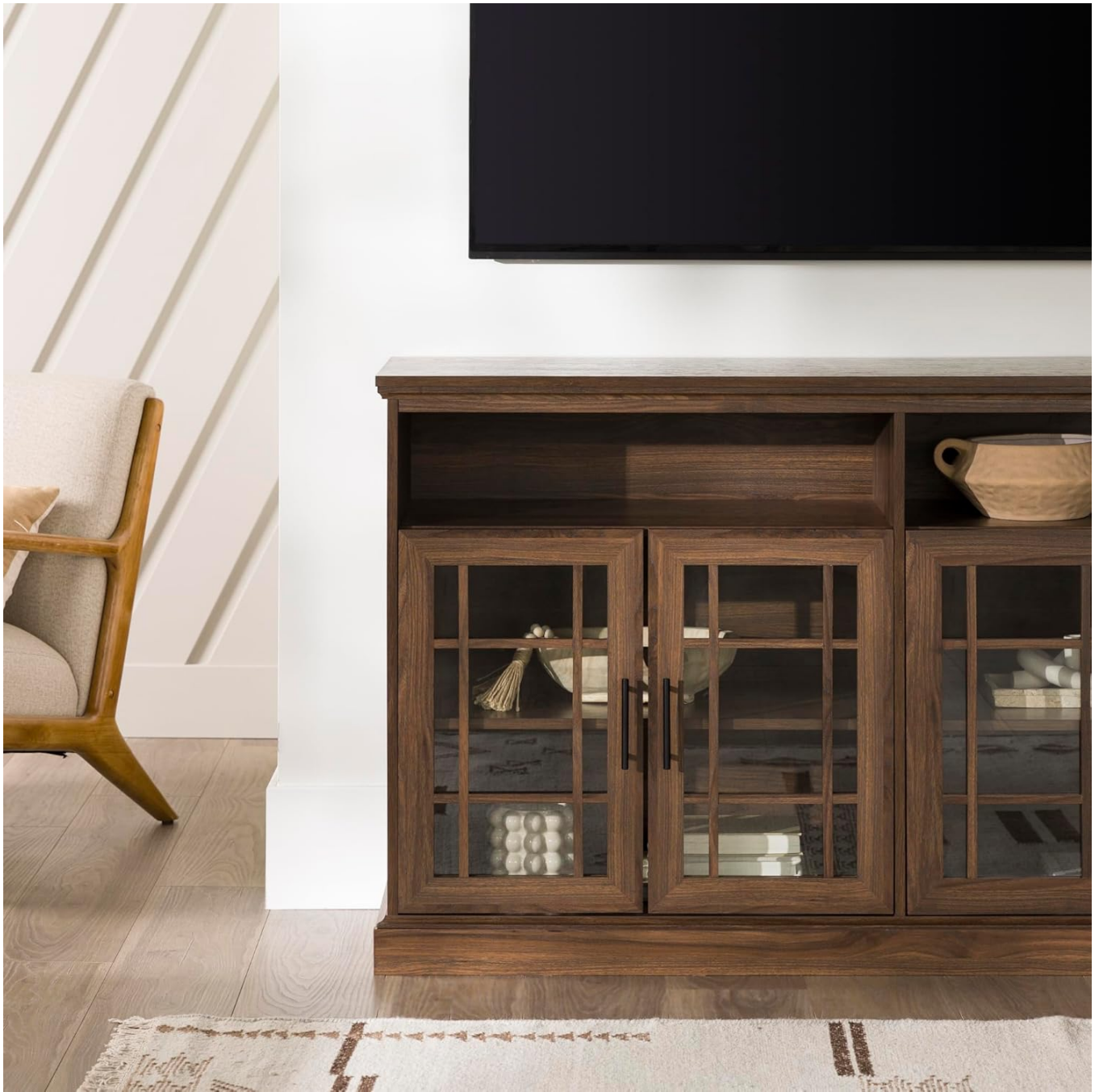
A closer view of the left side of the TV stand, showing the glass door and open shelf space, with a television above.