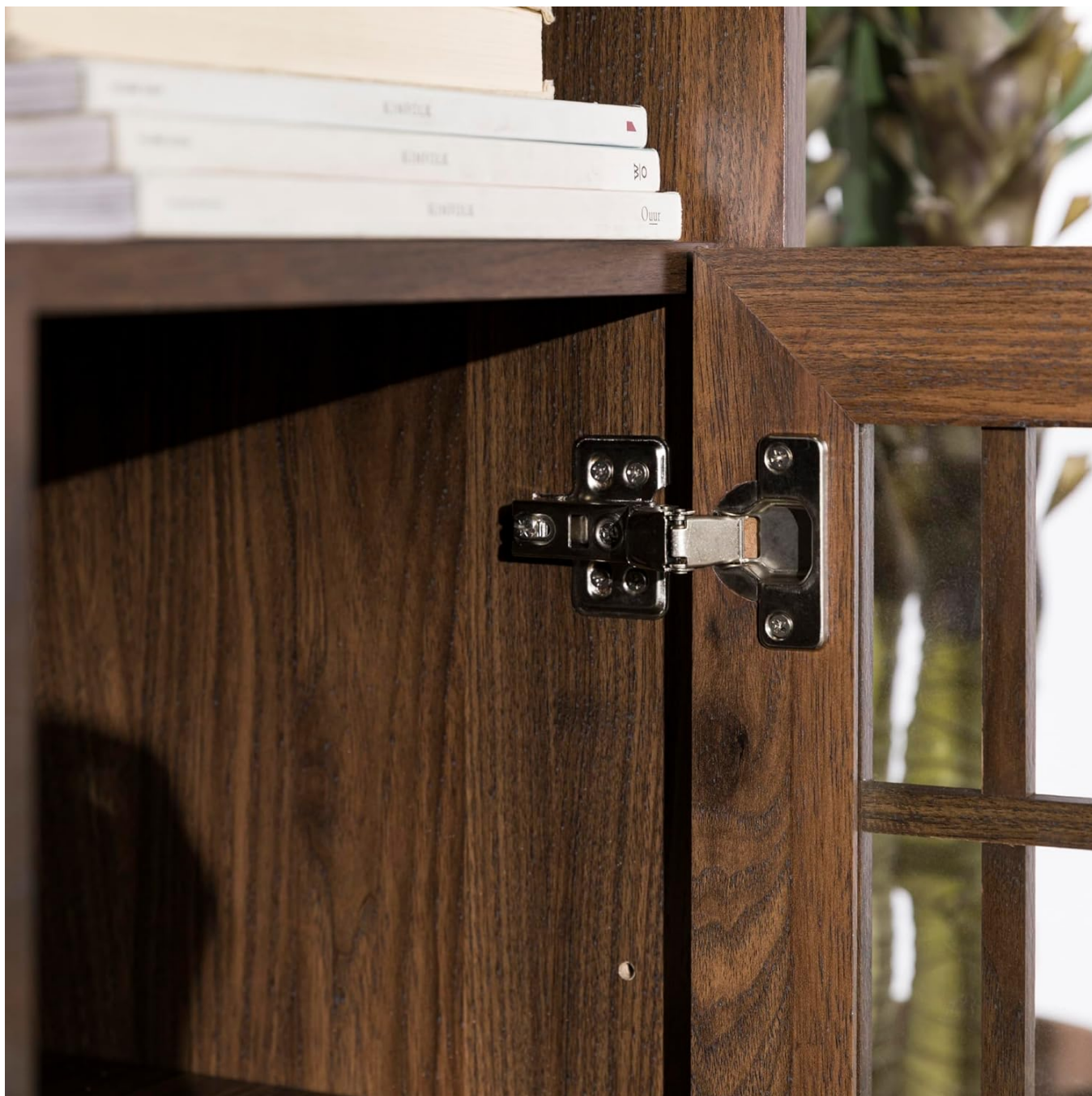
Detailed view of the soft-close hinge mechanism on one of the glass doors.