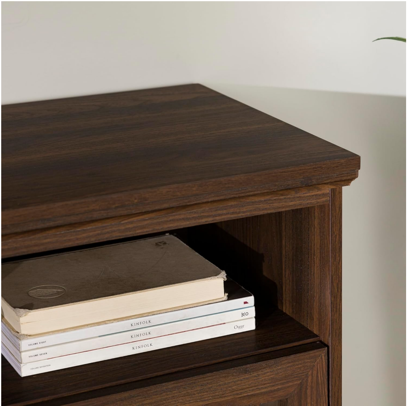
Detail shot of the top open shelf, illustrating its capacity for books or media components.