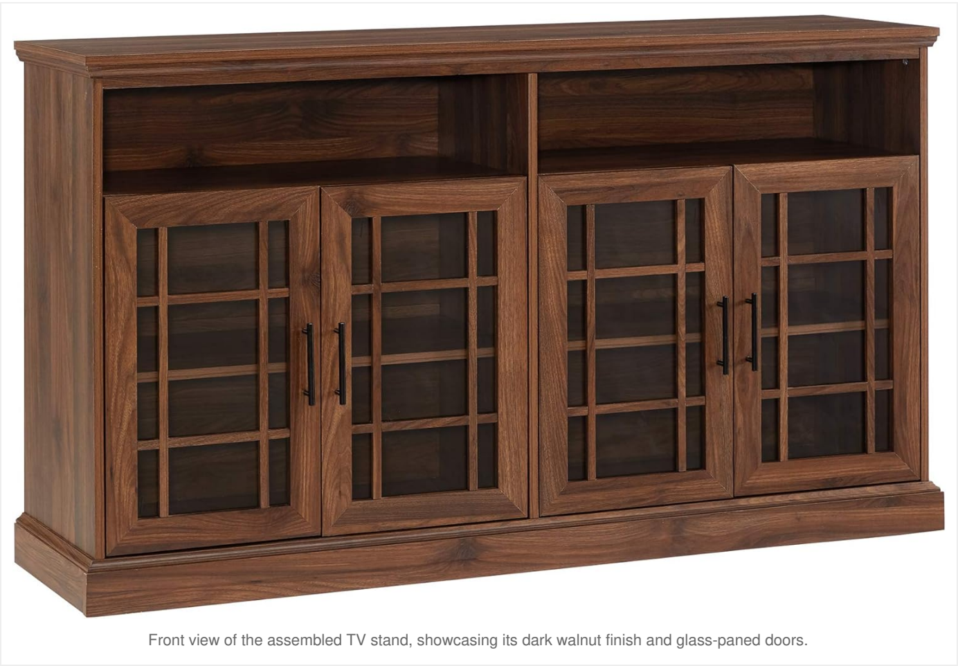
Front view of the assembled TV stand, showcasing its dark walnut finish and glass-paned doors.