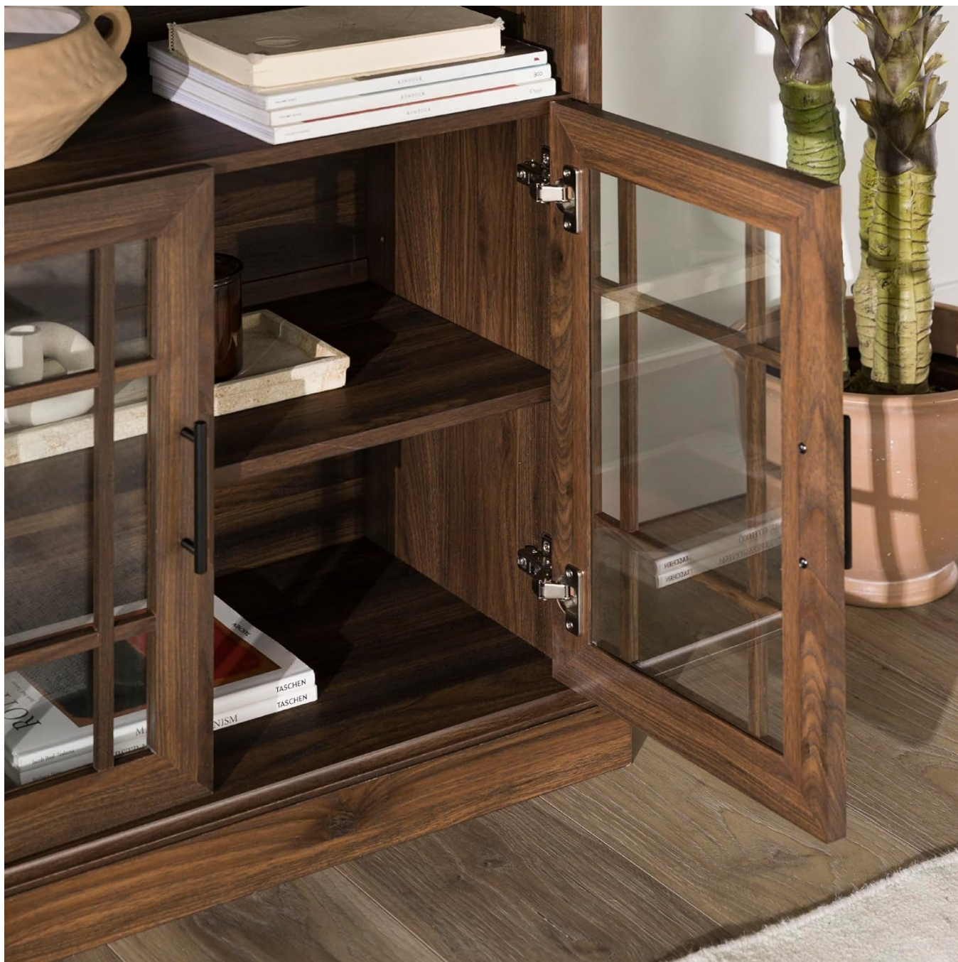
One of the glass doors open, providing a view of the interior storage space and adjustable shelf.